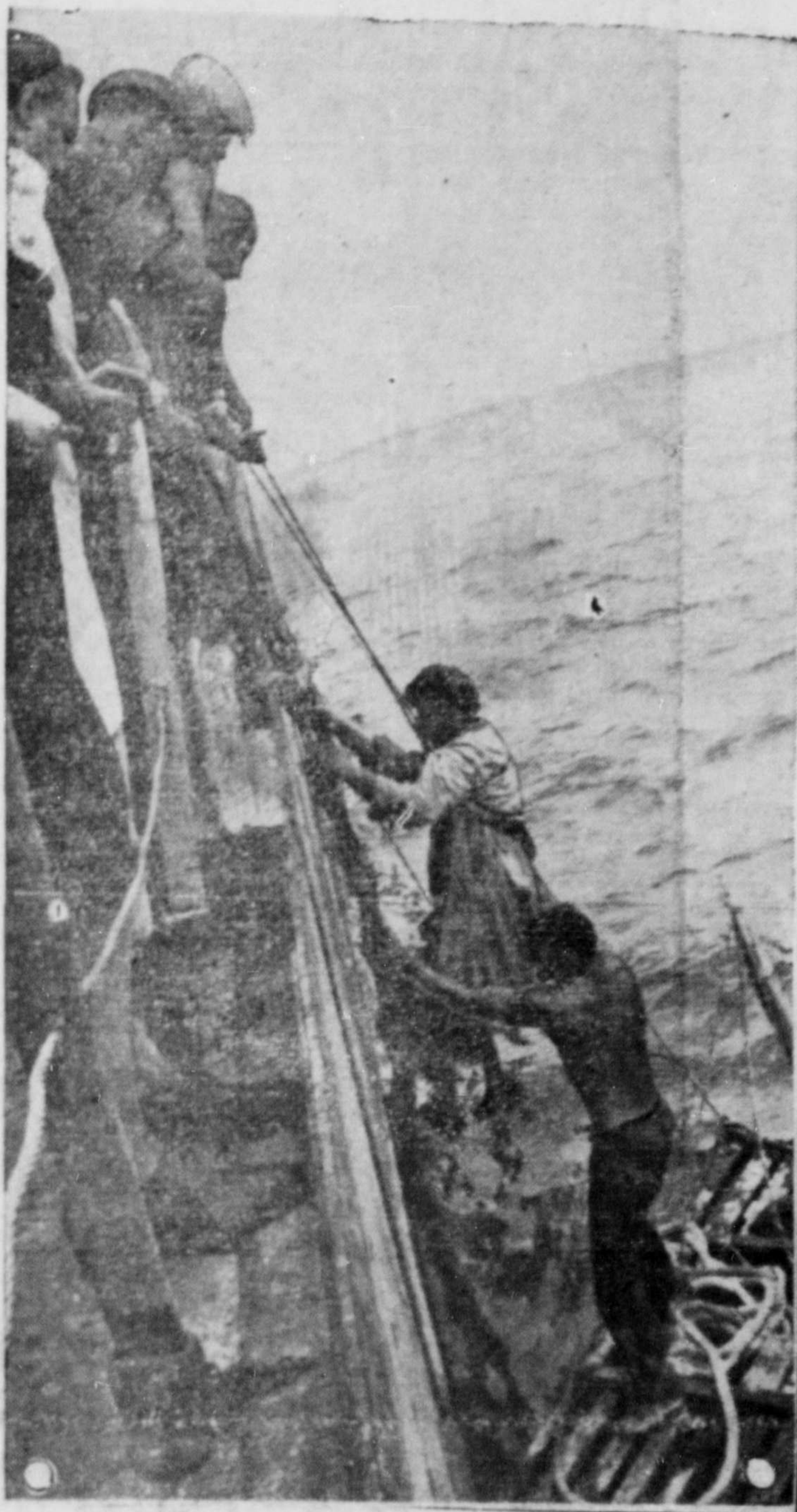
A survivor is shown clambering up the side of a rescue vessel after spending hours floating on the St. Lawrence River. Many of the rescued seamen were injured, but managed to row or raise sails on their life rafts which brought them ashore and to rescue ships.