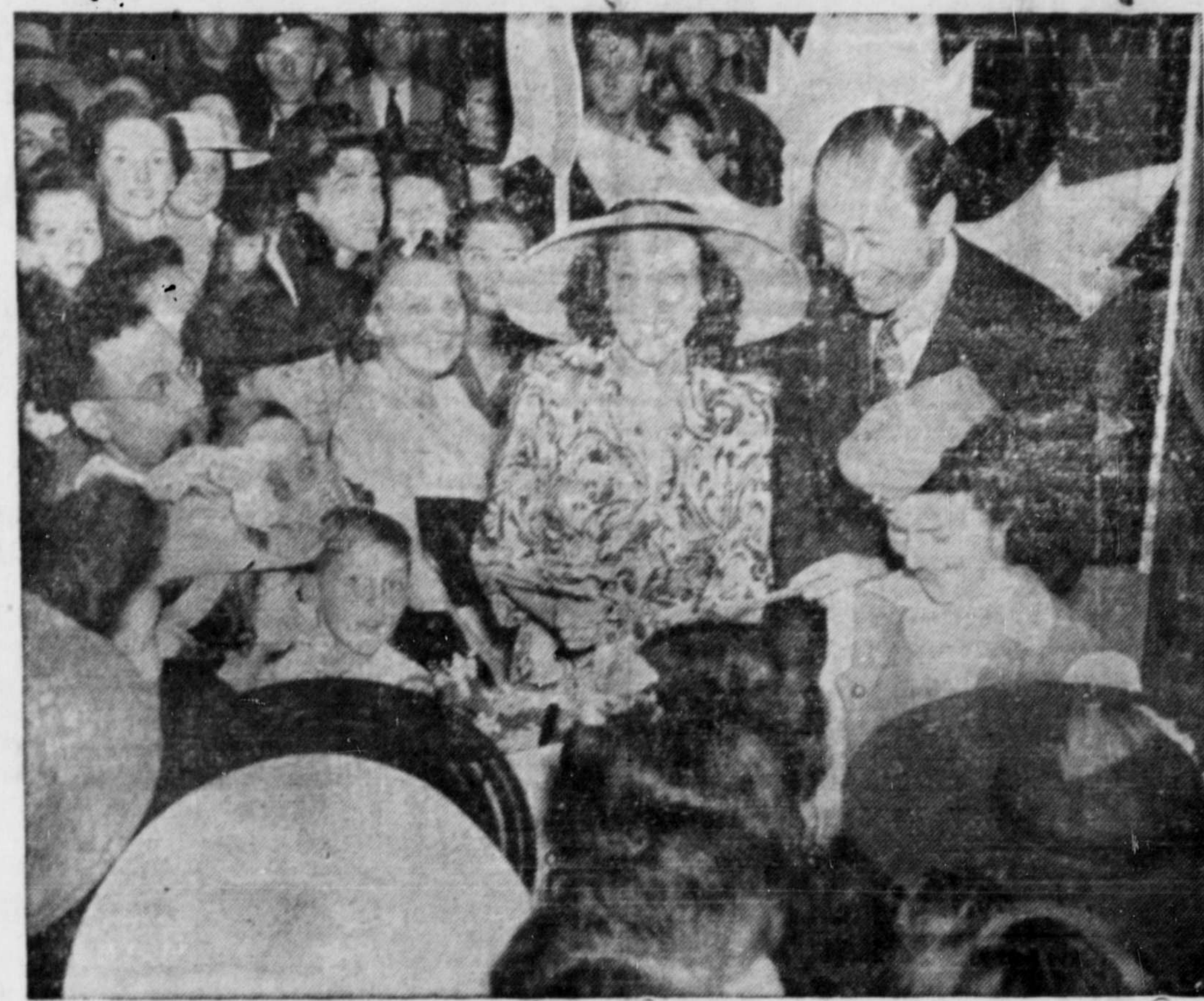
Gloria Swanson, motion picture star of another day whose screen allure was the talk of the continent, took time off from her stage appearance at Toronto to boost the sale of War Savings Stamps. Great crowds gathered at the Stamps Booth of a department store when she joined with Miss Canada to get more "fighting money" for Canada's armed forces.