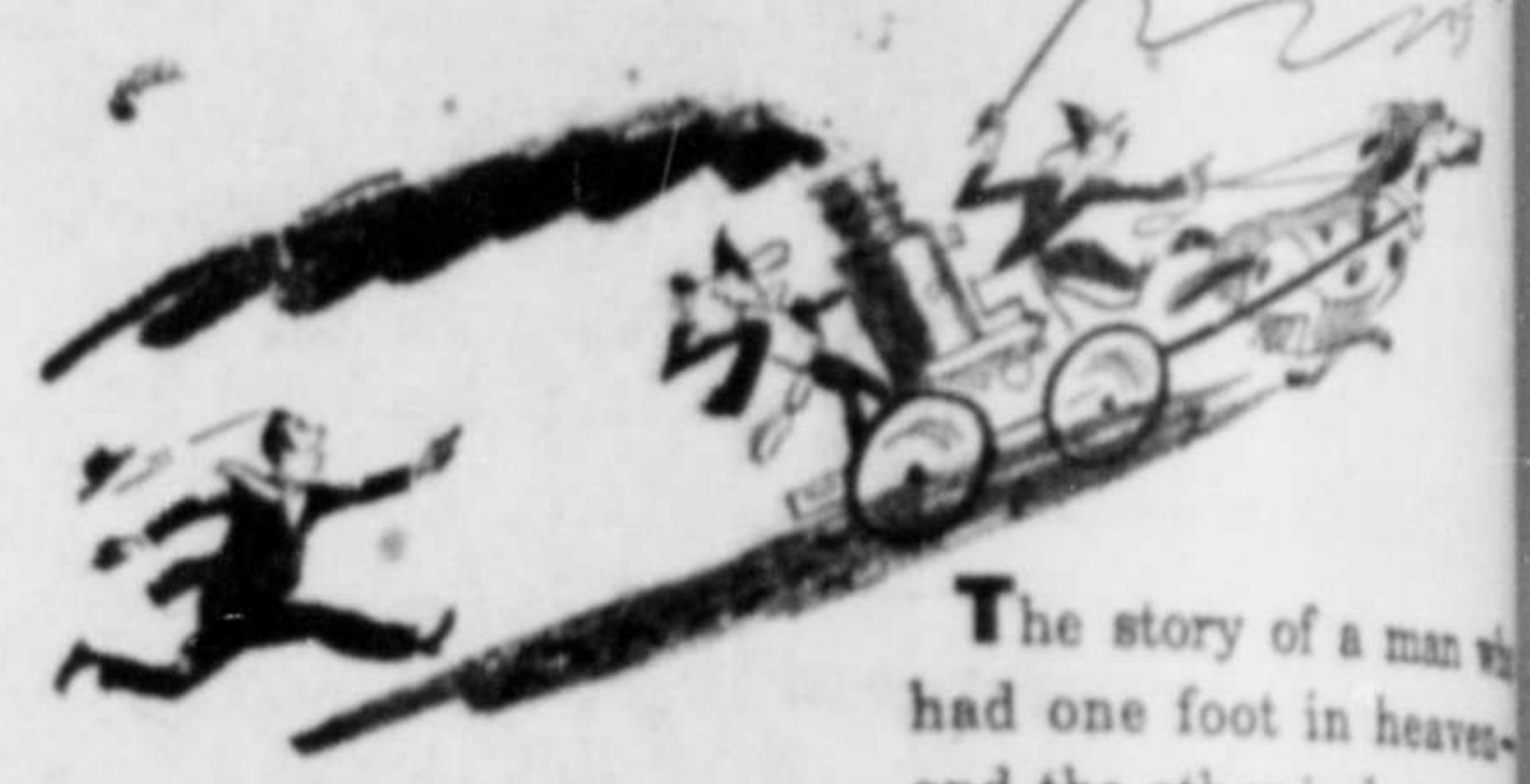
The story of a man who had one foot in heaven and the other in his wife's arms.