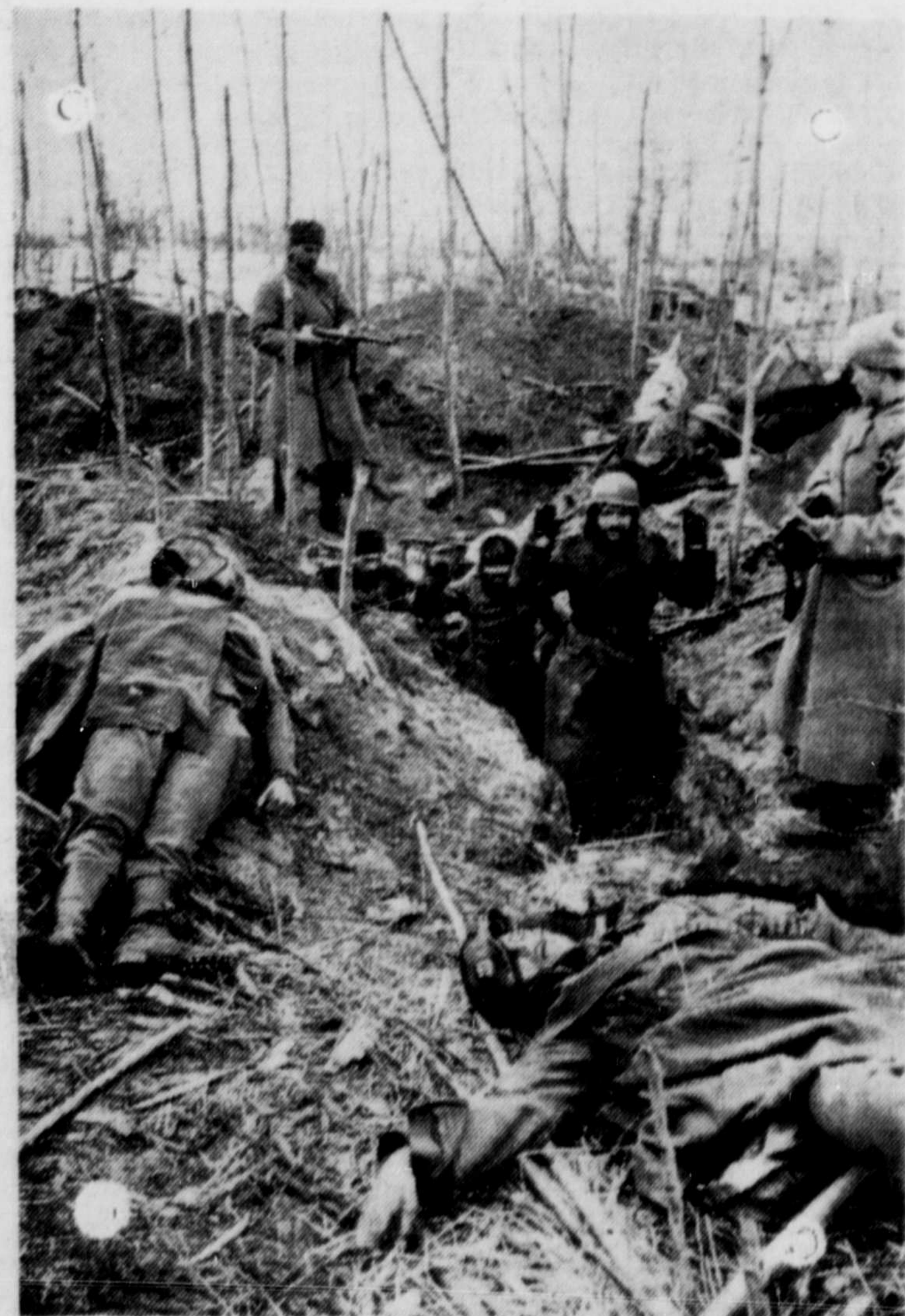
While three of their countrymen lie lifeless outside the trench, three German soldiers surrender to Red Army men somewhere on the eastern front.