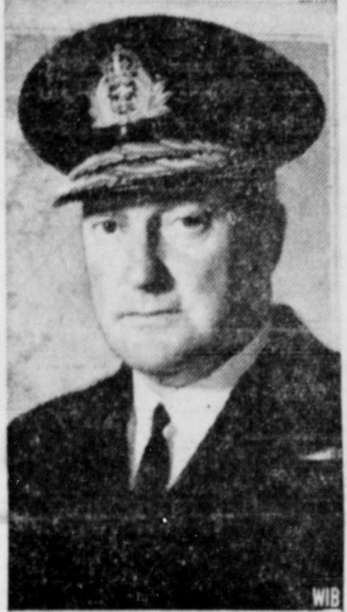
REAR-ADMIRAL L. W. MURRAY

The Royal Navy now has fifteen battleships and fifteen heavy cruisers in commission.