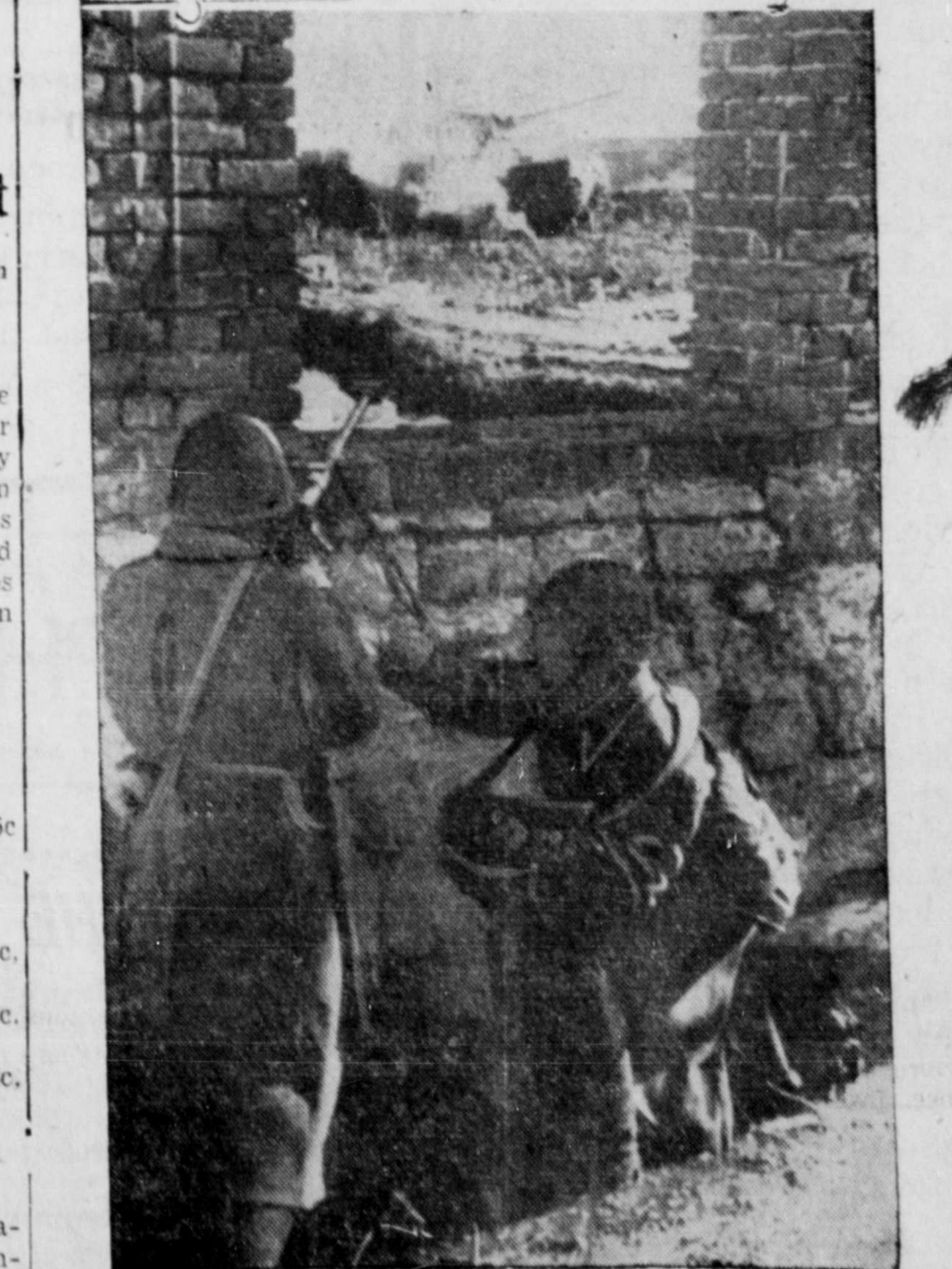
A Red army tank destroyer is shown in action smashing Nazi tank attack in a war-wrecked town somewhere in Russia. One man aims and fires the heavy long-barrelled anti-tank rifle while another man hands him the ammunition.

Tonight's train, due from the East at 11 p.m., was reported this afternoon to be thirty minutes late.