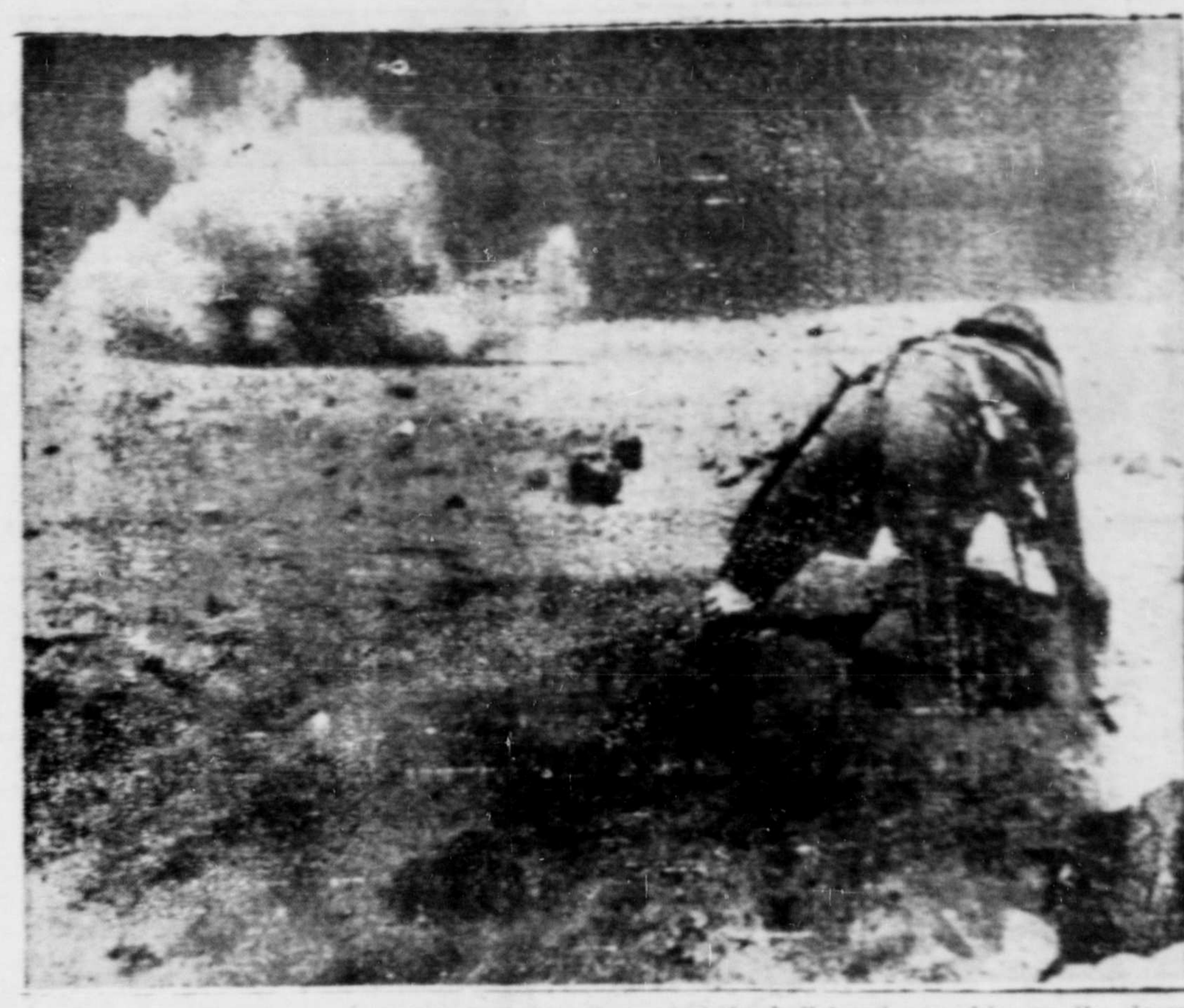
A British soldier does a quick duck knees as an Axis shell burst near him on the desert during the action near El Alamein. Despite heavy German and Italian attacks on this line, the British Imperials are holding fast and making gains in some spots. This picture was radioed from Cairo.