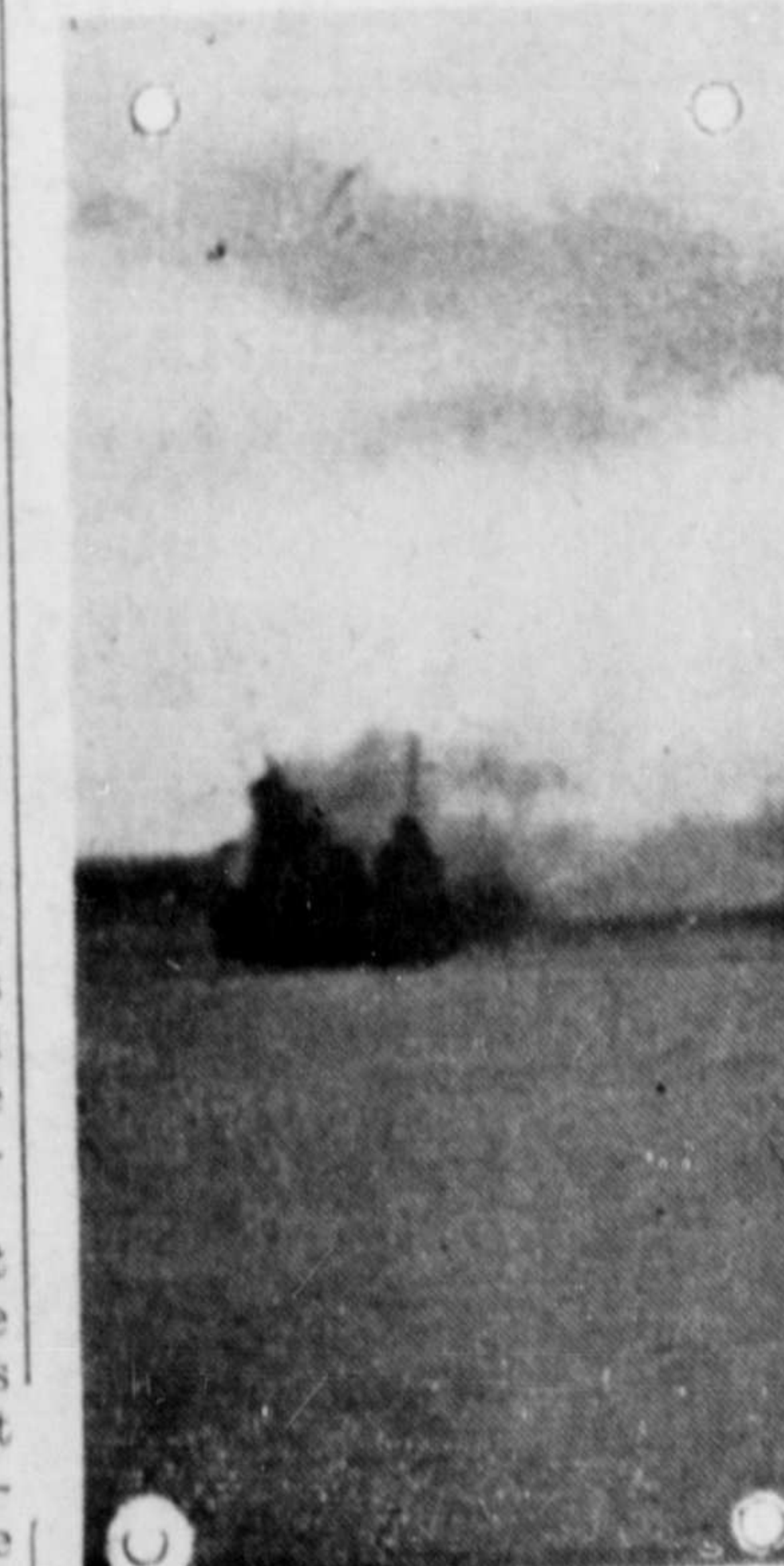
H.M.A.S. Canberra, Australian cruiser, burns after being mortally hit in the Solomons area. An unidentified destroyer stands by the stricken vessel. This cruiser participated in the American offensive on the Solomon Islands early last August. Her loss was announced prior to release of this photograph.