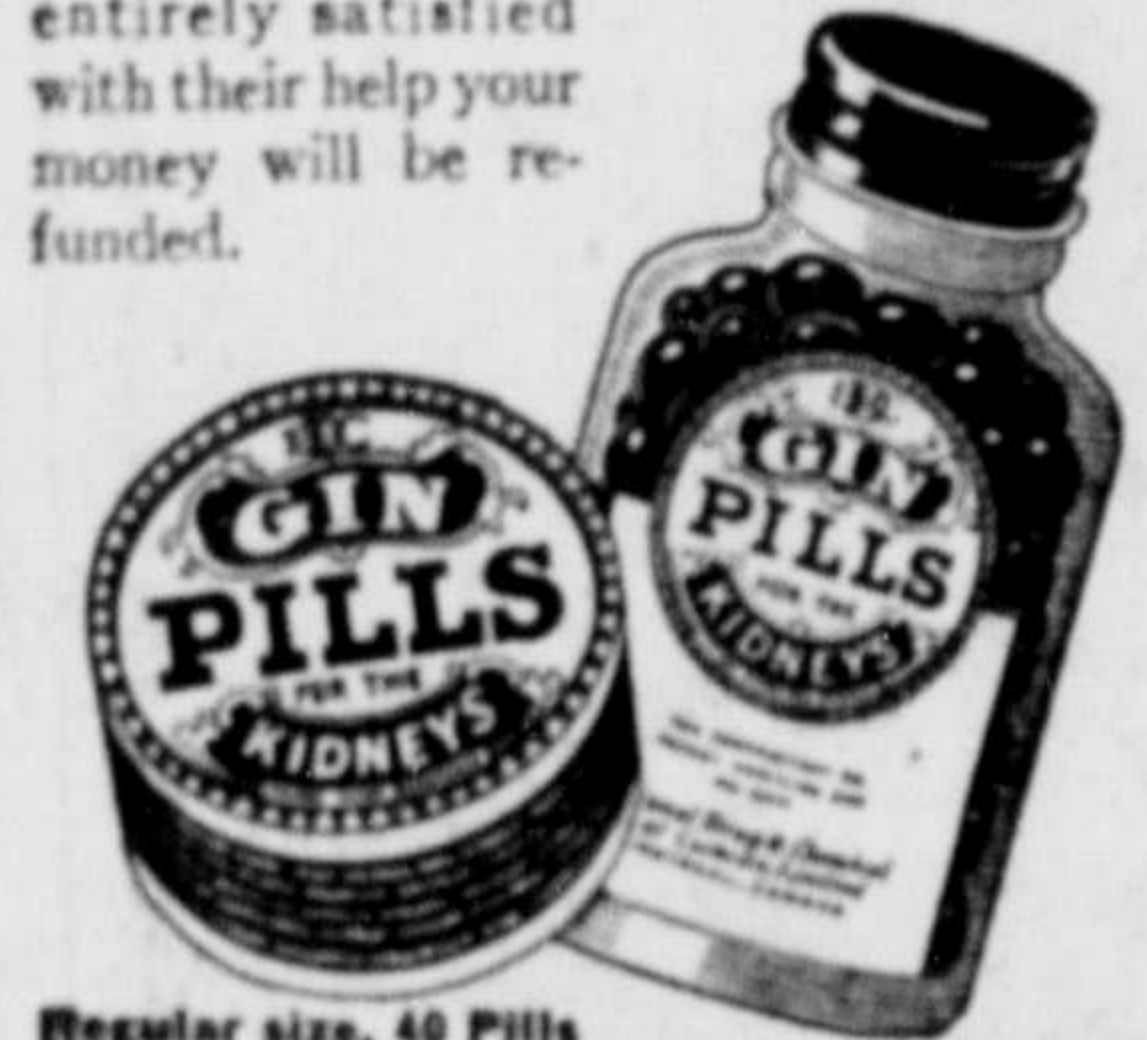
Regular size, 40 Pills Large size, 80 Pills (In the U.S. ask for "Gino Pills")

Gin Pills are sold on a "satisfaction or money back basis". If you're not entirely satisfied with their help your money will be refunded.