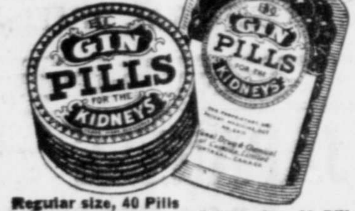
Regular size, 40 Pills Large size, 80 Pills (In the U.S. ask for "Gino Pills")

Gin Pills are sold on a "satisfaction or money back basis". If you're not entirely satisfied with their help your money will be refunded.