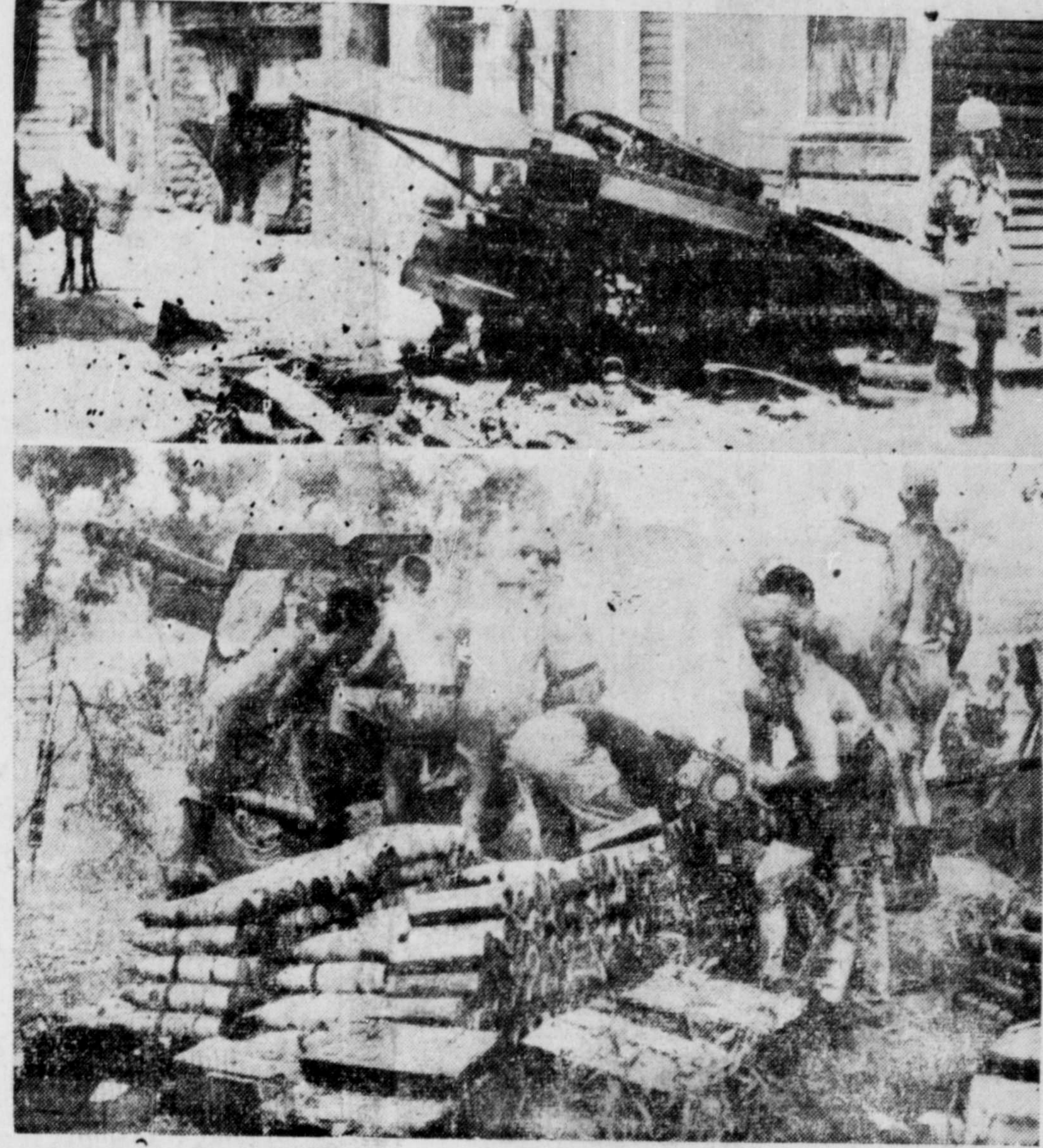
Stripped to the waist, artillerymen with the Canadian forces in Sicily are pictured feeding one of the guns engaged in pounding German defence lines near Nissoria. The formidable fire power of their batteries and efficiency of the Canadian gunners was responsible in no small measure for infantry advances in the bitter fighting inland toward Mount Etna. One knocked-out target is shown at top—the wrecked hulk of a German tank discarded in the main street of Leonforte.