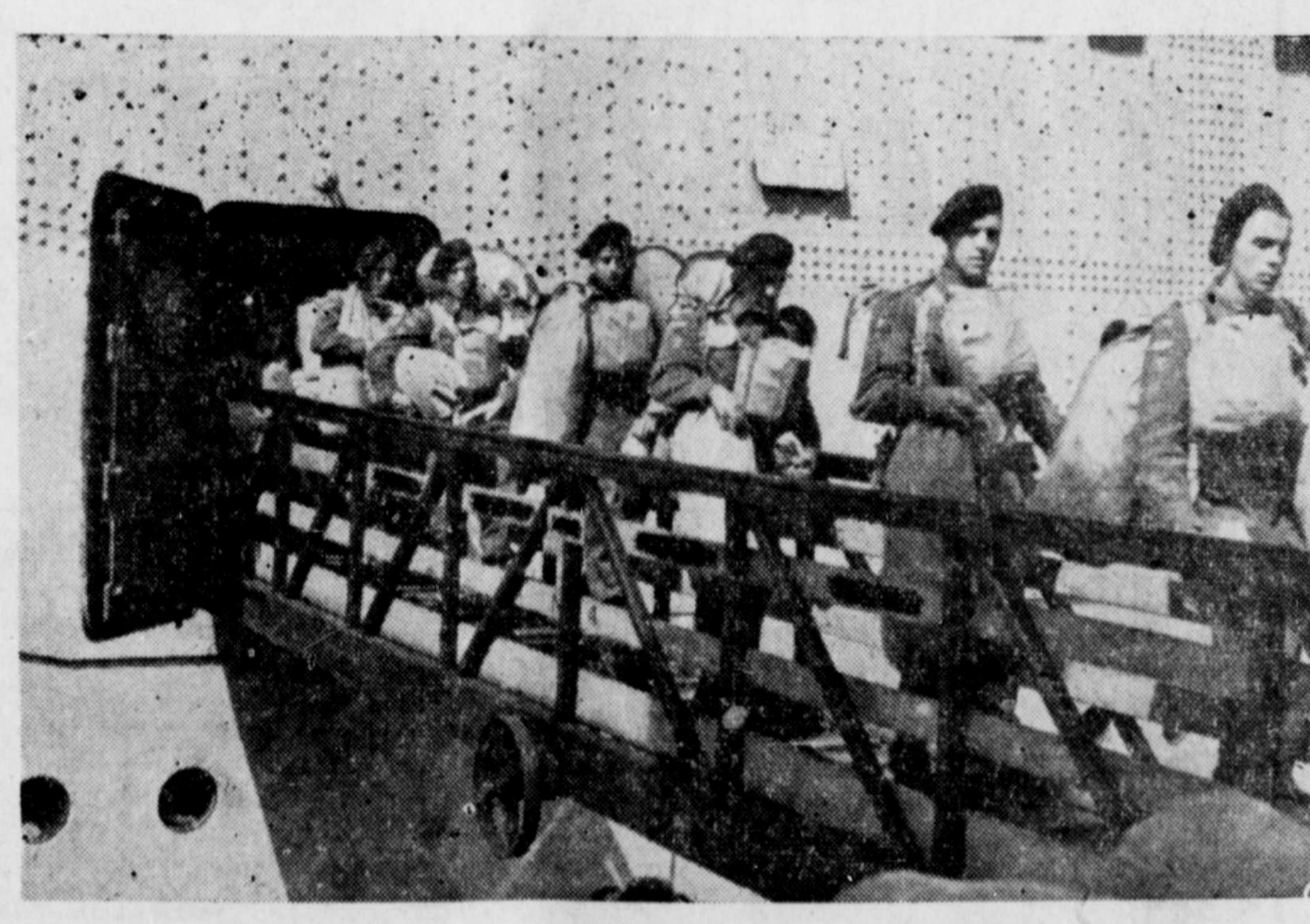
Included in a recent large draft of reinforcements for the Canadian army overseas were three regiments—one from western Canada, another from eastern Ontario and the third from the maritimes. Here are some of the men disembarking at a British port.