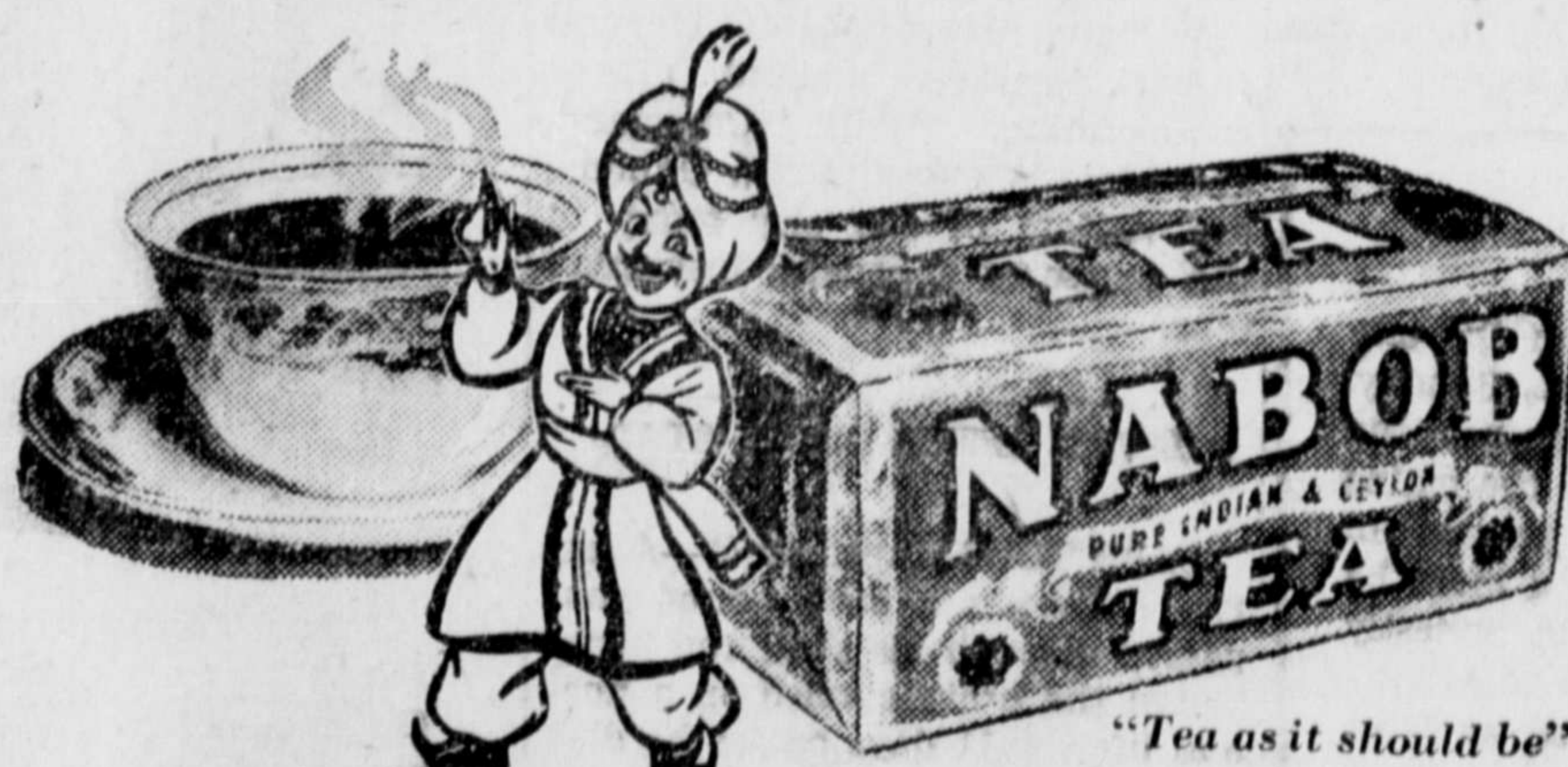
"Tea as it should be"

Tune to the new and entertaining radio show . . . "Nabob Party Time."