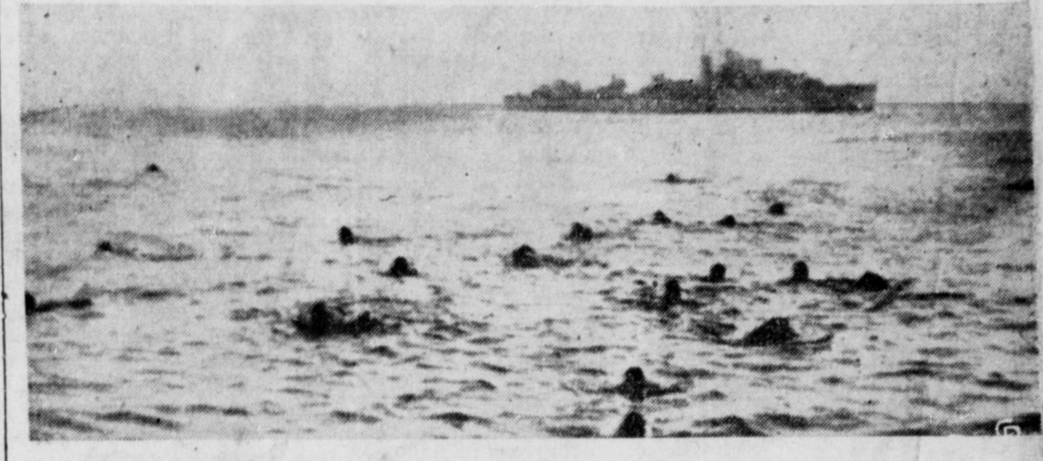
This photo, made from the British corvette Dianthus, shows members of the crew of a German submarine swimming towards the ship after their U-boat had been sunk by the H.M.C.S. Assiniboine, BACKGROUND, in the Atlantic. The Dianthus picked up the survivors and two days later rammed and sank another U-boat which she had forced to the surface with depth charges.