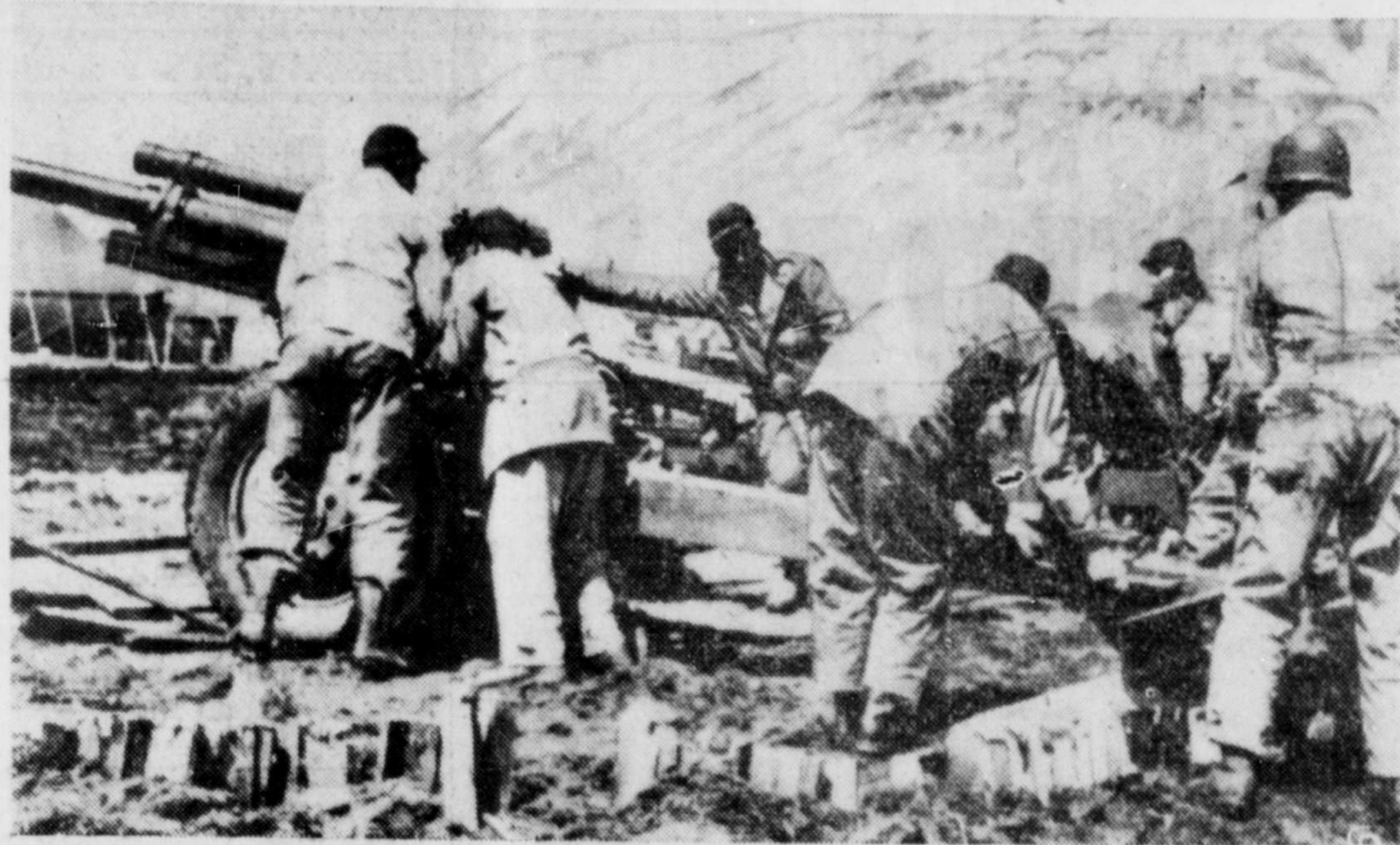
An American gun crew is blazing away with its 105 mm. weapon to blast the Japs out of positions in the Maccre-Chichagof pass during the successful campaign on Attu Island. The photo was made from Massacre Bay beach. This particular piece of artillery poured no less than 2,000 shells into Jap positions in four days.