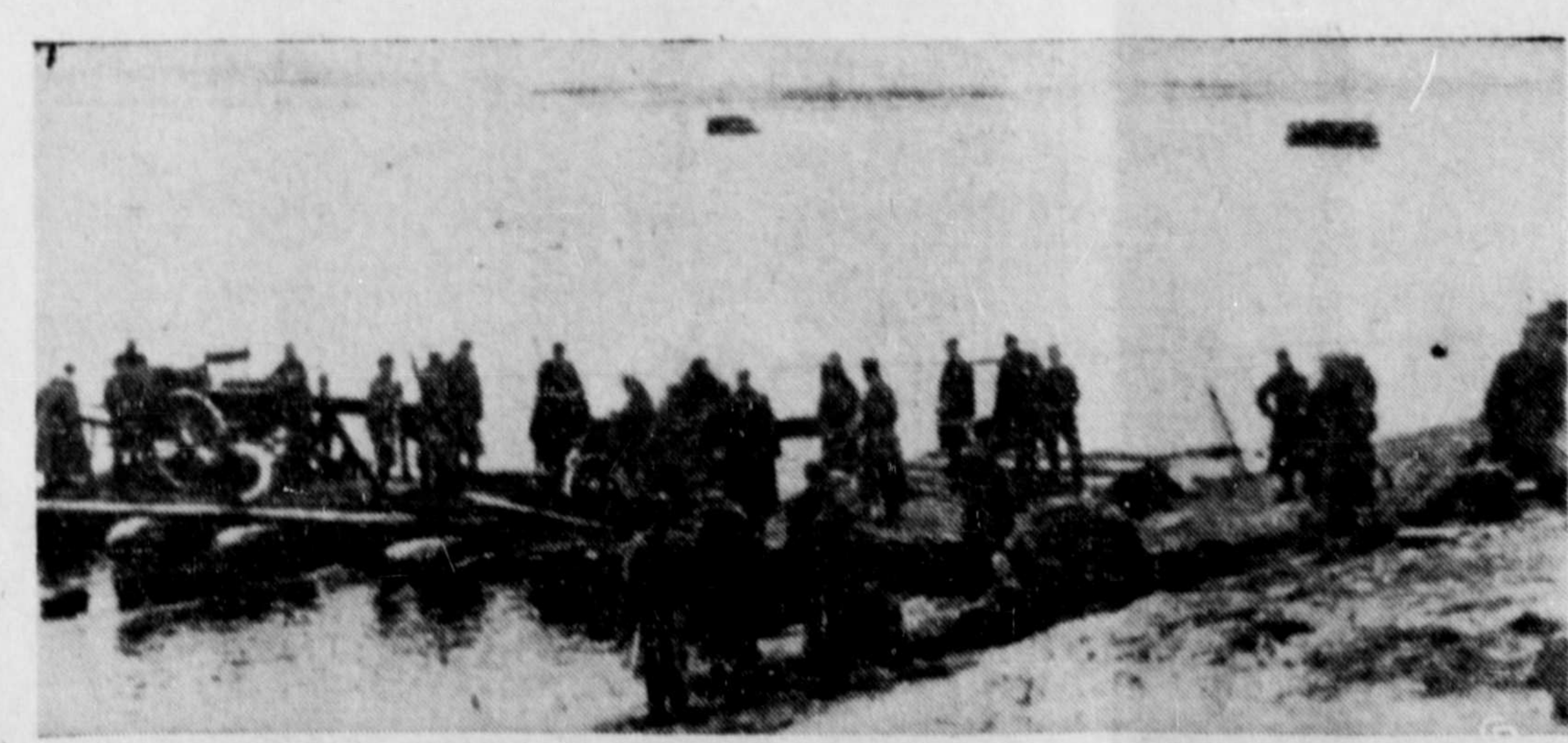
When the history of the campaigns of the war is written, a special chapter will be devoted to the historic moment that is photographically recorded here. This is the crossing of the Dnieper from the east to the west bank in the battle against the retreating Germans. This particular crossing was at the widest part. Artillery is being loaded on small rafts.