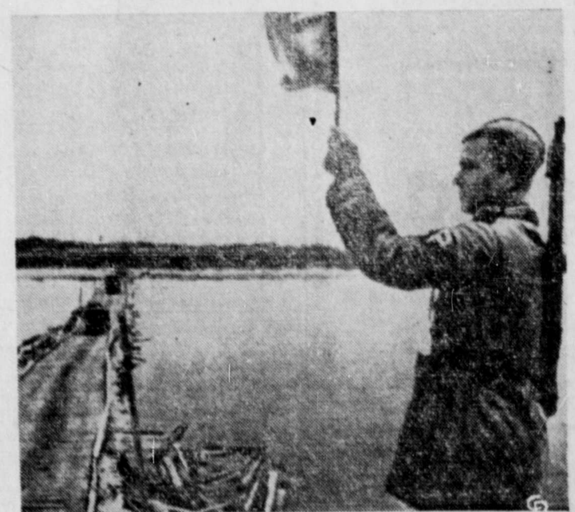
This picture taken during the crossing of the Dnieper was made from the German side of the river after a bridgehead had been established. Here Russian trucks are seen rumbling across.