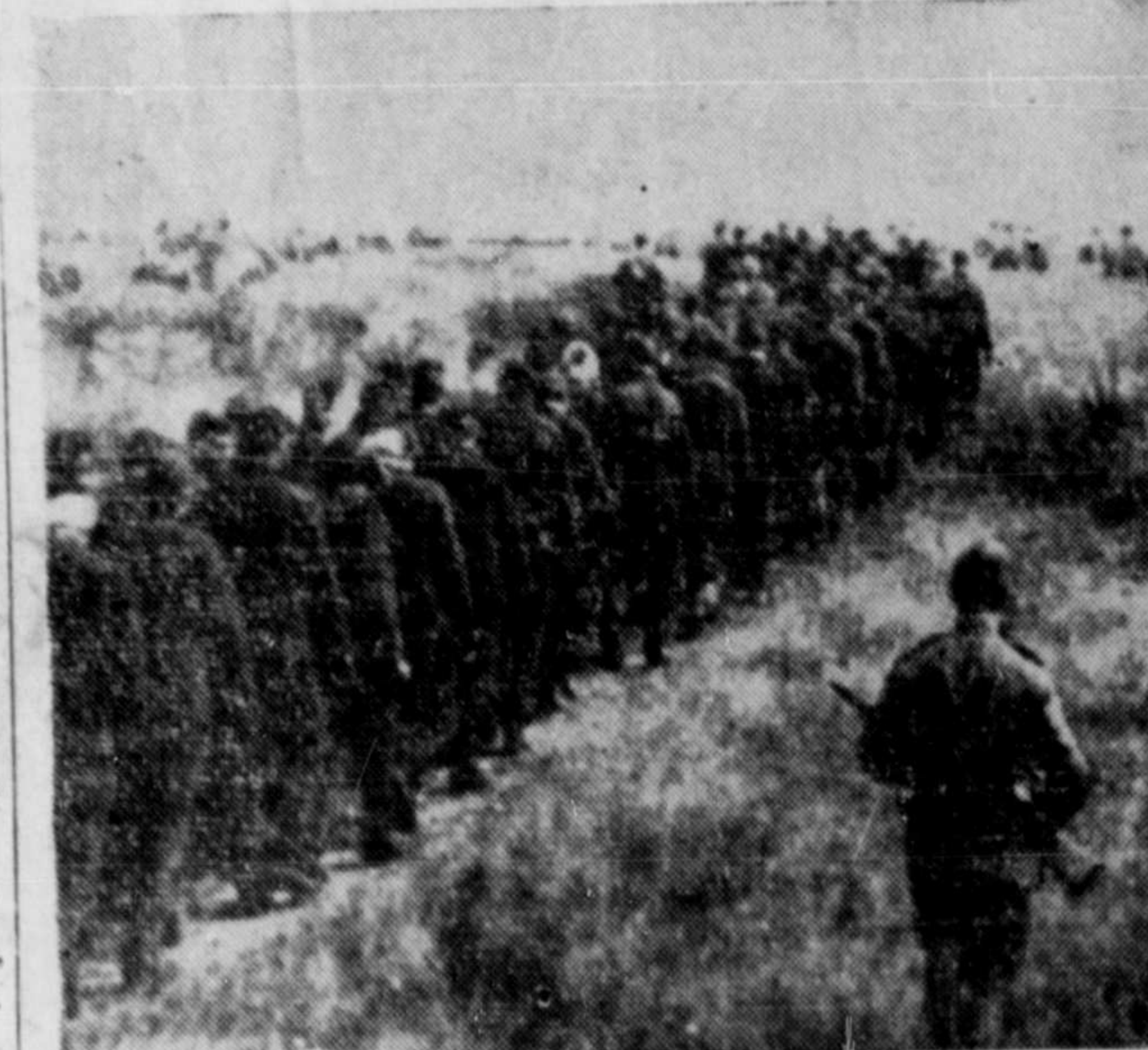
Here is a picture showing a long line of German soldiers taken captive on the eastern front. Many of the men wear bandages as they are marched to the rear. For them the war is over. For others, still desperately resisting the Russian push to the west, death or capture looms.