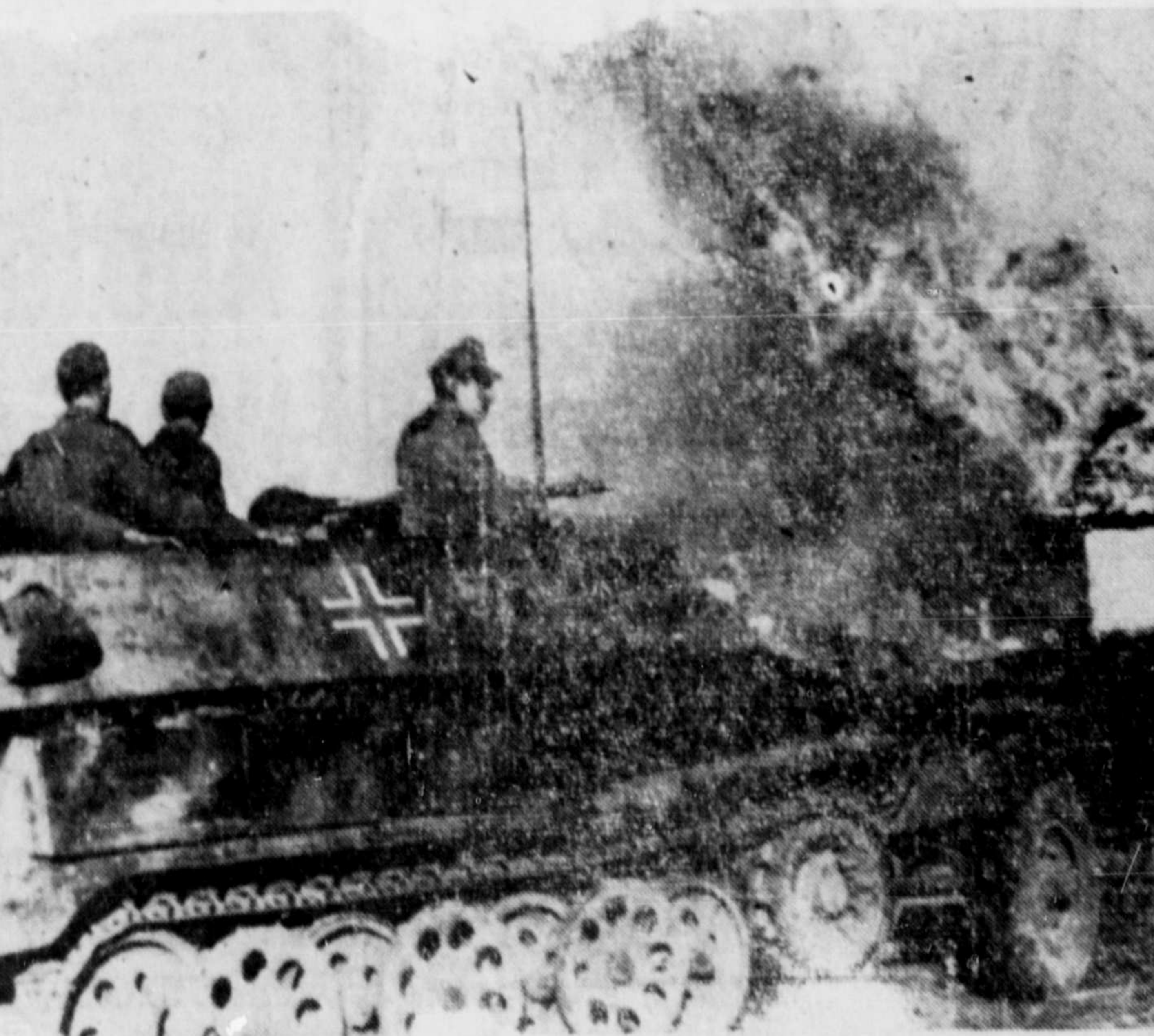
Retreating Nazis, jamming a half-track, pass through a burning Crimean village as they flee the Russian trap closing off the peninsula. The back of the Germans was broken at Melitopol and the remnants fled toward the Dnieper in an effort to use the river as a barrier between them and the Reds.