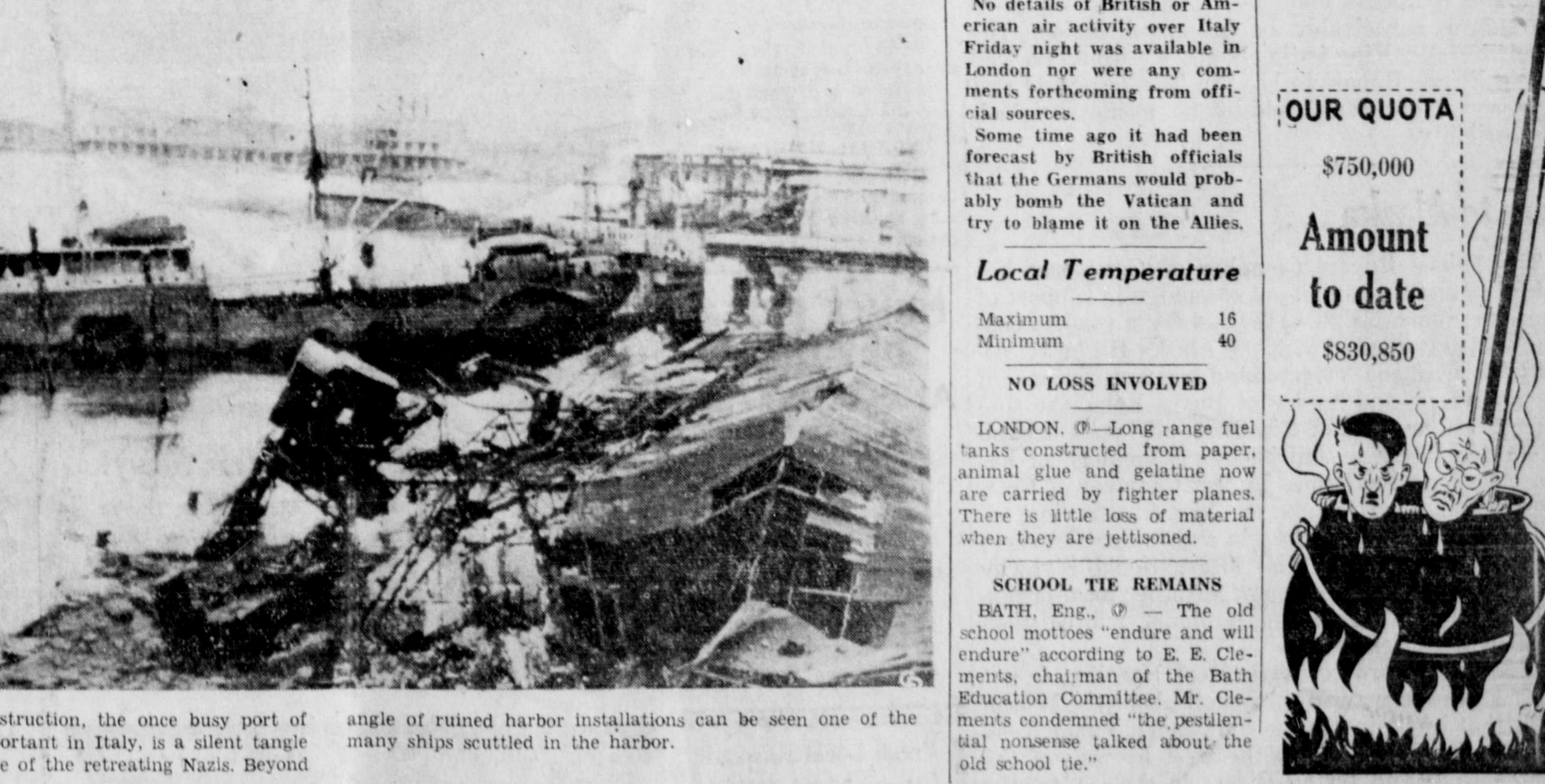
A scene of universal destruction, the once busy port of Naples, one of the most important in Italy, is a silent tangle of wreckage, left in the wake of the retreating Nazis. Beyond angle of ruined harbor installations can be seen one of the many ships scuttled in the harbor.