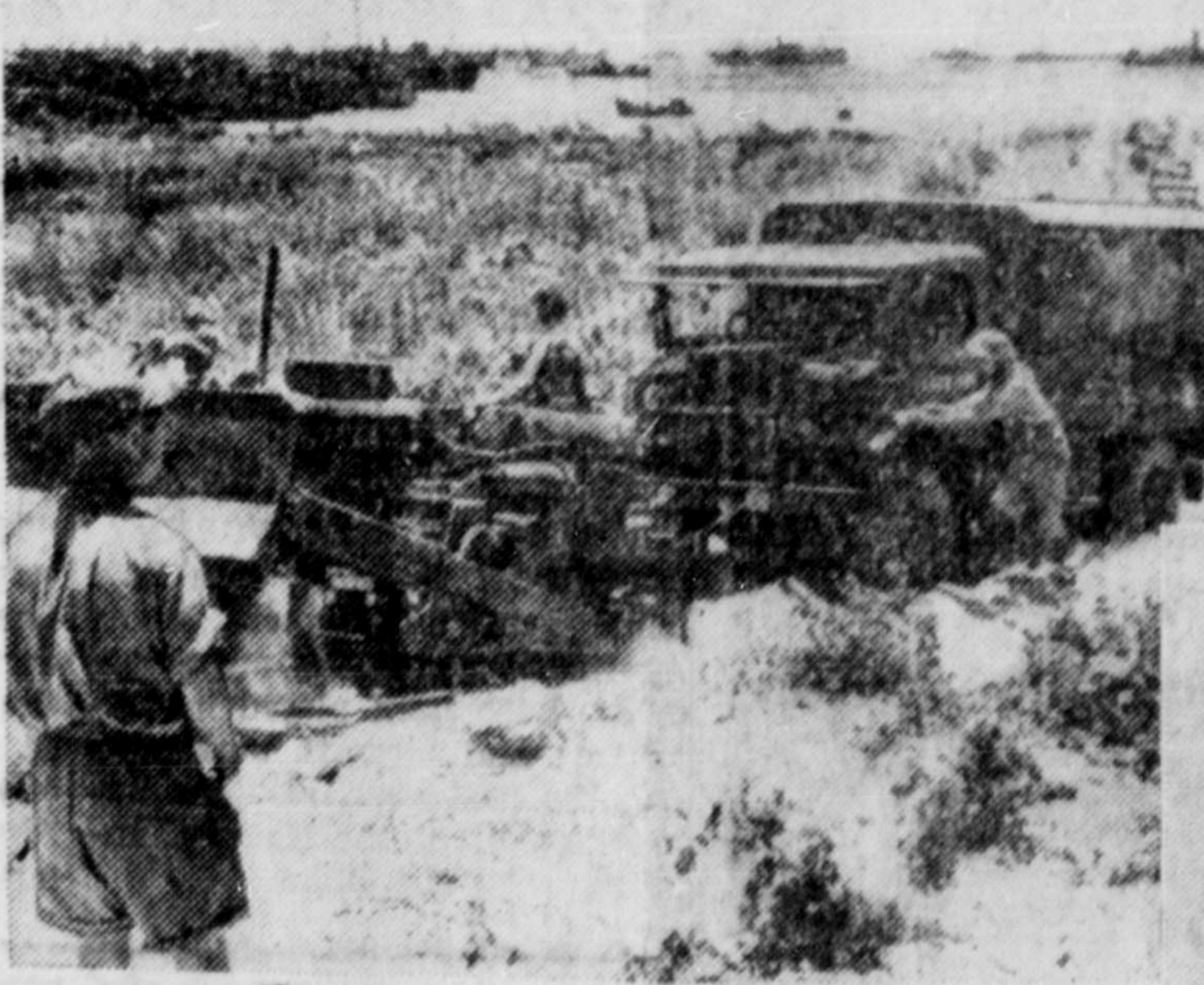
• Bulldozers come ashore right behind the landing parties and started levelling to form roads for the heavy trucks. Coming up behind the bulldozers from the beach is a long line of motor vehicles and in the distance can be seen the naval equipment and other boats.

the fellows back home who sweated to turn out these countless cars moving forward into tough engagements could only see the splendid product of their toil and skill fighting against rough conditions, they'd be just as proud as the lads who are in this scrap. We travelled for hundreds of miles over the rough, rocky roads of Sicily to the steep "Devil's Gap" of Italy. It is interesting to note that the song hit "Lily Marlene" was first recorded in our "Chevy". But we nearly lost the truck and all when first we tried to record a close-up of "noise of battle". Our guns were going to pump forty thousand shells on a feature the Germans held, so we drove up steep brown hills where our batteries were parked in a dried-out stream. In the end the enemy was routed by our Infantry without a shell being fired and we were terribly disappointed with the loss of a fine recording. We weren't disappointed, however, with the breath-taking never-to-be-forgotten trip through Sicily and the toe of Italy in our trusty old "Chevy".