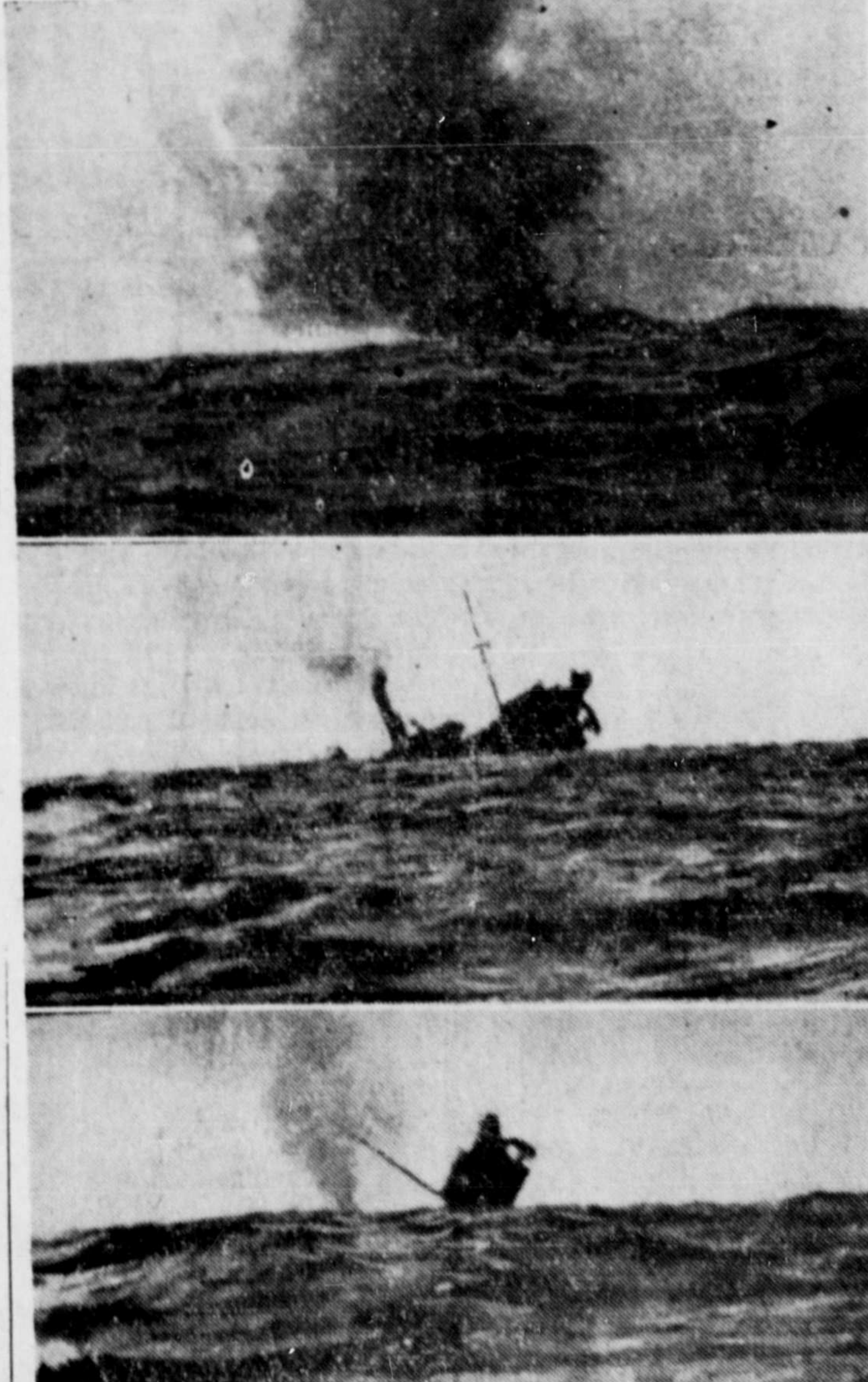
Three dramatic pictures snapped through the periscope of a U.S. submarine prowling in Jap-controlled waters. At the top the torpedo fired by the hidden submarine explodes right against its target. The beginning of the end for the Jap ship. In centre the ship sinks rapidly by the bow as the stern raises high in the air. At bottom the ship goes down, its stern almost vertical.

MOSCOW, Dec. 13—Soviet Russia recognizes General Tito's partizans as the official government of Yugoslavia instead of the government in exile of King Peter.