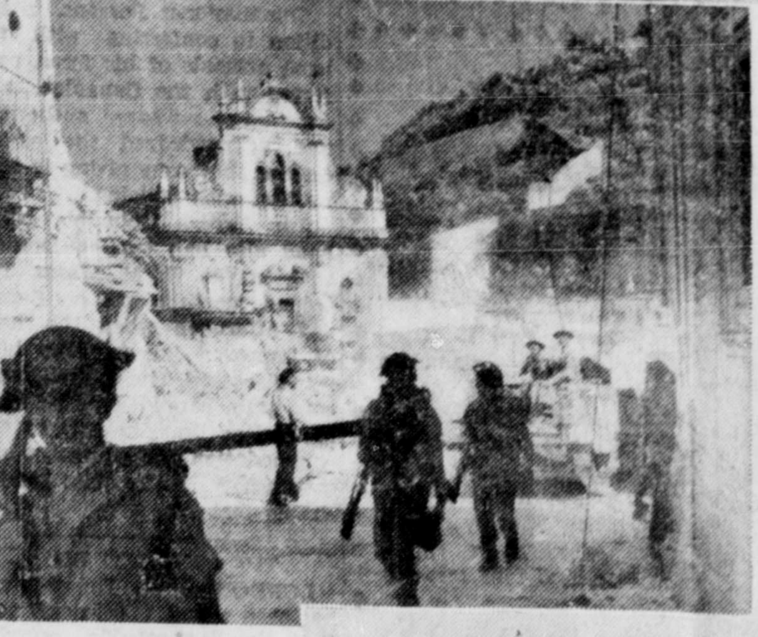
• The main street of a town in Sicily, showing the infantry followed by mechanized equipment. Typical is the country in the background, with its rolling hills and the beautiful church, happily in good condition after the battle.

Somehow in Italy (by Cable) — War stories at best are hard to get. When a fast mechanized army is on the move, it is a job in itself to keep up with it. Fighting men must have priority, for theirs is the all-important job. Nevertheless, the newsmen, radio and press, have just got to make the grade somehow. Believe me it is no parade. It's an impressive sight to see hundreds of vehicles literally plowing their way to the front. Speeding through dust, rough country, bad roads, heat, noise and excitement. It is really a power drive that we're putting on. You almost have to wait till it's over to know what you've seen. I can tell you it was a great matter of pride to us, in our General Motors Oshawa-built utility truck, to be able to hold our own against all-comers. It was in a "Chevy" that we brought back the world's first sound picture of fighting in Sicily. If