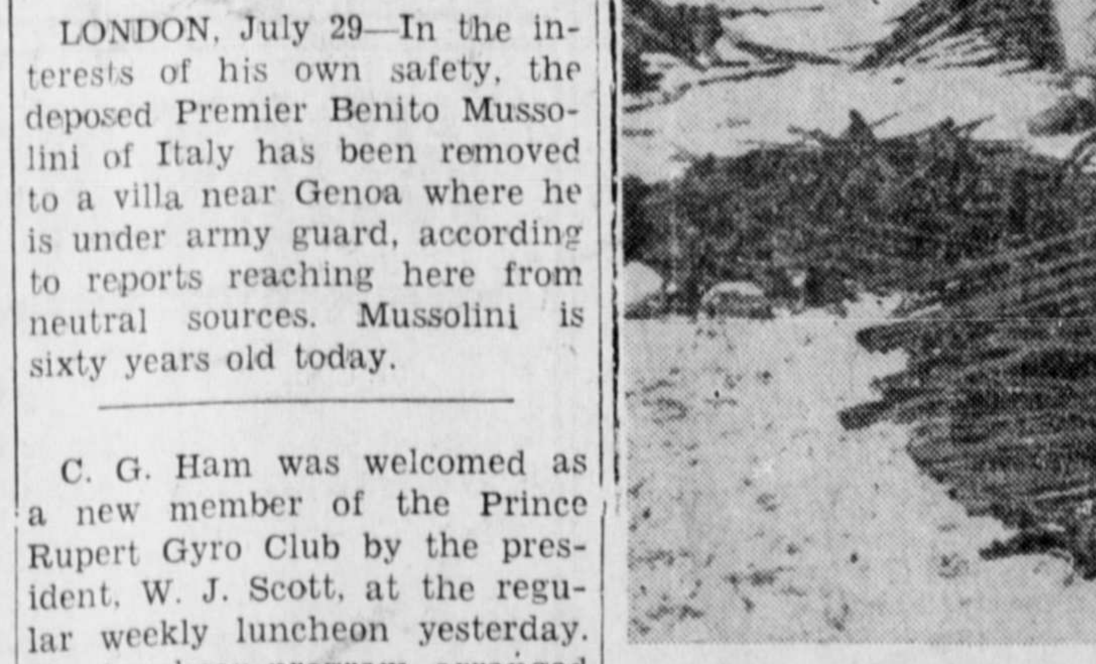
Under the watchful eyes of the British guards, Italian prisoners of war piled these weapons in the square of the Mediterranean island of Lampedusa, after the fortress surrendered. Lampedusa, like Pantelleria, is being used by the Allies as an air base from which to bomb Italy.