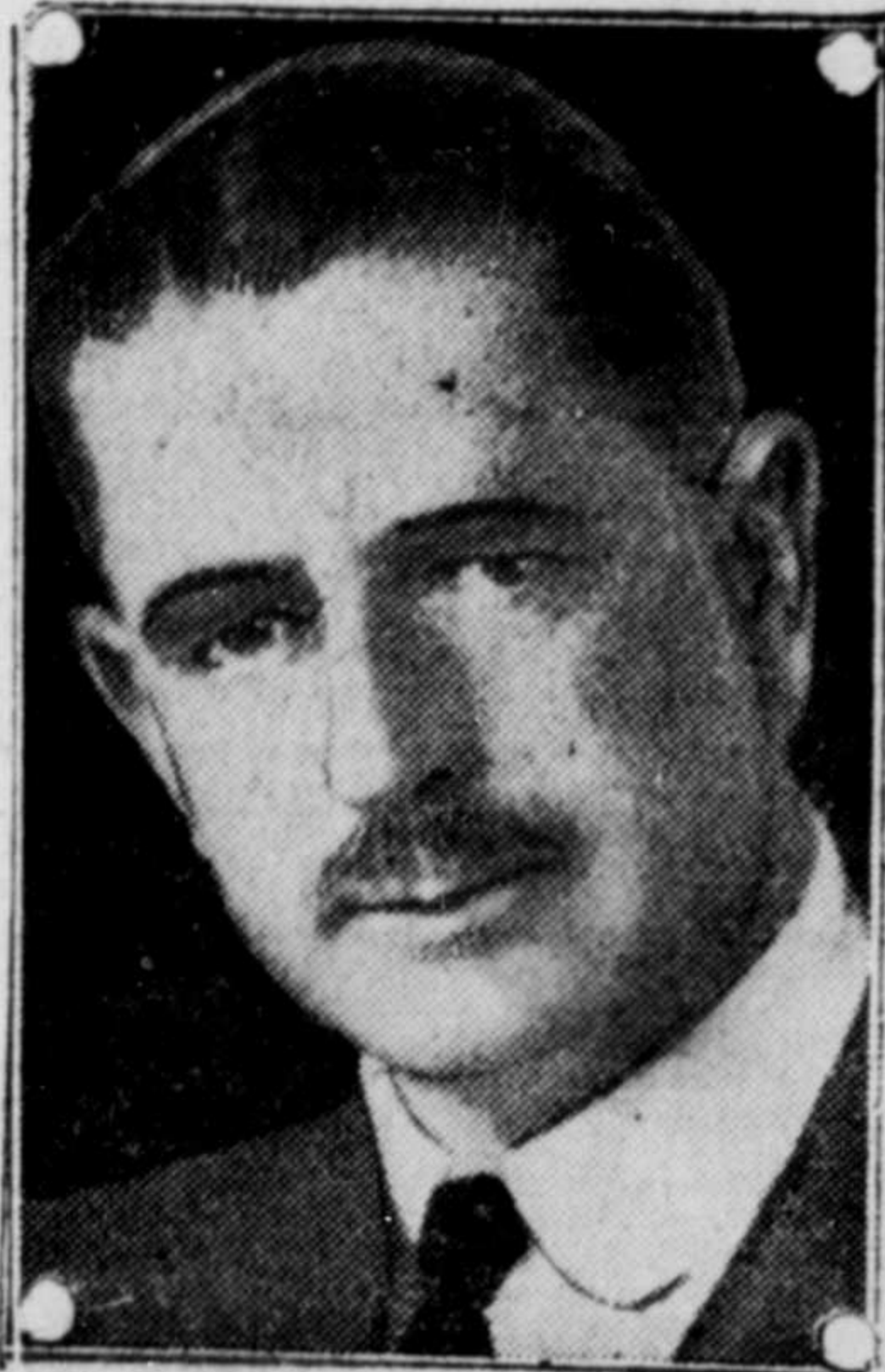
FORMER N.Z. PREMIER WELLINGTON, N.Z., May 27 (CP)—Hon. J. G. Coates, former New Zealand prime minister and since 1940 minister for armed forces and war co-ordination, died suddenly at his desk yesterday.