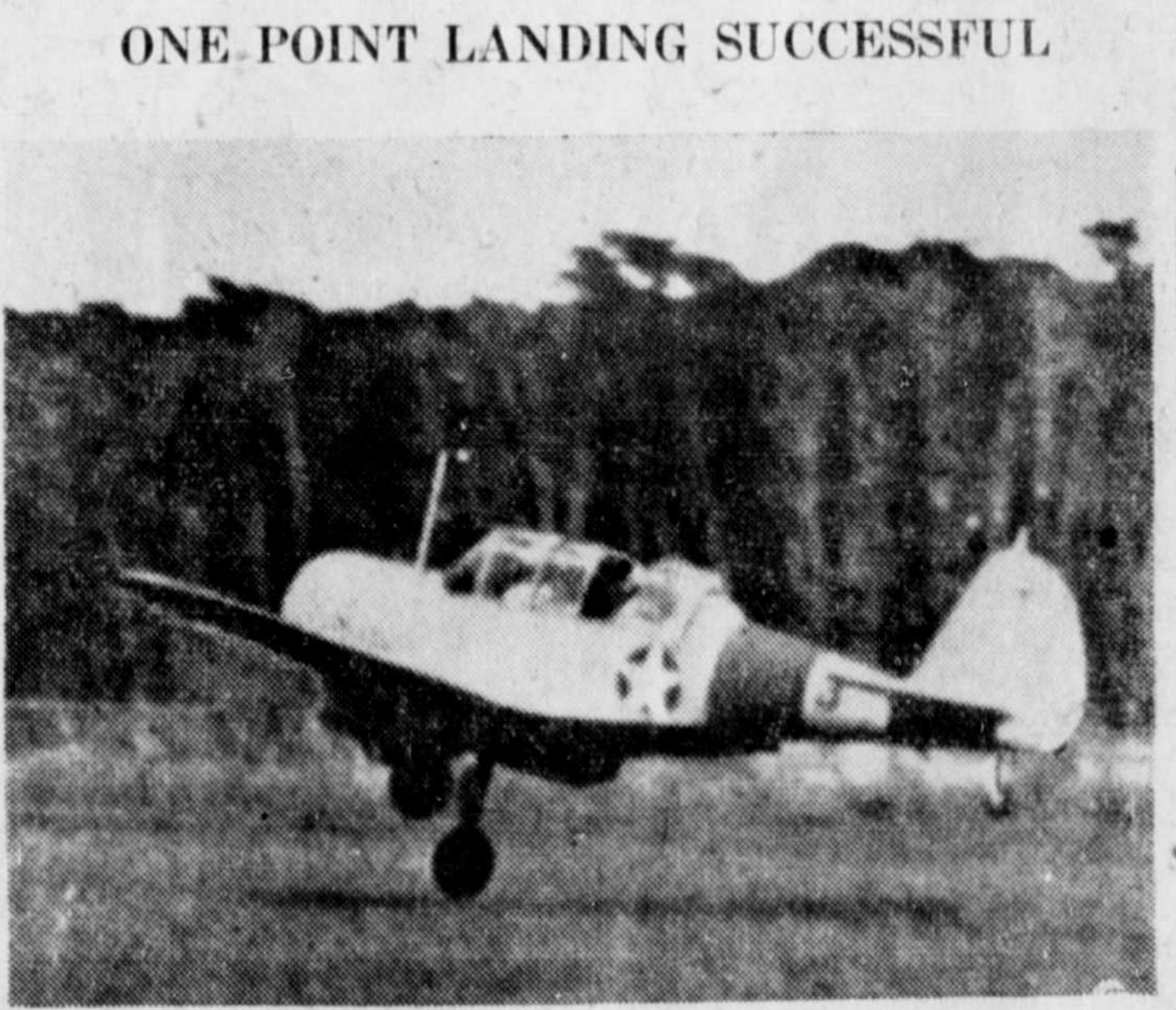
With one wheel of his landing gear down and the other jammed at the half-way position, a navy flier is shown just as the one wheel touched ground in his dangerous landing attempt. On landing the plane he swung about on the one wheel, leaned over on a wingtip and then climbed out with no damage to himself or the plane.