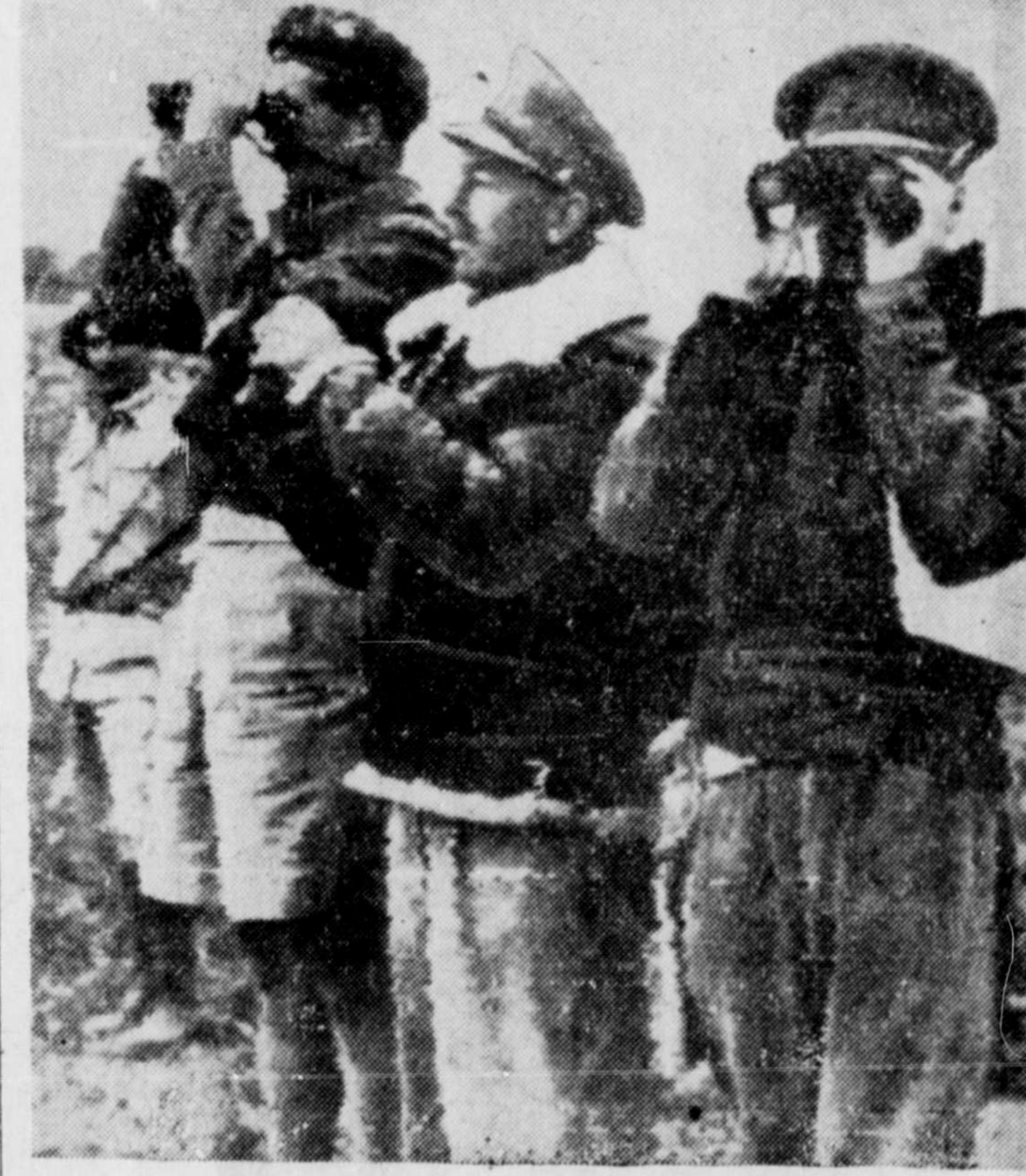
General Sir Harold Alexander, commander of the Allied ground forces in the Battle of Tunisia, is shown, CENTRE, in flying jacket, watching a phase of the battle in the last big drive that culminated in the capture of Tunis and Bizerte and the complete collapse of Axis forces. General Dwight Eisenhower, commander in chief of the Allied forces, paid a glowing tribute to the genius of Alexander for his handling of the battle.