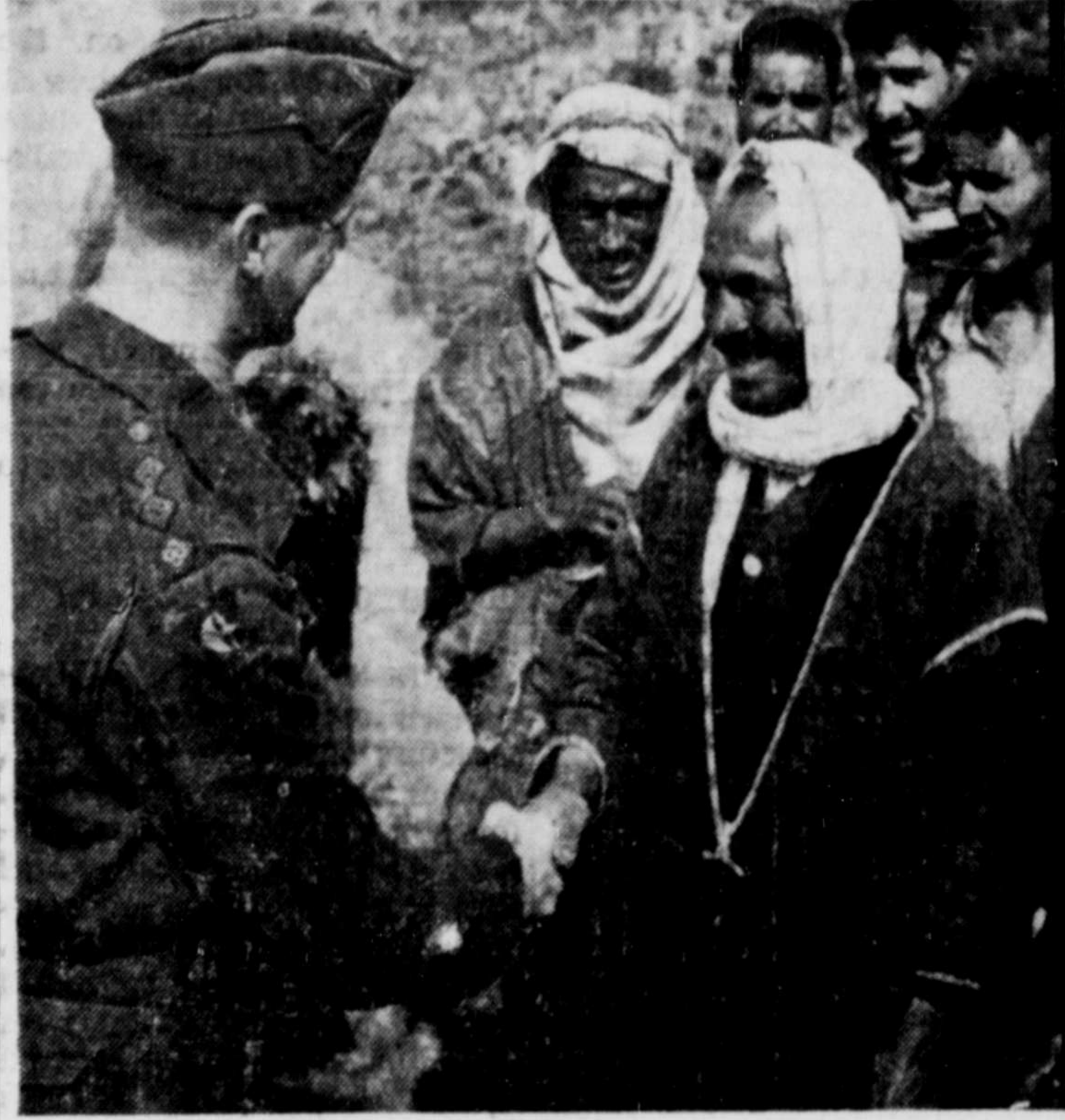
British troops on the North African spring-board waiting to invade southern Europe are on friendly terms with the natives of the district. Here a British field security officer in Tunisian whose outfit supplies a daily news service to the people shakes hands with the corporal of the village, head man in the absence of the Sheikh.