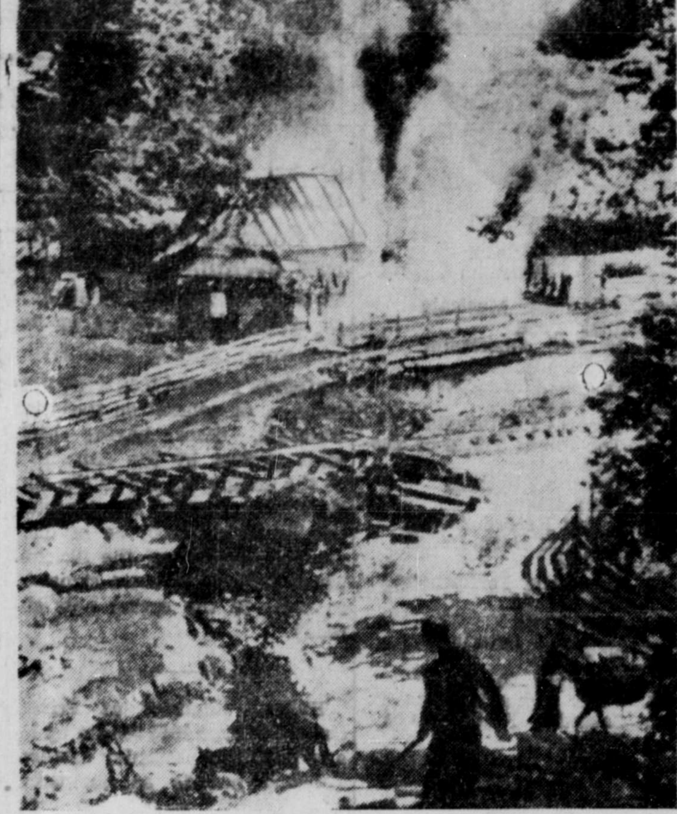
The trail of Yugoslavian rebels is easily followed by landmarks of burning structures such as the one pictured here. Captured villages, devastated by the partisans, have been repaired, according to the Axis caption write. Many brave patriots are fighting a difficult battle behind the lines in south Croatia.