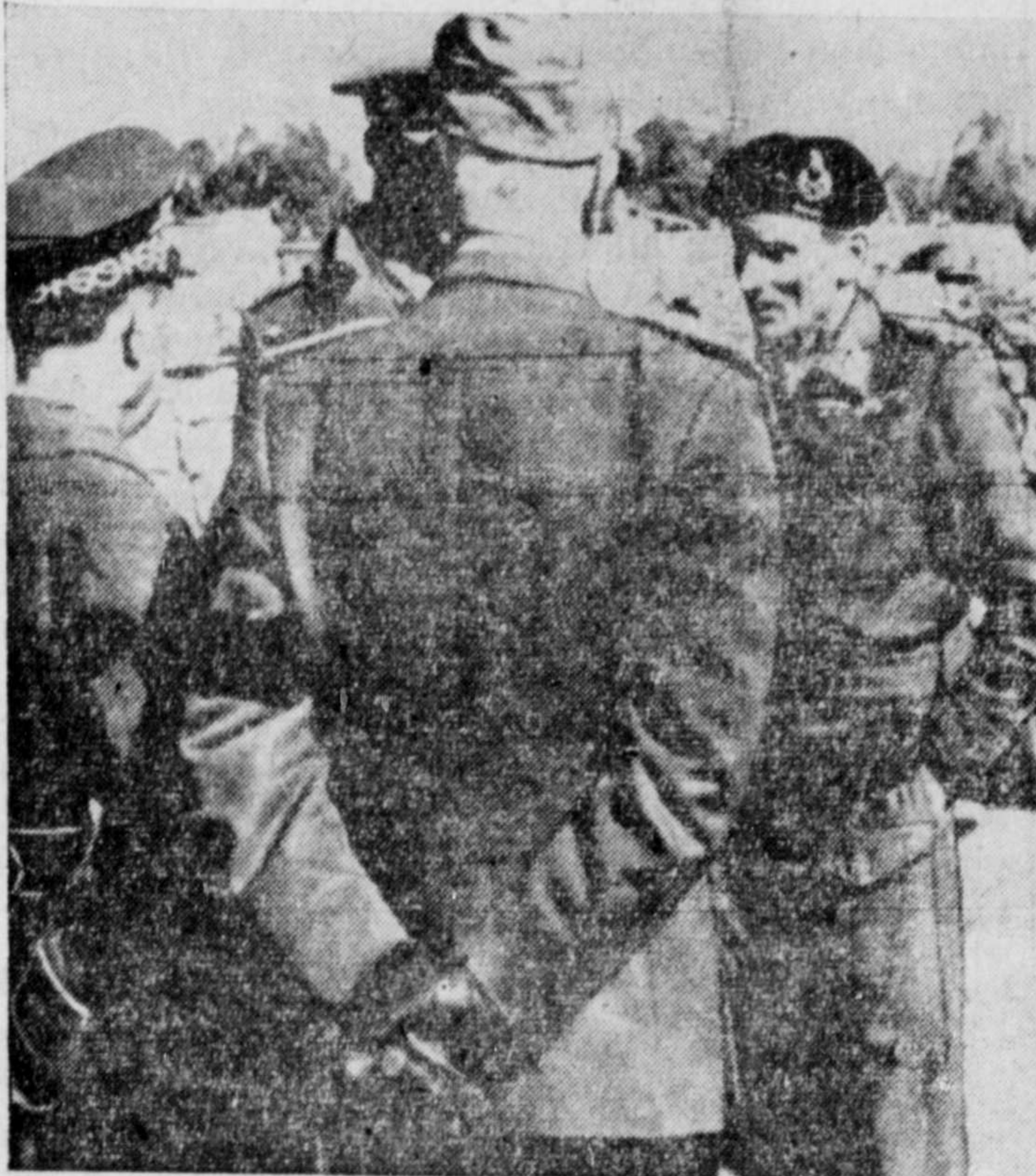
General Montgomery, leader of Britain's Eighth army, RIGHT, dictates terms to the governor and officials of Tripoli and Tripolitania at Castel Benito Gate after the victorious British soldiers had entered the town. Gen. Montgomery's stay in Tripoli was brief because dispatches coming from the North African front say that the British Eighth army has pierced the Tunisian border in three places.