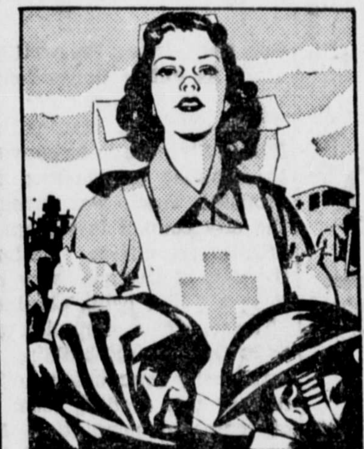
Give - HUMAN SUFFERING IS GREATER THAN EVER Now!