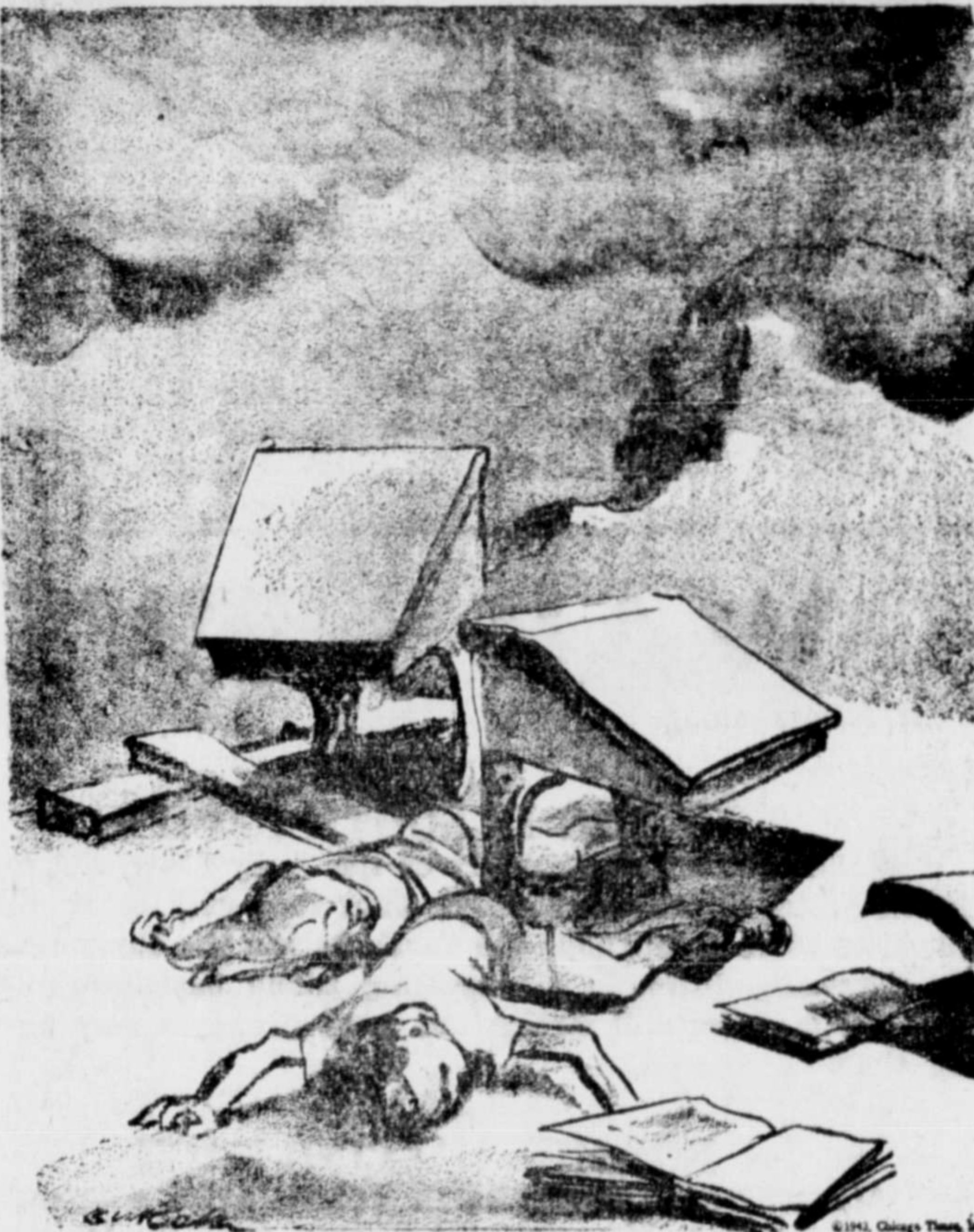
Human Suffering is greater than ever now!

pleasant. Parcels and cigarettes keep on arriving from the Red Cross in the wonted monthly quota, which conveys to us more than meets the eye. Please convey my thanks and best wishes to your staff."