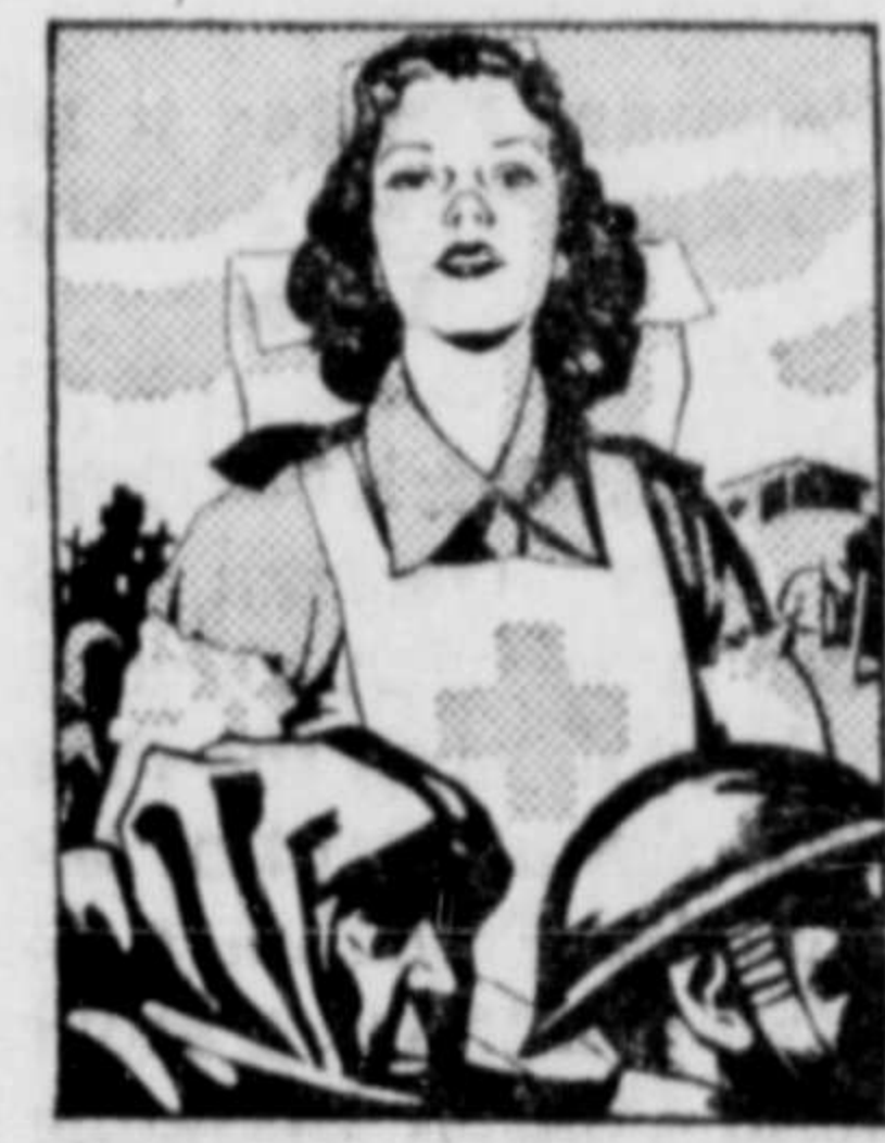
Give - HUMAN SUFFERING IS GREATER THAN EVER Now!