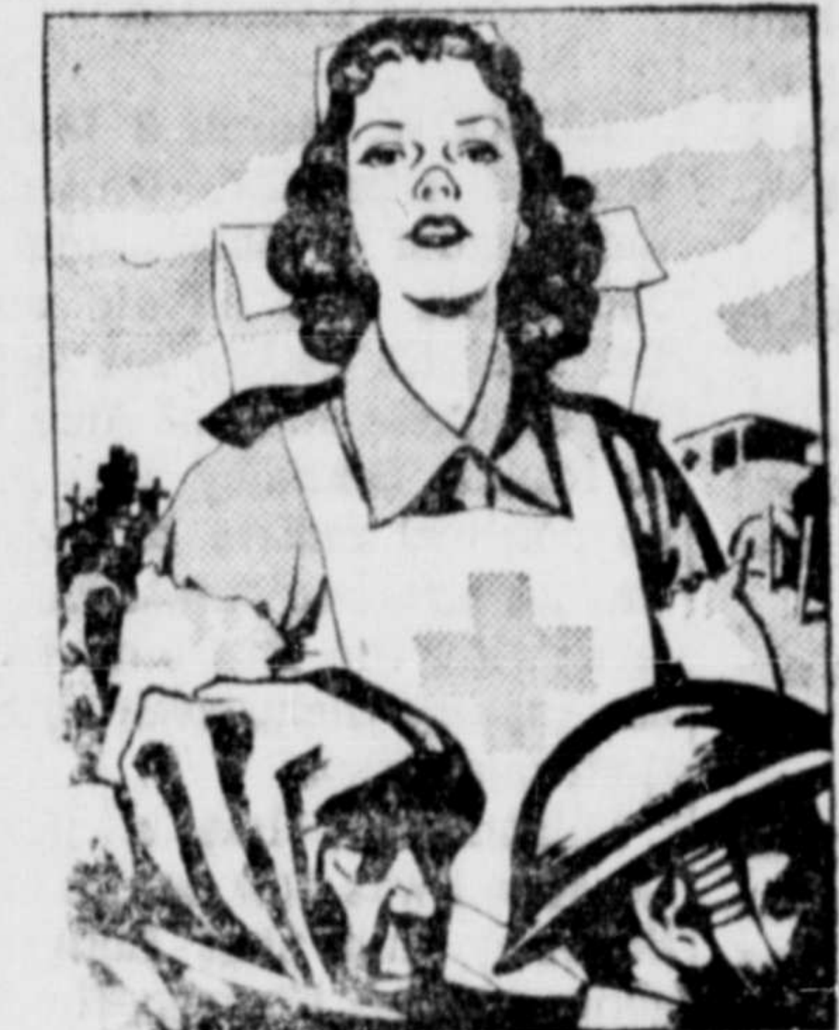
Give - HUMAN SUFFERING IS GREATER THAN EVER Now!