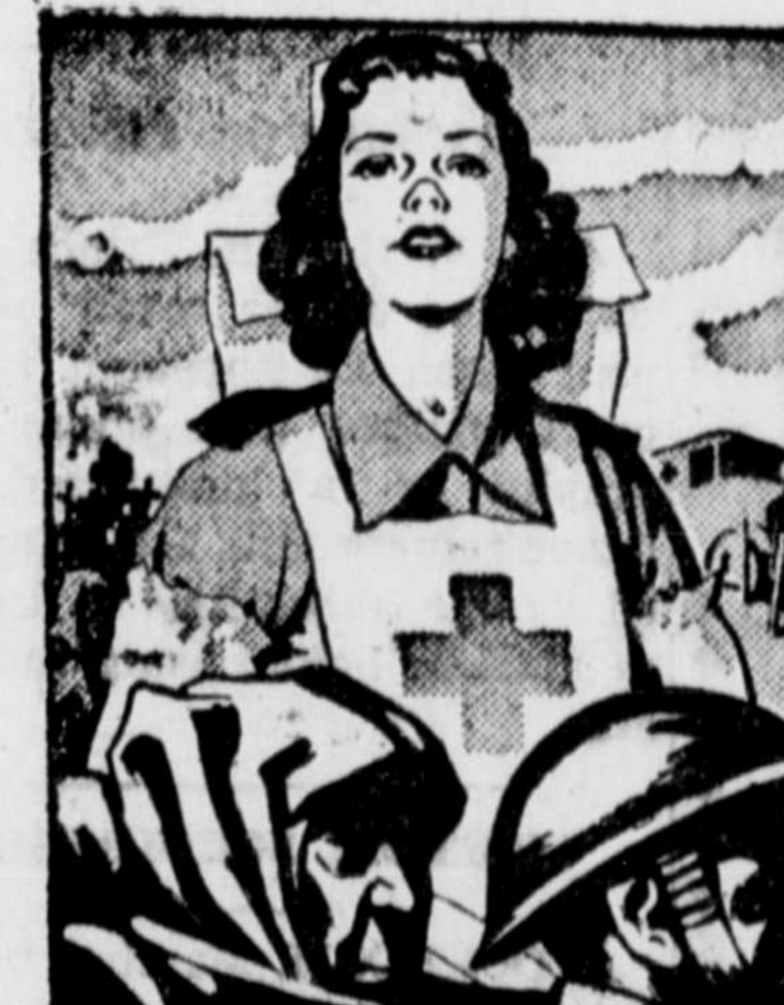
Give - HUMAN SUFFERING IS GREATER THAN EVER Now!

As the war widens and intensifies, the need grows. There is infinitely more need for your Red Cross dollars this year than last. There MUST be more of them, if the need is to be met. Prisoners of war, bomb victims, refugees, the wounded, the ailing, the destitute everywhere, count on YOUR Red Cross dollars for help. Dare you fail them?