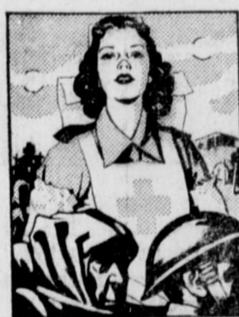
Give - HUMAN SUFFERING IS GREATER THAN EVER Now!

By supporting the work of the Canadian Red Cross, we can do a great deal for these men of ours who are facing a task that is grim and difficult at best.