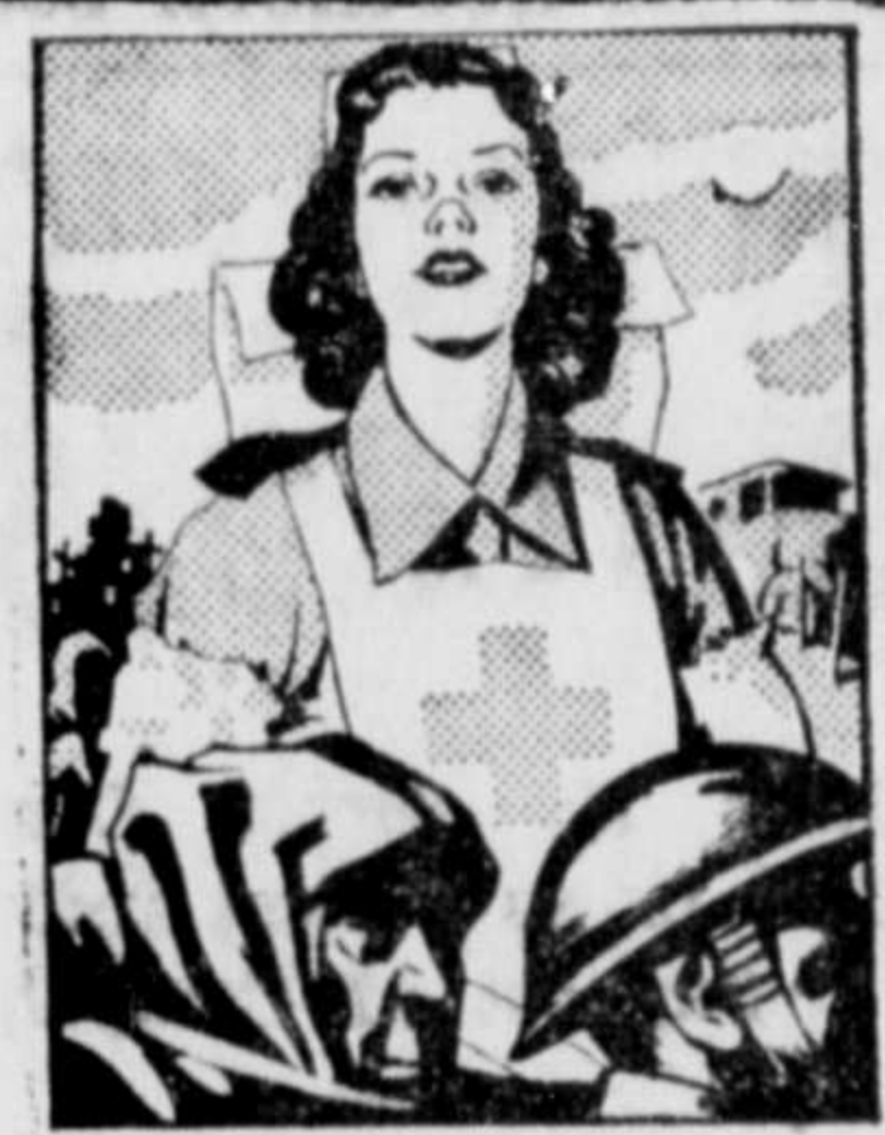
Give - HUMAN SUFFERING IS GREATER THAN EVER Now!