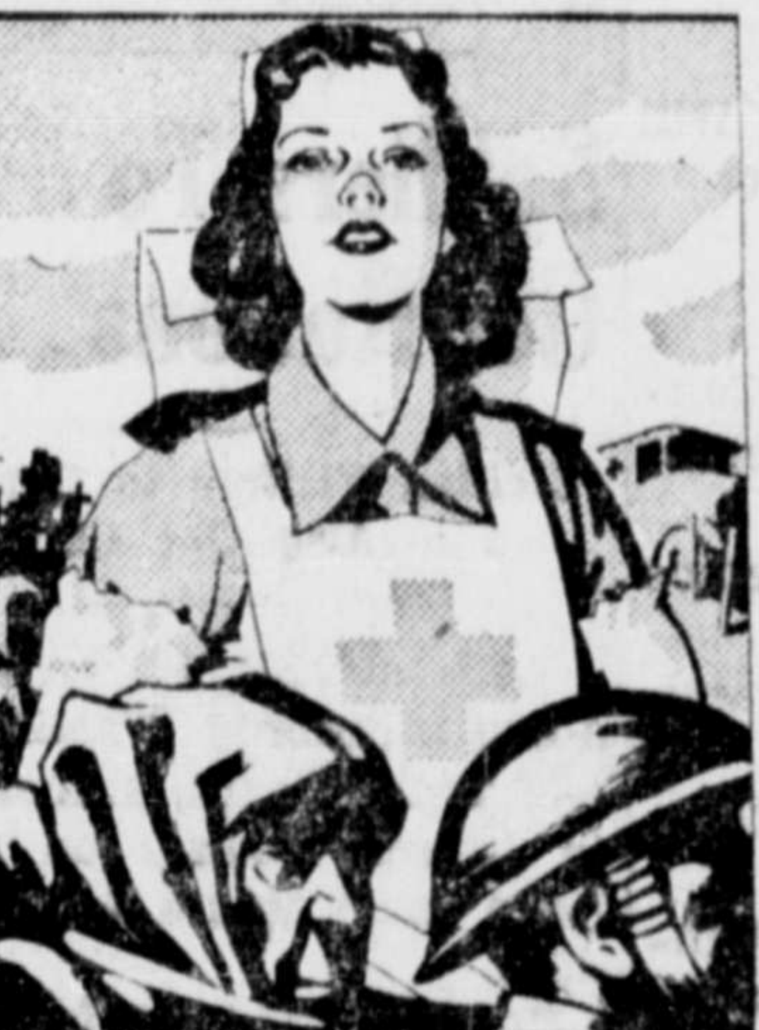
Give - HUMAN SUFFERING IS GREATER THAN EVER Now!

Phone 8-118 P.O. Box 418 Third Ave. East