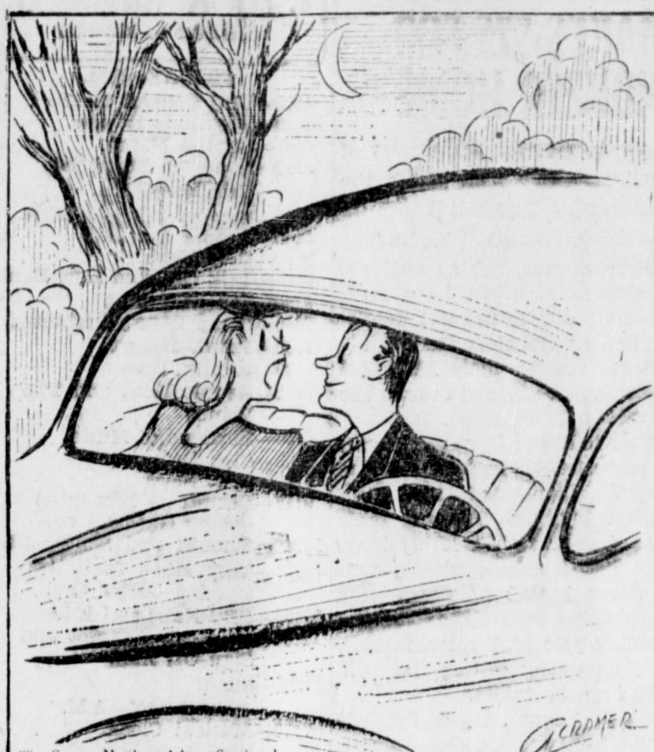
The George Matthew Adams Service, Inc.

"But I thought it was the car you were giving a road test."