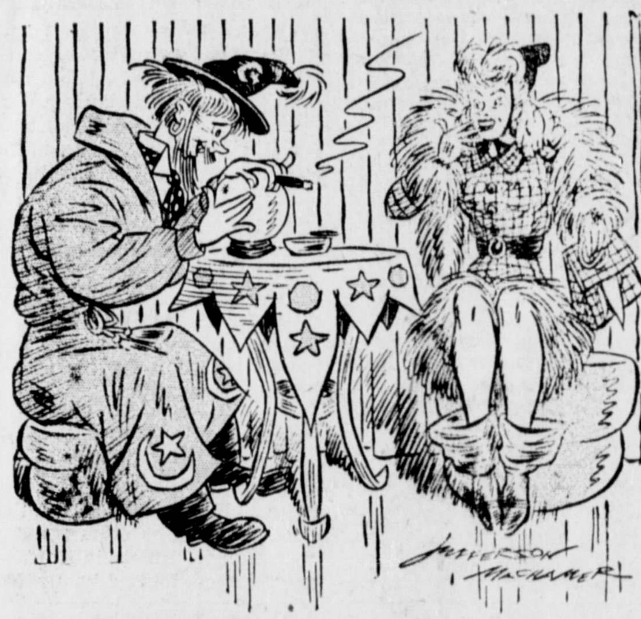
"I see a tall, intelligent, virile, handsome, dark, smiling man at breakfast with you—drinking Fort Garry Coffee!"

younger members of the church took an active part in the service.