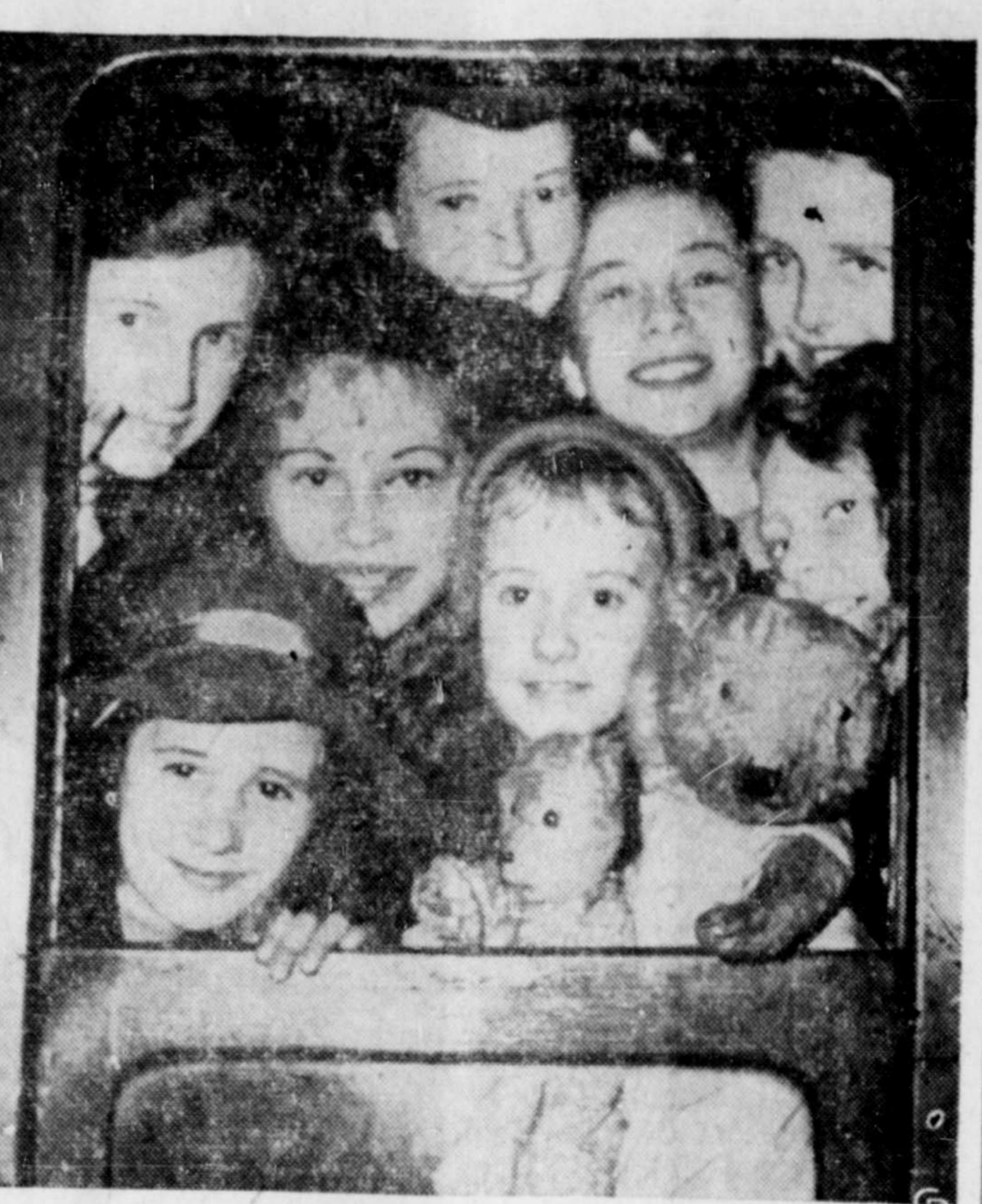
ENGLISH CHILDREN OFF ON SWISS VACATION —Children from Birmingham and Coventry, England, who have more than their share of the ordeals of war smile again as they leave London for a vacation in Switzerland. The children, 130 of them, were housed overnight in an air raid shelter in London. This shelter has been converted into a hostel for "stayovers" in the capital. The vacation was arranged under an agreement between the children's welfare section of the Swiss Red Cross and the British ministry of education.