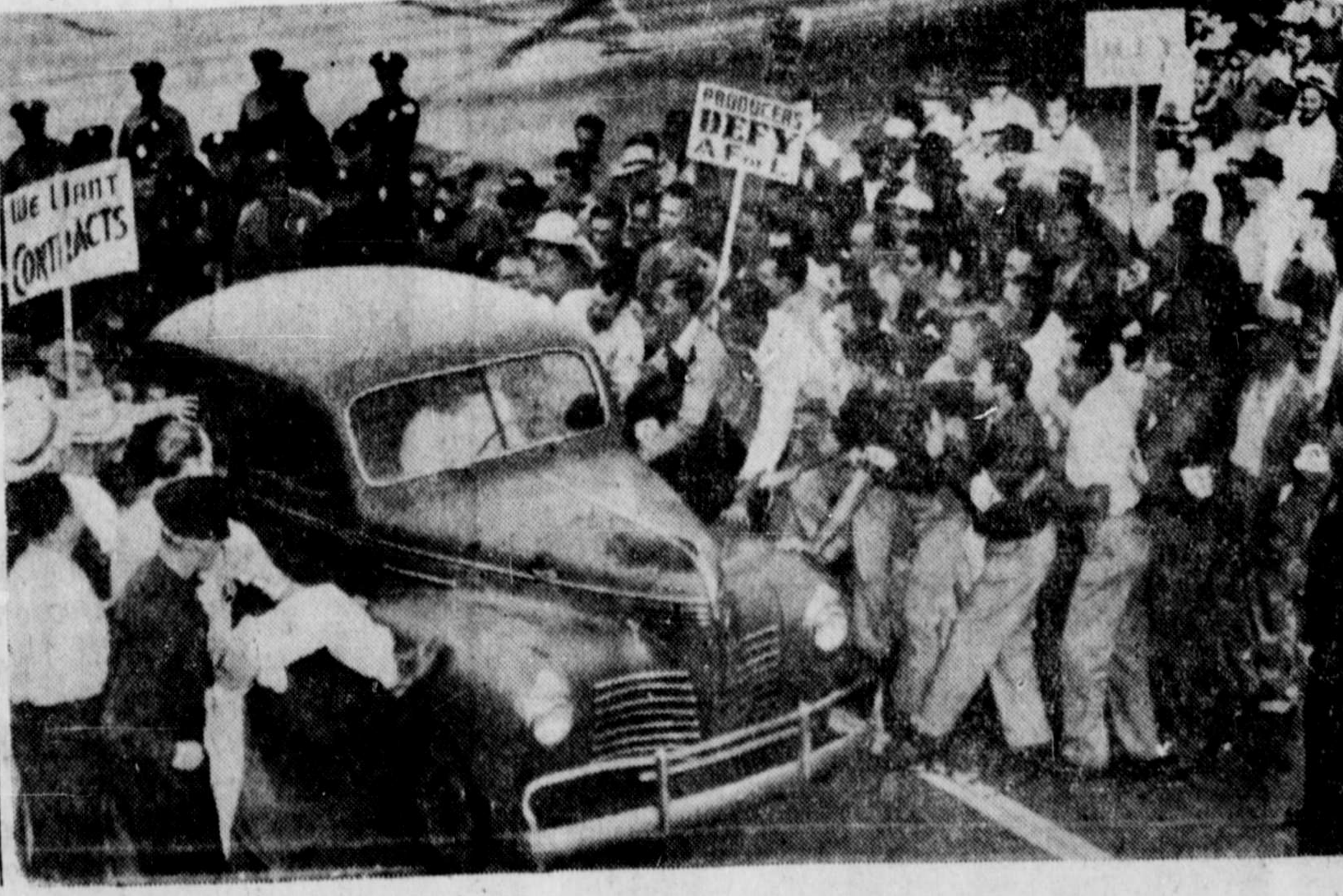
LIGHTS, ACTION—BUT NO CAMERAS: THIS IS THE REAL THING — There is a general melee at the gates of the Warner Bros. studio, Burbank, Calif., as a car pushes through the massed picket line after seven major studios went on strike. Some 500 pickets were stationed at Warners, scene of the bloody rioting during a similar strike in 1945. Some 125 police were also massed at the scene. Several arrests were made.

NEW DELHI — Established in 1917, Queen Mary's Technical School for disabled Indian soldiers at Kirkee now has taught nearly 3,000 Indian servicemen a useful trade. Courses at the school vary from six months to two years and each man is free to select a trade.