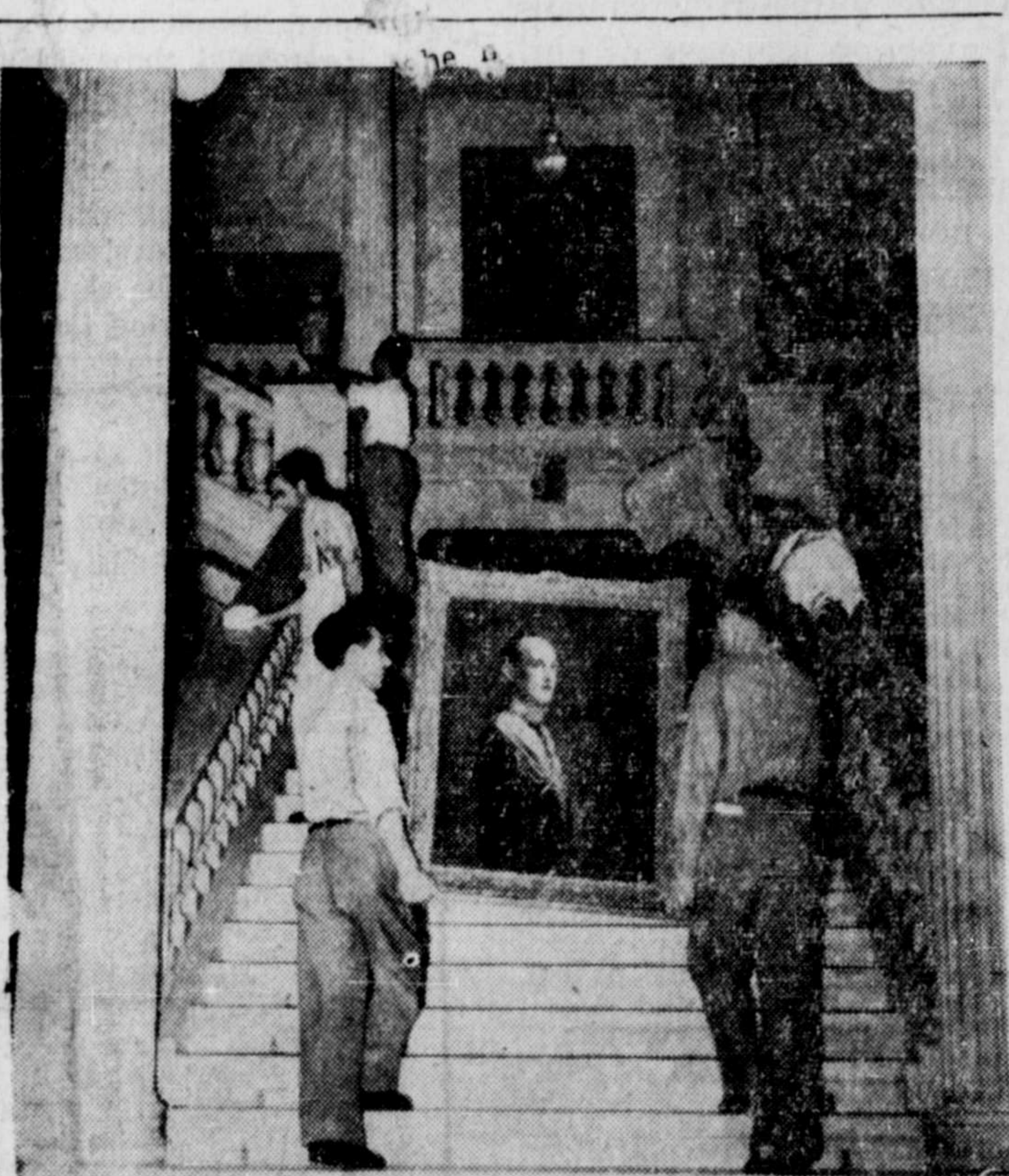
GREECE WELCOMES RETURN OF KING—King George of the Hellenes is back in Athens and the palace staff is busy furnishing the royal palace for his use. The palace, overlooking Constitution Square, in Athens, is a modern, simple building, devoid of both historical or artistic interest. The interior, however, is being arranged in fitting style, as shown in this exclusive photo. Palace servants are shown carrying the king's portrait up the marble staircase to a reception room.