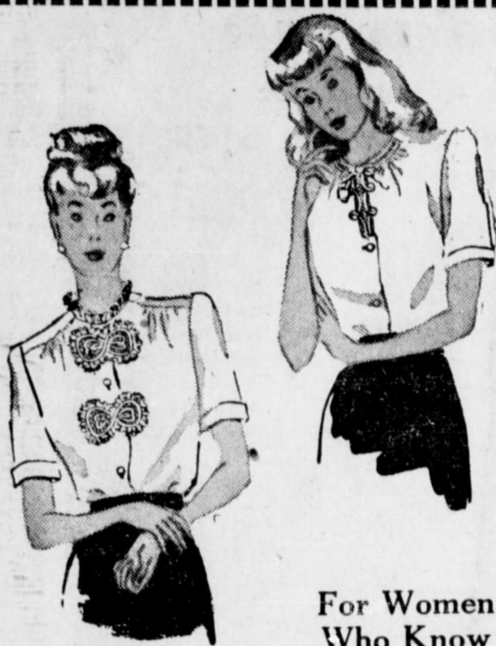
For Women Who Know