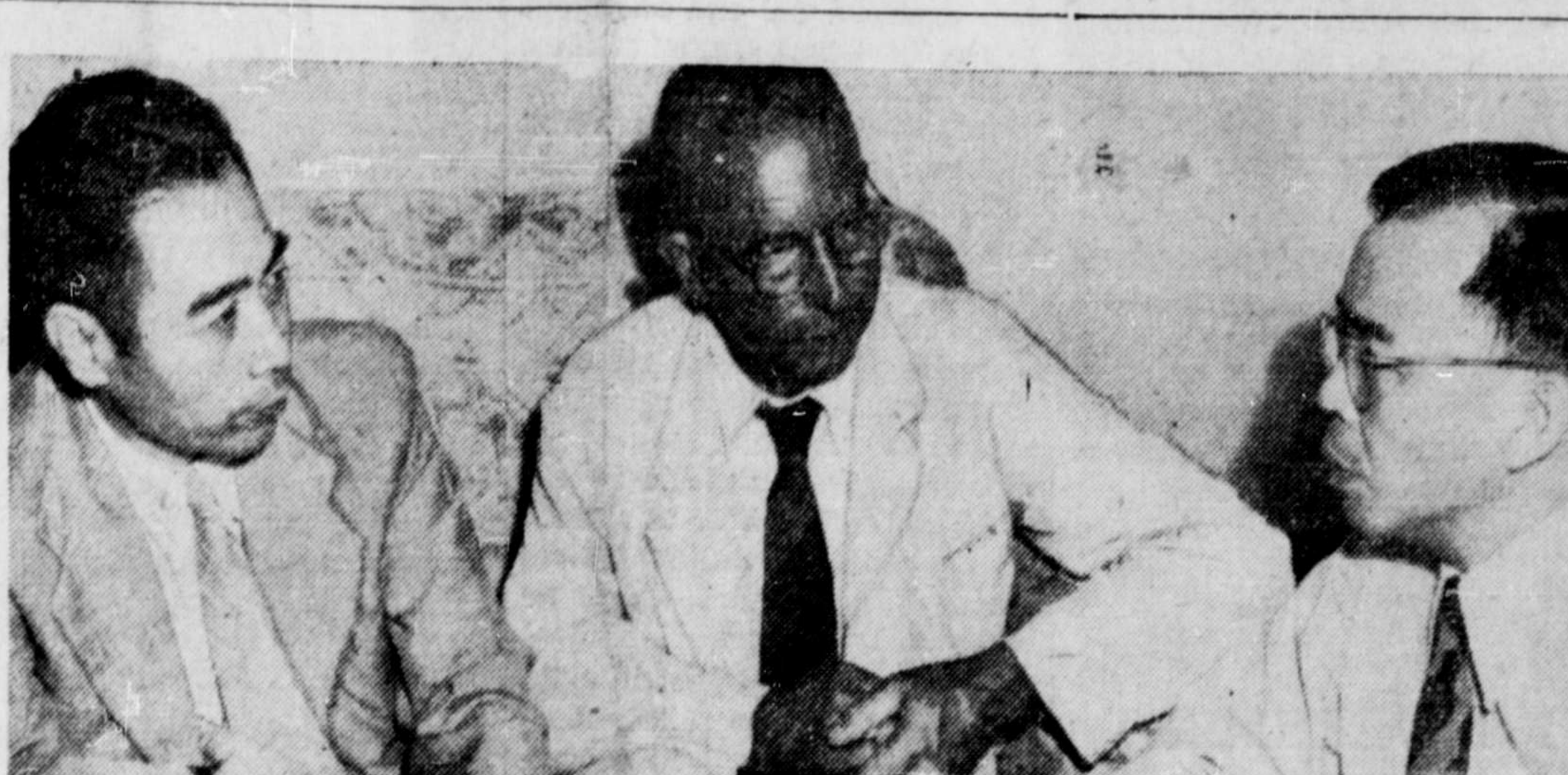
YELLOW RIVER DIVERSION CONFERENCE—Three care-worn conferees discuss China's age-old "sorrow", the Yellow River, during conference in Shanghai. This conference was called in an effort to gain compensation from UNRRA for farmers who will soon have to move from the old bed of the Yellow River when it is again diverted to its original course. The river had been diverted to stall Jap advance during the war. Left to right are, Gen. Chou Eng Lai, China's No. 2 Communist and chief delegate to peace negotiations with the Kuomintang government; O. J. Todd, chief American engineer of the Yellow River project, and Dr. T. F. Tsiang, director of the Chinese branch of the UNRRA. Until UNRRA, CNRRA and Gen. Chou agree, the projected altering of the course of "China's sorrow" will be postponed.

MONTREAL — A wedding celebration at the village of Ste. Brigid, 40 miles southeast of here, turned to tragedy today when approximately 100 guests were poisoned by contaminated ham which was served.