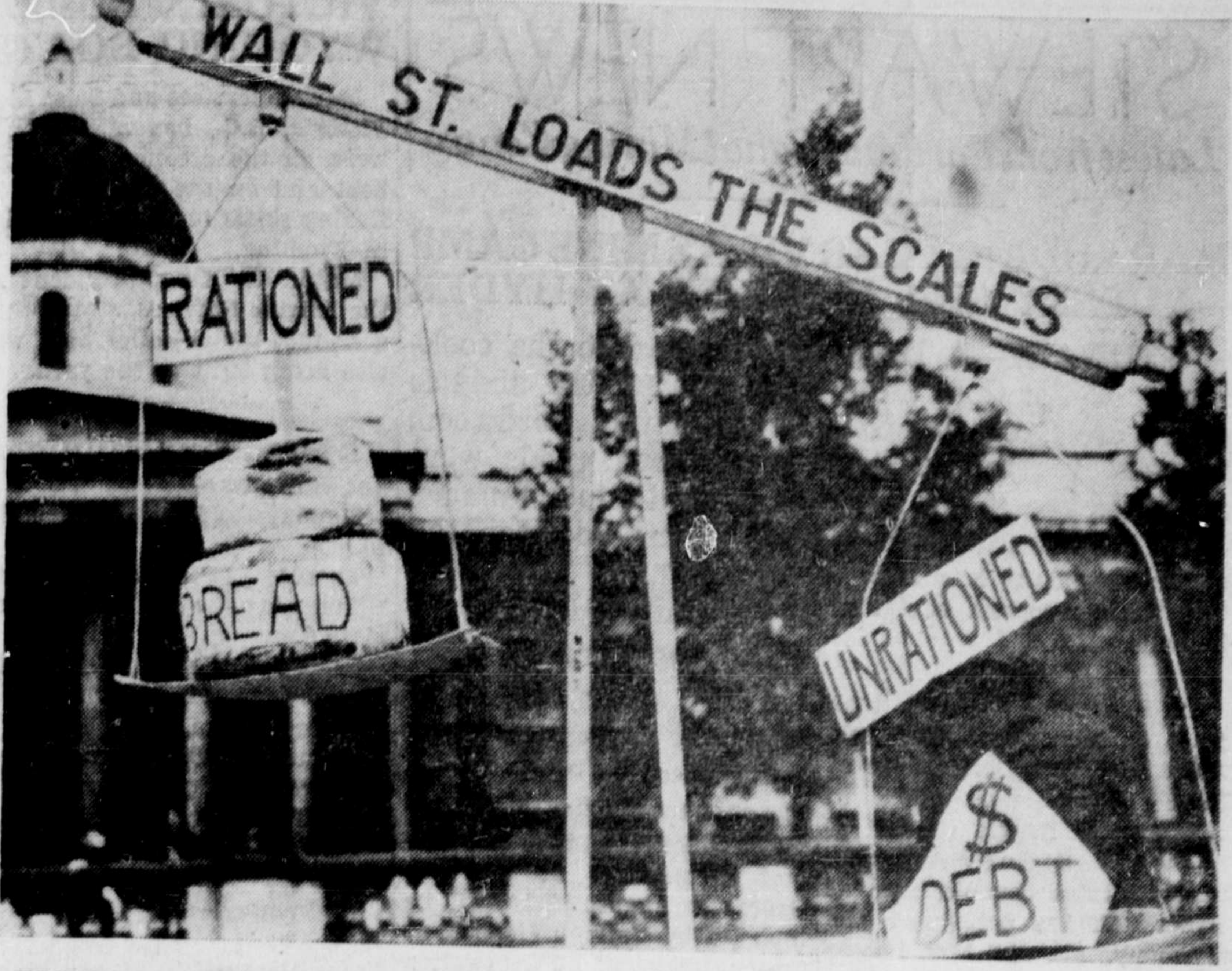
BRITONS DEMONSTRATE AGAINST BREAD RATIONING - A demonstration against bread rationing was staged at Trafalgar Square in London.