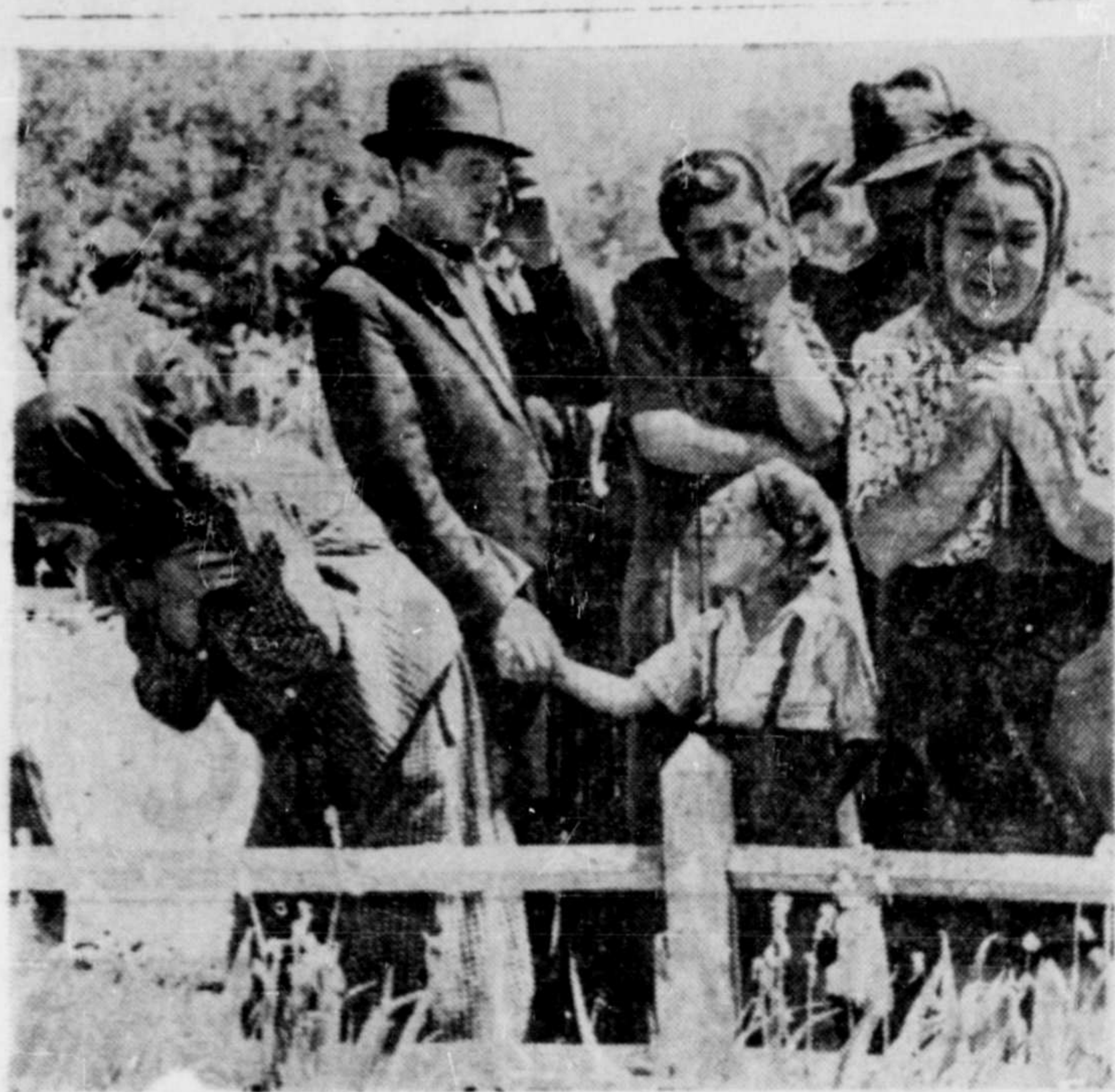
KIN MOURN AT MASS GRAVES — Grief-stricken families gather at the mass grave of victims of the massacre of Jewish inhabitants of Jassy to commemorate the fifth anniversary of the Jassy pogrom. On the order of the German occupation authorities, thousands of the Jewish inhabitants were shot down after being released by the police. Others were locked up in cattle wagons without food or drink.

The Zalinski is operated as a supply ship for the American Army in Alaska, and has refrigerated holds between decks, and dry cargo space in the lower holds. She was built on the Great Lakes in 1919 and operated there until she was placed in the deepsea service.