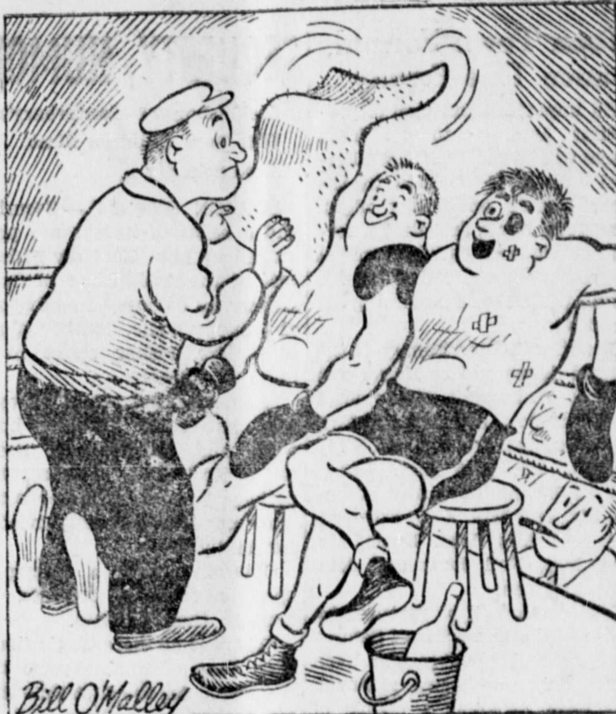
"He's my guest this round."