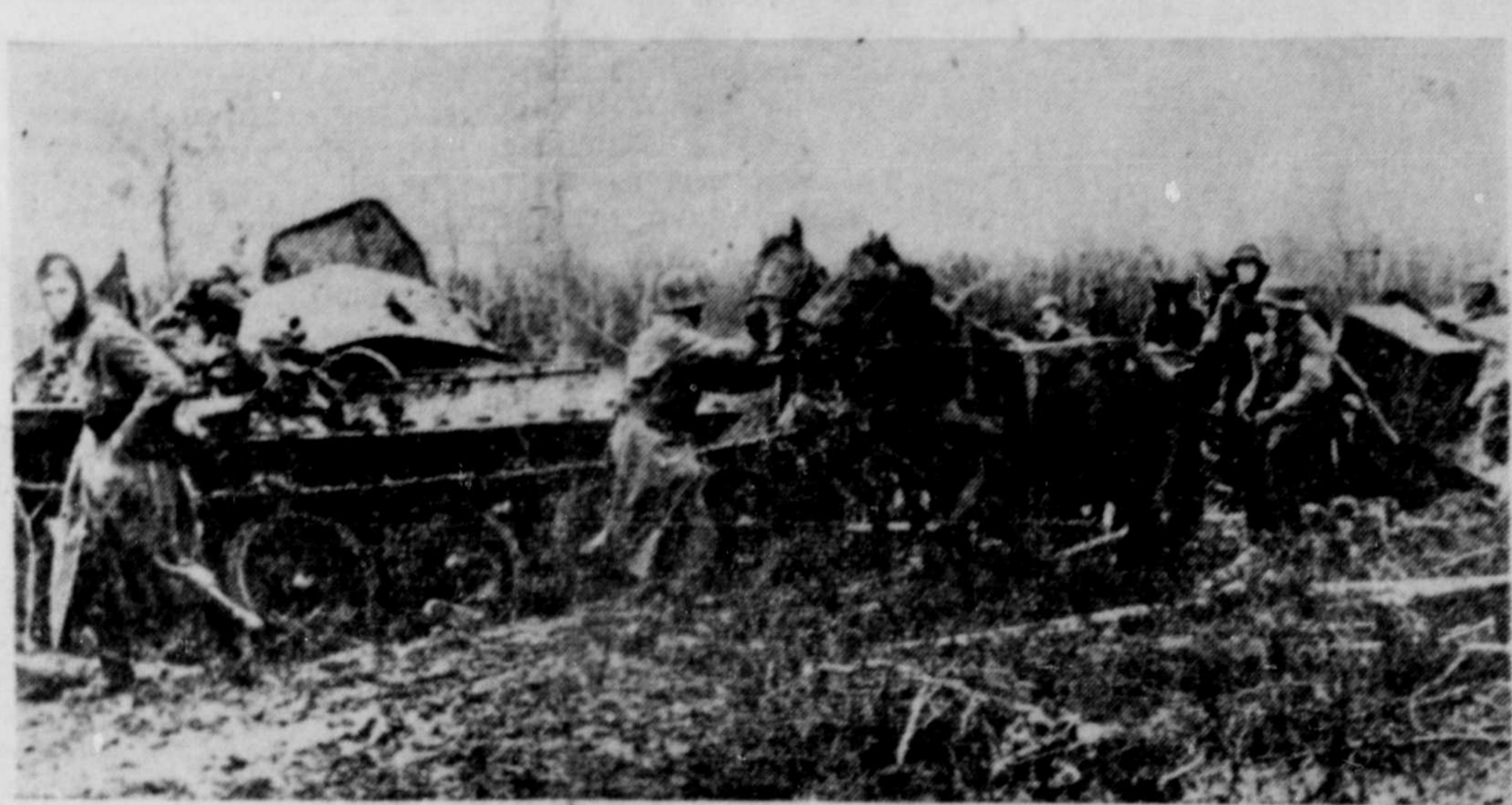
GERMANS BOGGED DOWN IN RUSSIA—IN MANY WAYS—Here is a picture from the Russian front, obtained through a neutral source, showing Germans bringing up horses in an effort to move their tanks and armored cars from the clinging mud of the road as they retreat before the Red army.

The flea beetle lives and multiplies on potatoes, tomatoes, or such related weeds as nightshade and horse-nettle.