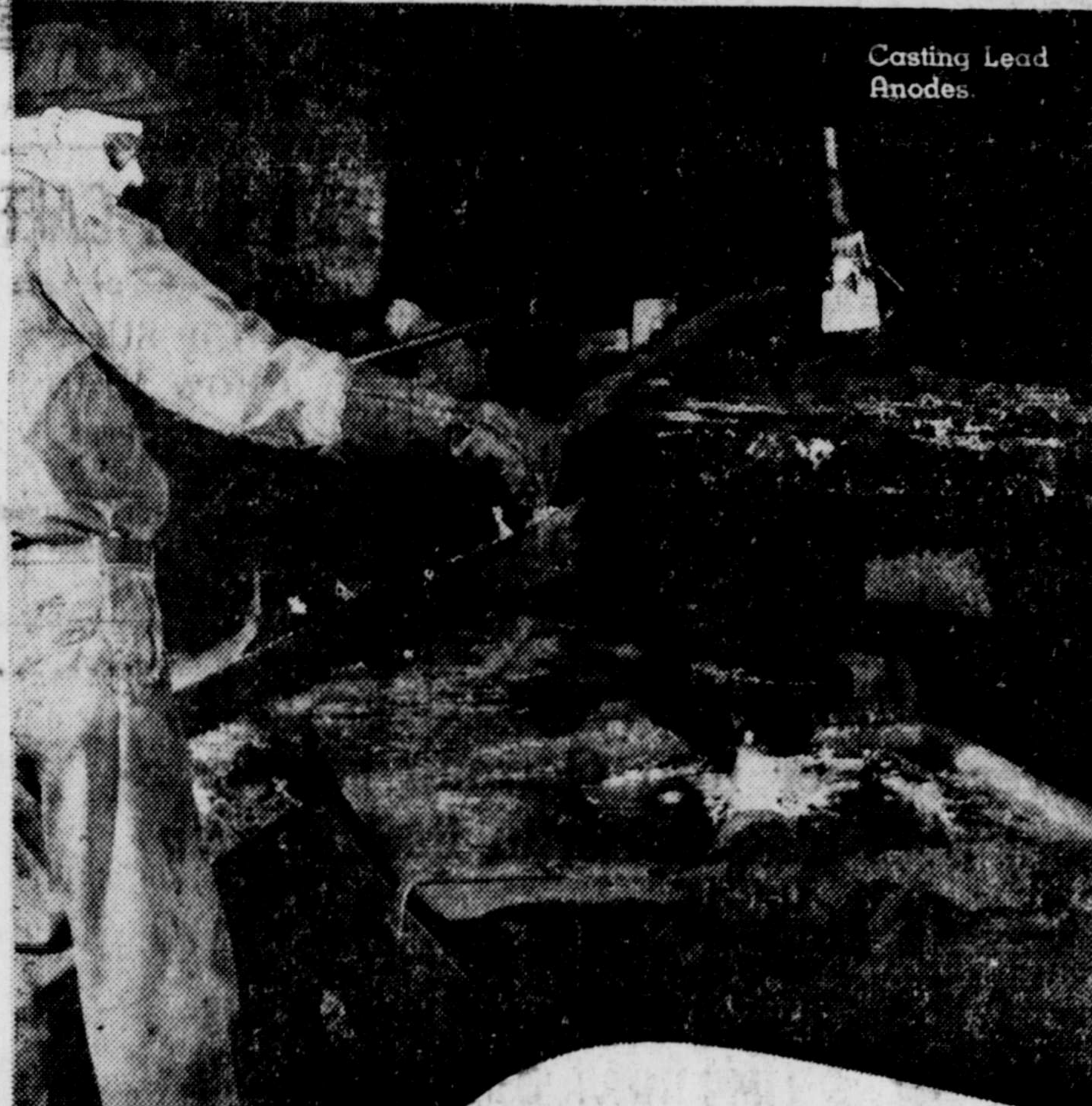
Casting Lead Anodes.