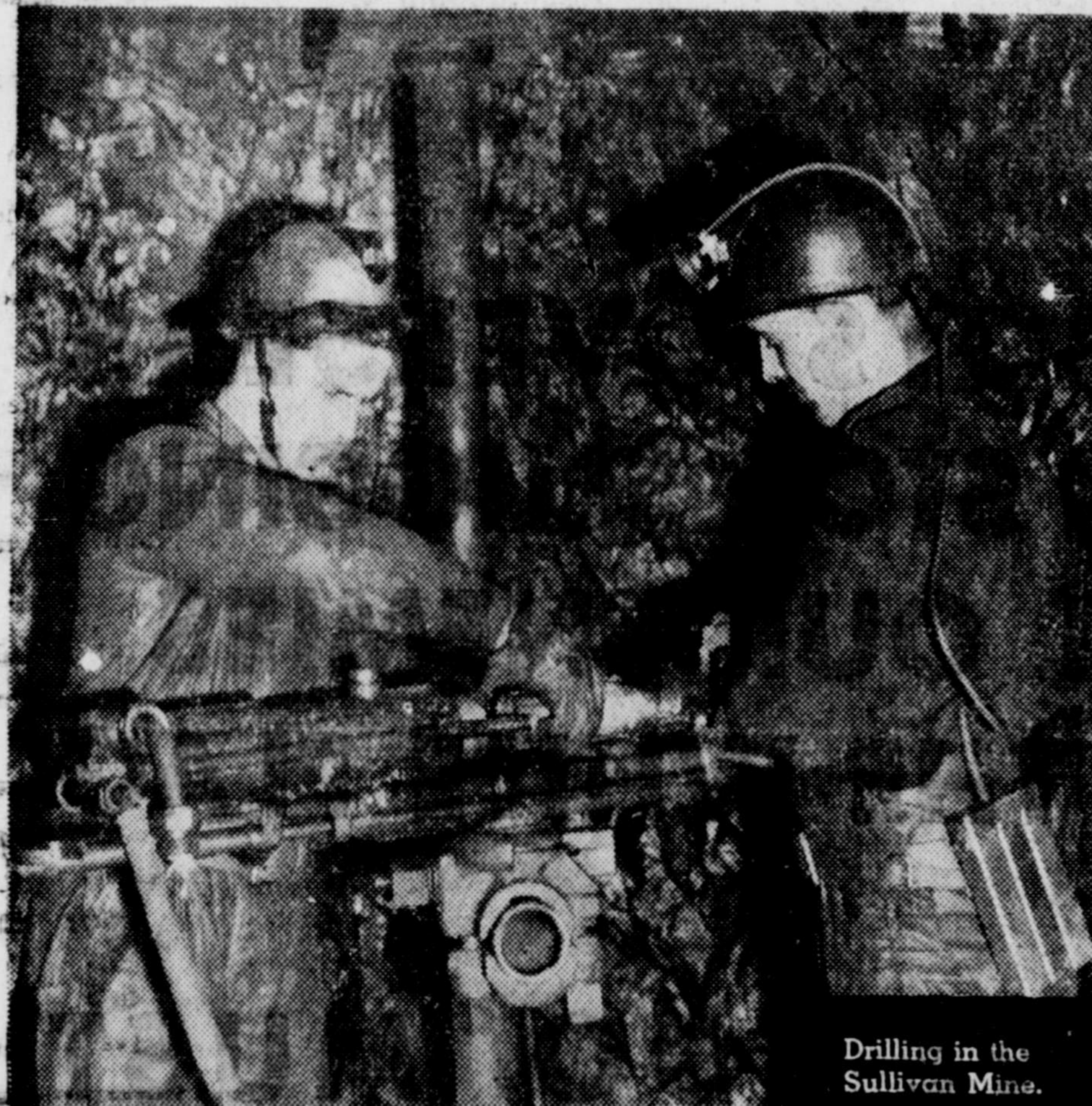
Drilling in the Sullivan Mine.