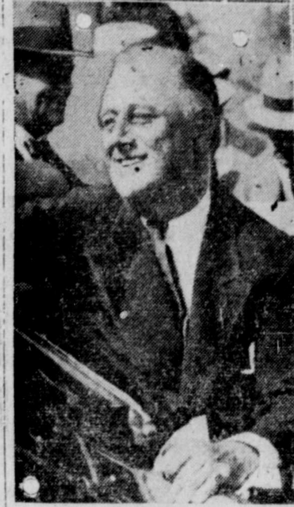
THE WINNER President Franklin D. Roosevelt

Dewey — Colorado, Indiana, Iowa, Kansas, Maine, Michigan, Nevada, Oregon, Rhode Island, South Dakota, Utah, Vermont, Wyoming.