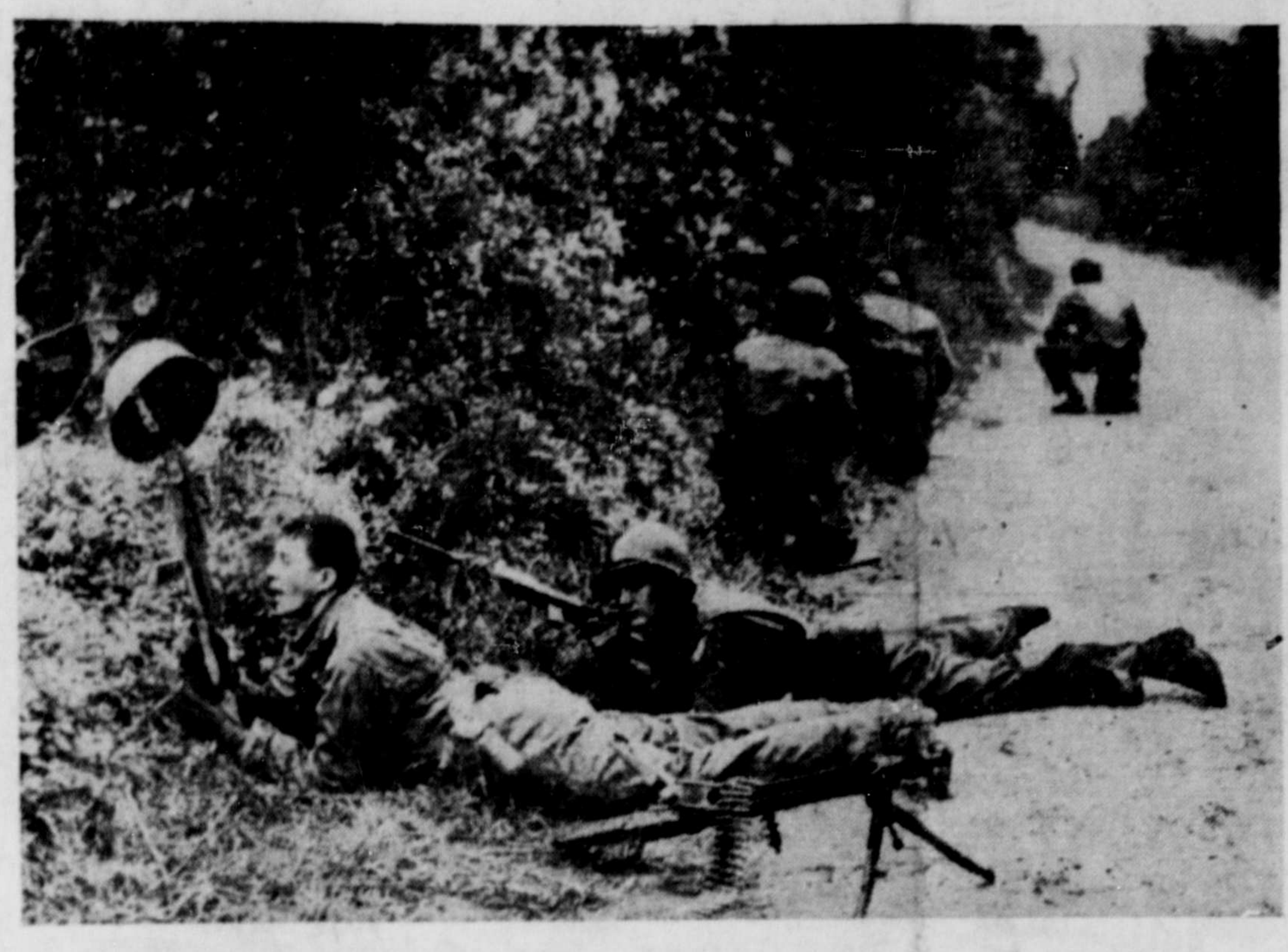
SNIPER BAIT IS OFFERED BY YANK SOLDIERS —Taking care to keep well down out of harm's way, these American soldiers take part in a sniper hunt somewhere in France. The soldier in the foreground pokes his helmet up over the edge of the ditch, on his carbine, hoping the sniper will take a shot at it and so disclose his position.