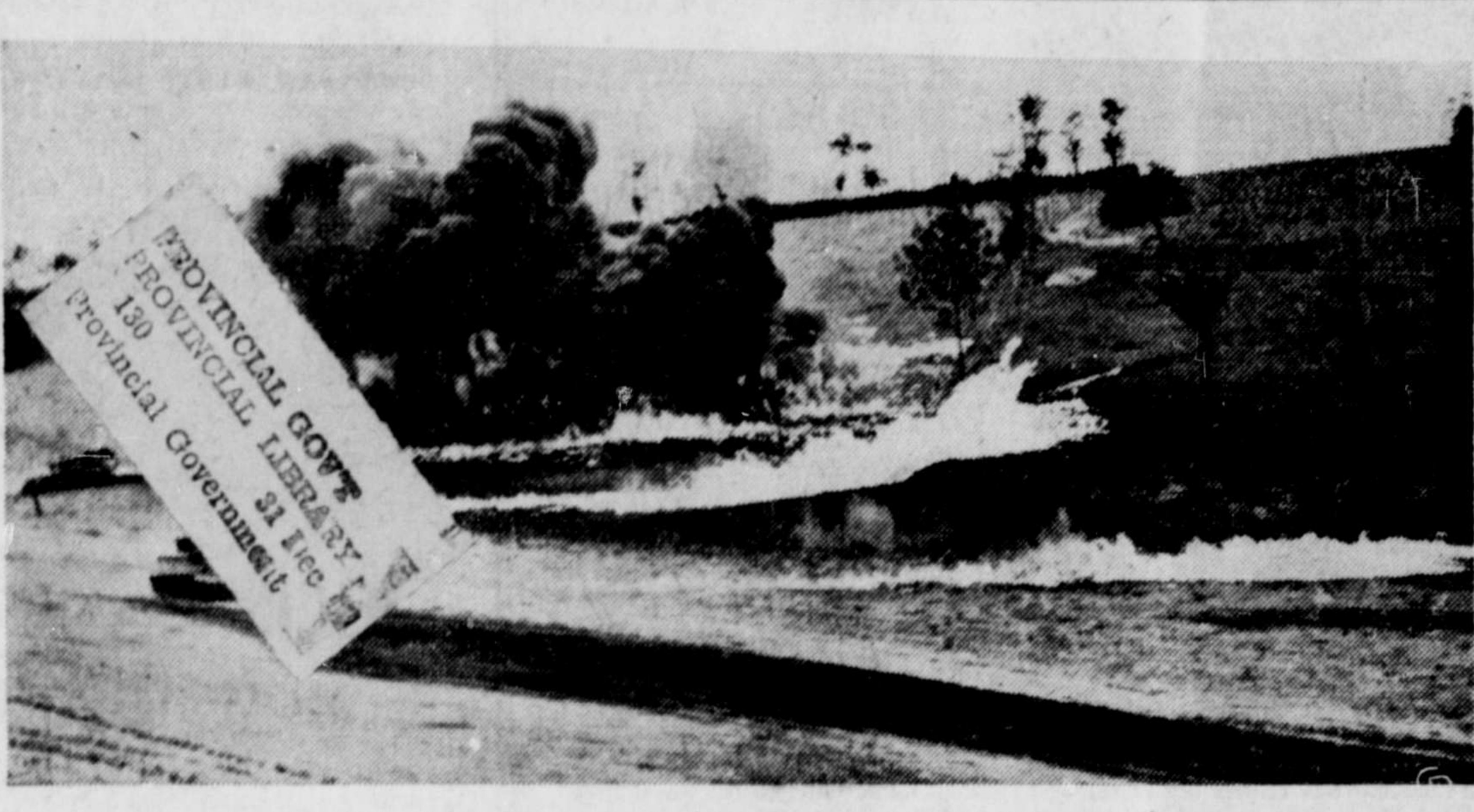
UNIVERSAL CARRIERS DEMONSTRATE "FIRE POWER"—Canadian Universal carriers armed with flame throwing mechanisms demonstrate their "fire power" during an exercise held in the English countryside.

...ED SUPREME HQ. IN ... SE, Sept. 26 (CP)—The Allied ... on at Arnhem in Holland ... serious and great an- ... felt for airborne troops ... Arnhem who have now been ... by heavy German at- ... into a tiny strip of land ... a half a mile wide. Ef- ... relief has yet to be given ... military authorities agree ... cannot hold out much ... unless reinforced. The ... have gained control of ... Arnhem Bridge, the British ... being forced to yield. ... agency said today that ... British wounded had sur- ... and "this morning the ... 30 British paratroopers ... Arnhem put down their ... Other German broad- ... however, said that the ... airborne troops were ... ing out in the nine-day ... at the gateway to the ... Ruhrland.