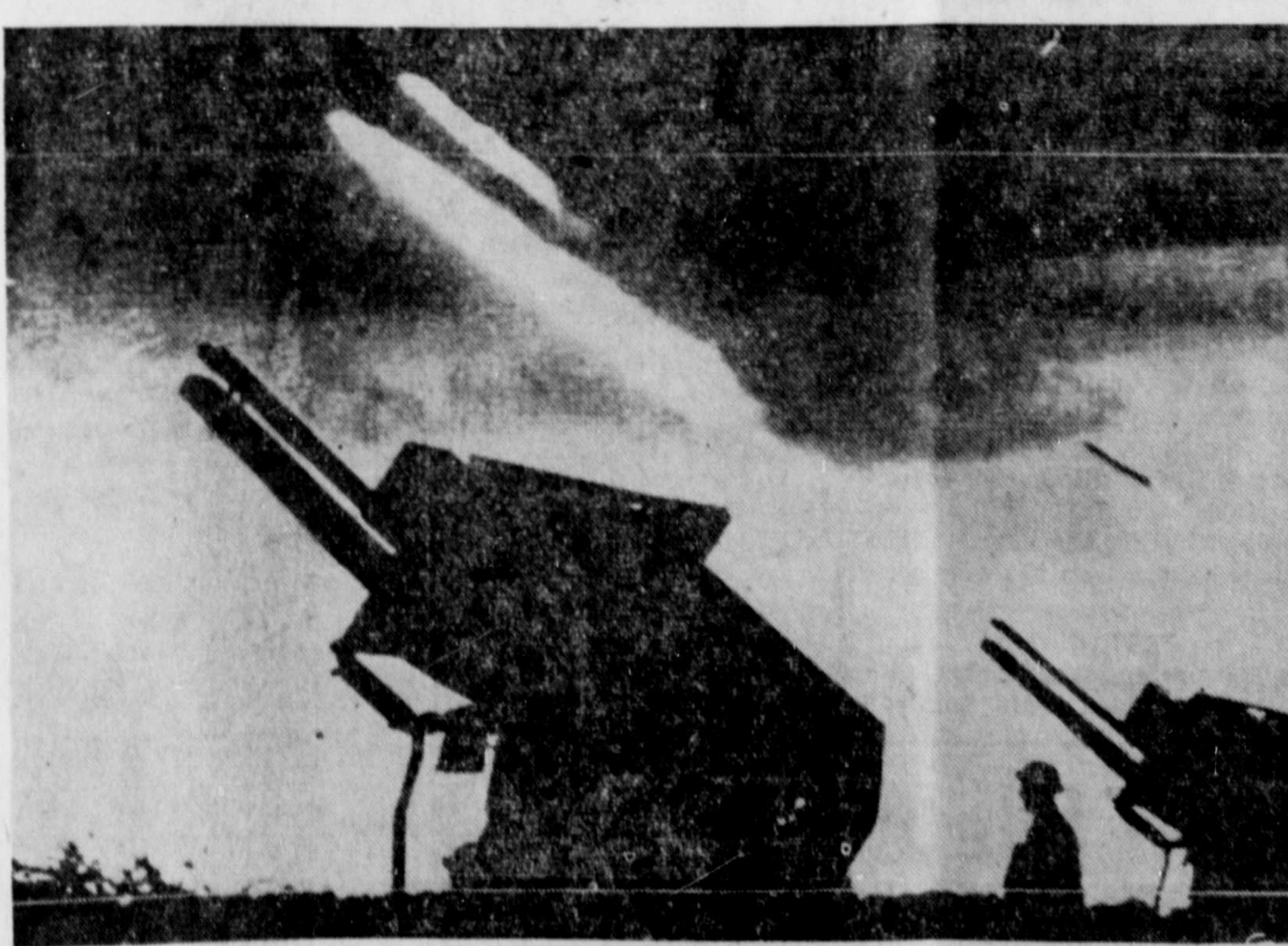
BRITISH A.A. ROCKET GUNS ROAR INTO THE NIGHT—A picture just released showing the British rocket guns in action against Nazi air raiders. The rockets leave their guns with thundering roars and burst in explosive patterns against the night sky. These rocket guns have been in use for about two years. Construction and range of the weapon are still secret.

KINGSTON — Jamaica's crop of citrus fruits is the largest for many years, being estimated at 750,000 boxes. Factories on the island are now making pulp and concentrated juices in large quantities.