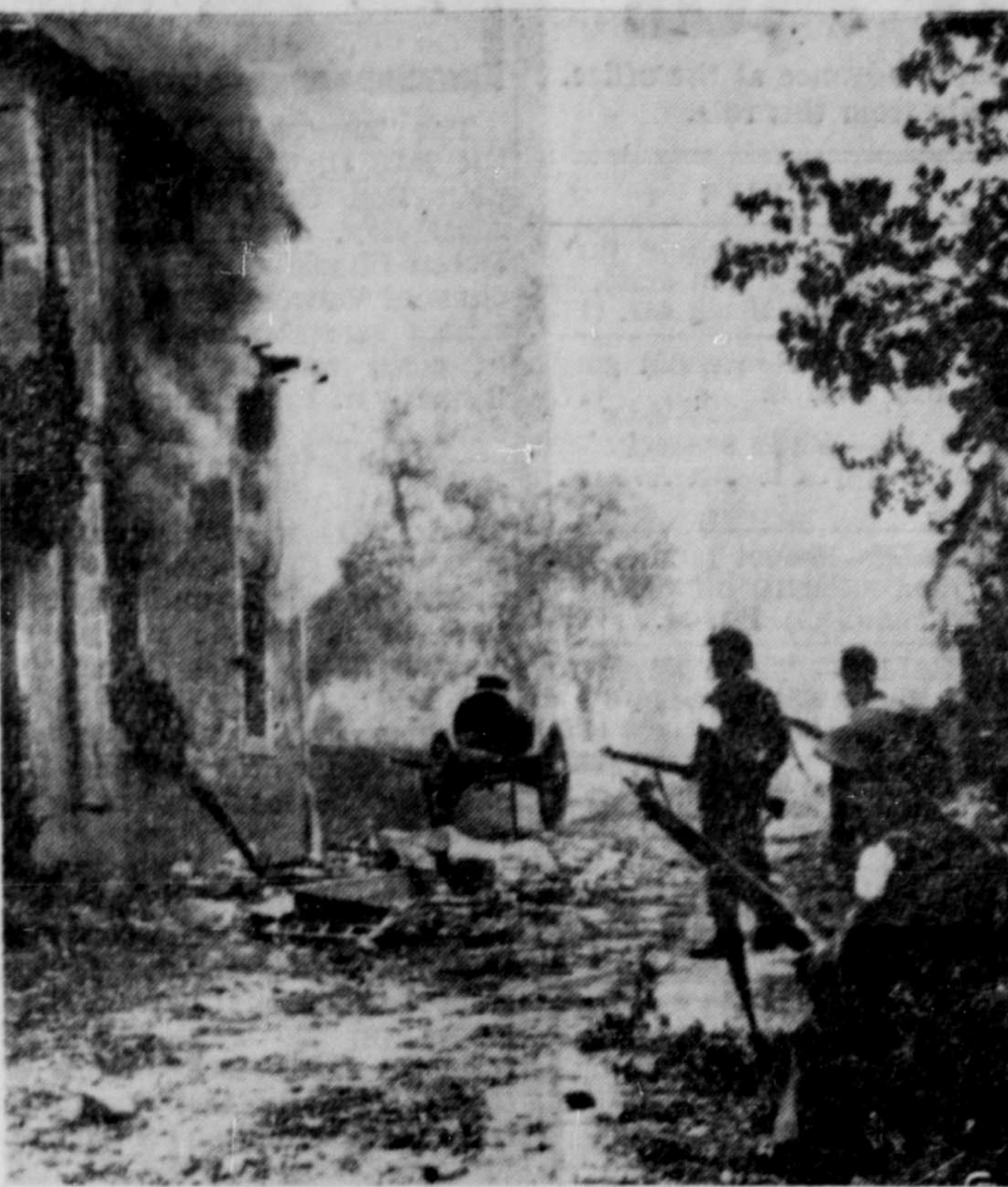
SMOKING OUT A SNIPER — Rifles ready, British Tommies wait for German snipers who had holed up in this farm near Tilly-Sur Seules, France, to make a break as the building burns. This was in the village of Christot, where the Germans left many snipers to harry the pursuing Tommies driving for Tilly.