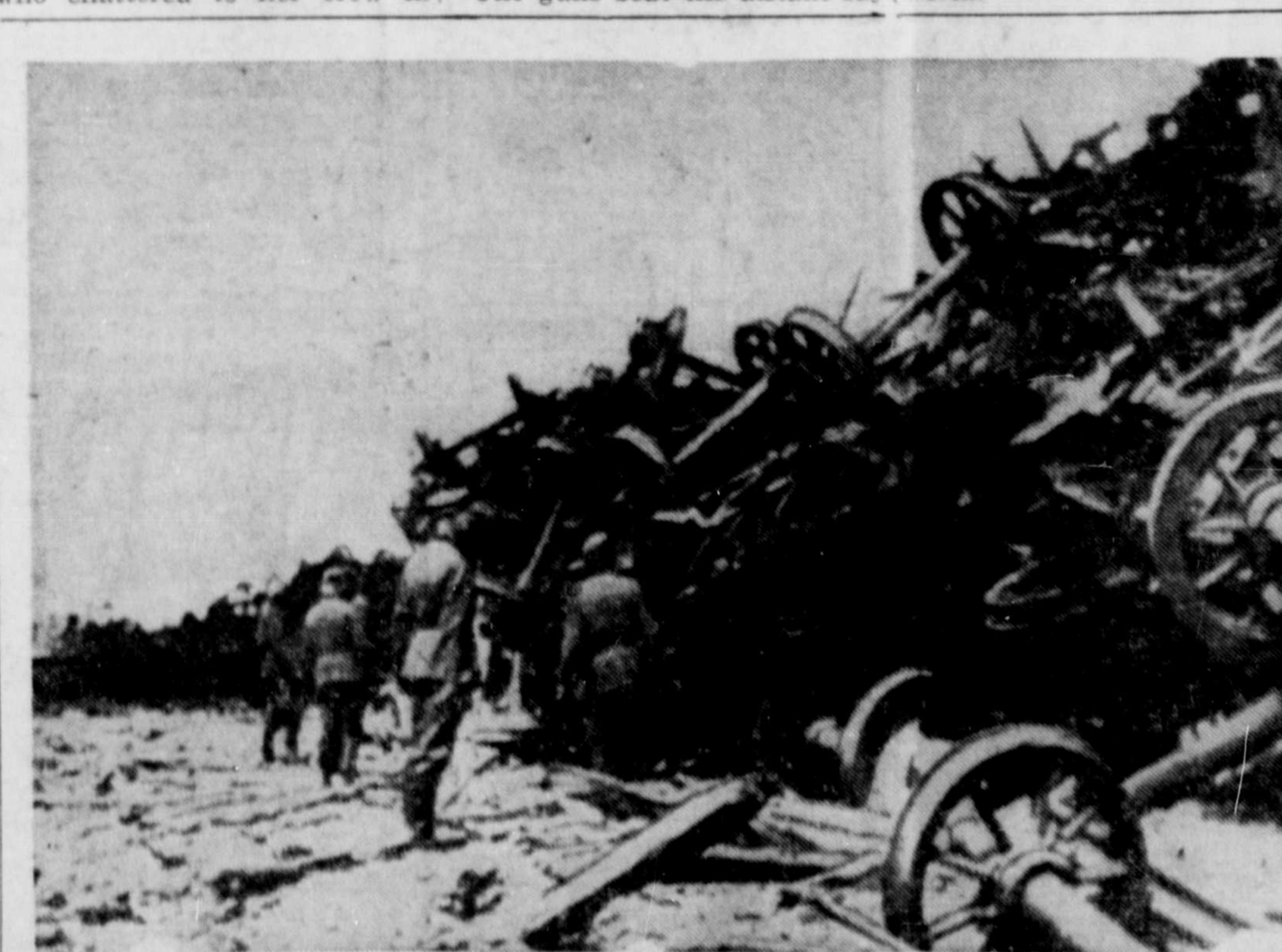
NAZI ROLLING STOCK IS BOMBED TO JUNK—Striking evidence of the efficacy of Allied bombings of German railroads and German-operated railroads in occupied countries in this picture, taken from a captured German film and incorporated in "March of Time's" newsreel "underground report." Multiply this by a thousand and you may have an idea of what Allied bombs have done to rail centres in pre-invasion bombings of Nazi communications.