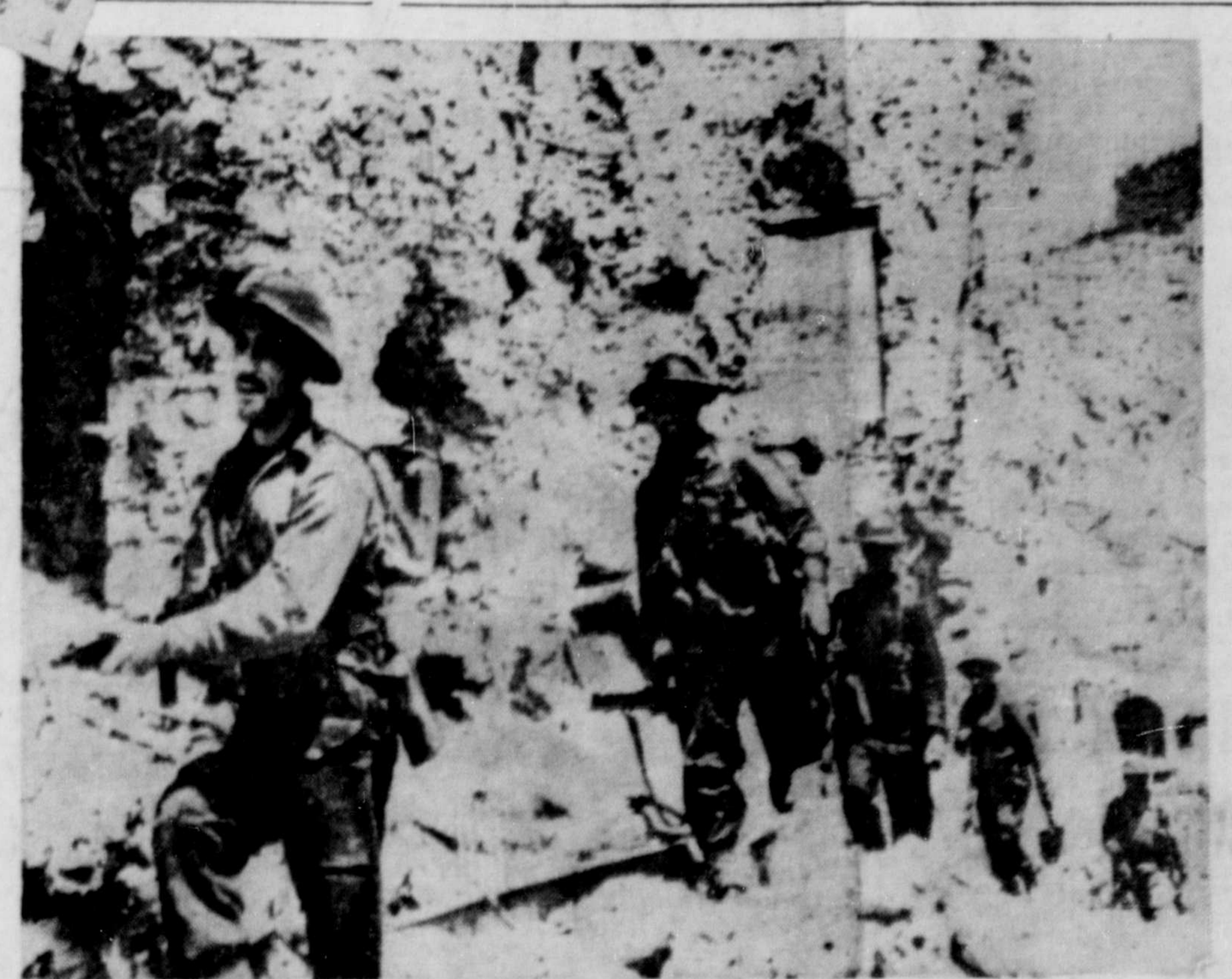
BRITISH PASS "HOTEL DE ROSES" IN CASSINO — British troops of the 8th Army file past the ruins of the "Hotel de Roses" in battered Cassino after the long-besieged town fell May 18, trapping part of the first parachute division who surrendered.