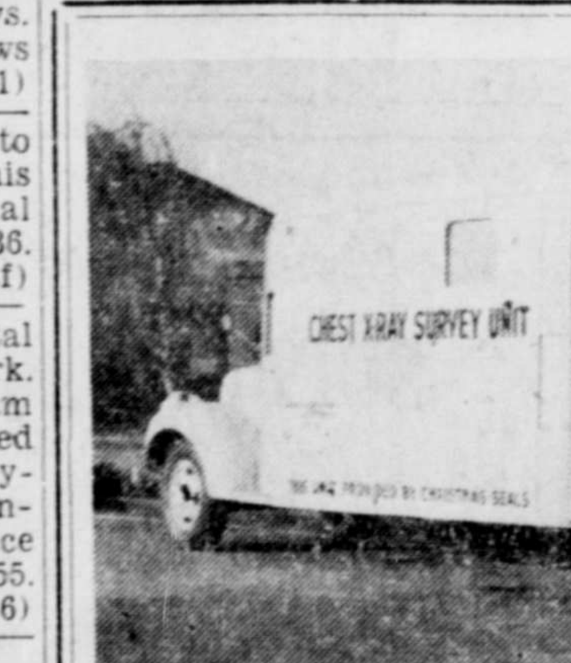
CHEST X-RAY SURVEY UNIT

General Agent Ace-Tex Products—Tile Flooring Felts and Cement 1st Ave. E. — Phone Black 884