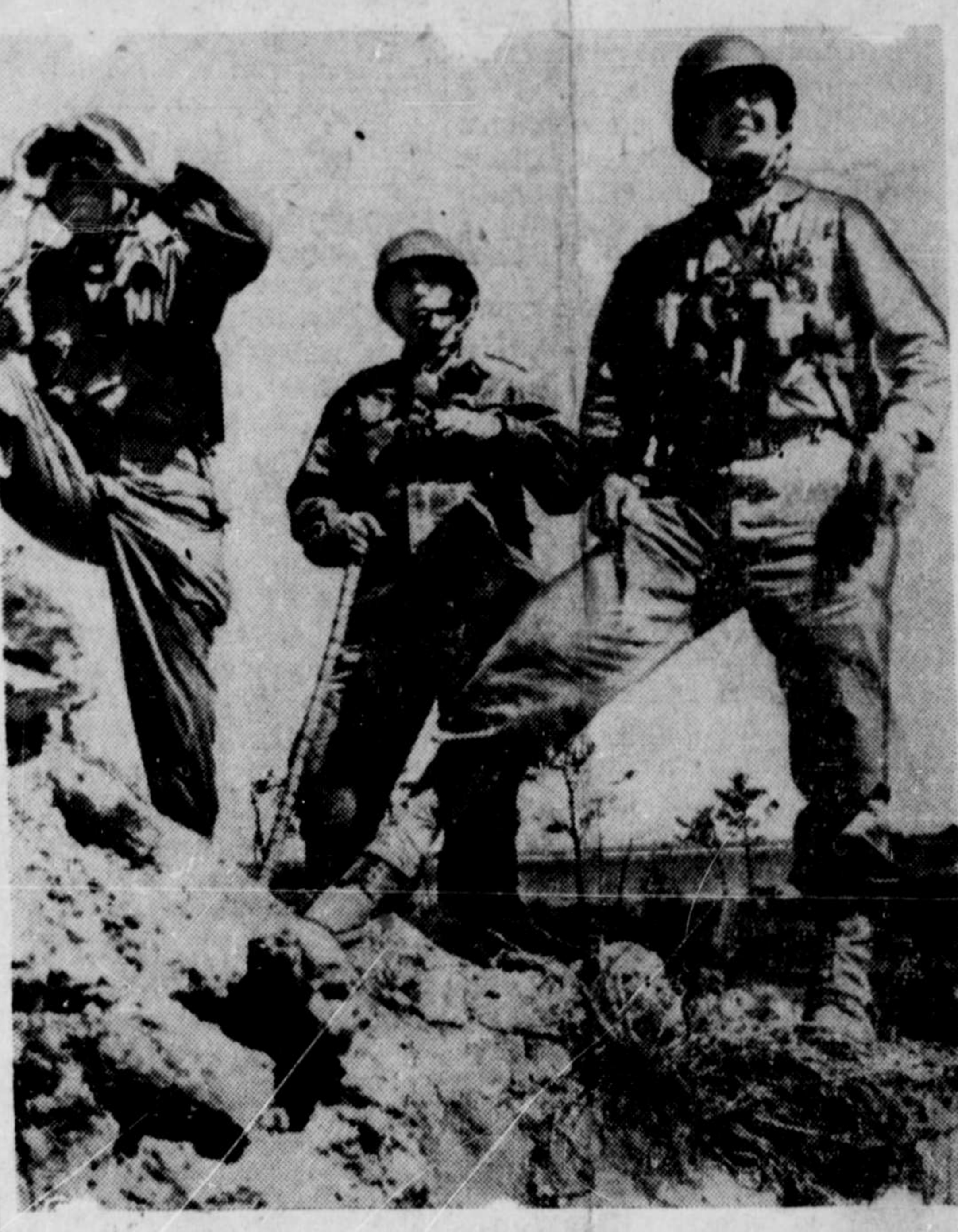
KILLED AT BATTLE ON OKINAWA —Lieut.-General Simon Bolivar Buckner, Jr., commander of the U.S. Tenth Army, who was killed at Okinawa, is shown (left) on a rocky observation post on Naha, capital of the island. With Gen. Buckner are Major-General Lemuel C. Shepherd, commander of the Sixth Marine division (center) and Brigadier-General William T. Clement, his assistant commander. Buckner was formerly in Alaska.

MOSCOW, June 20 —Trial of the 16 Poles in Moscow was highlighted today by testimony concerning the former premier of the Polish exile government, Stanislaw Mikolajczyk. The military board of the Soviet supreme court claims to have evidence that Mikolajczyk knew nothing about alleged anti-Russian activities of the Polish underground army. What's more, witnesses had testified that the underground leaders conspired to keep the premier in the dark—that they agreed that Mikolajczyk should not be informed of their alleged plan of action. Thus he is apparently absolved of any connection with the anti-Soviet plot ascribed to the 16 defendants.