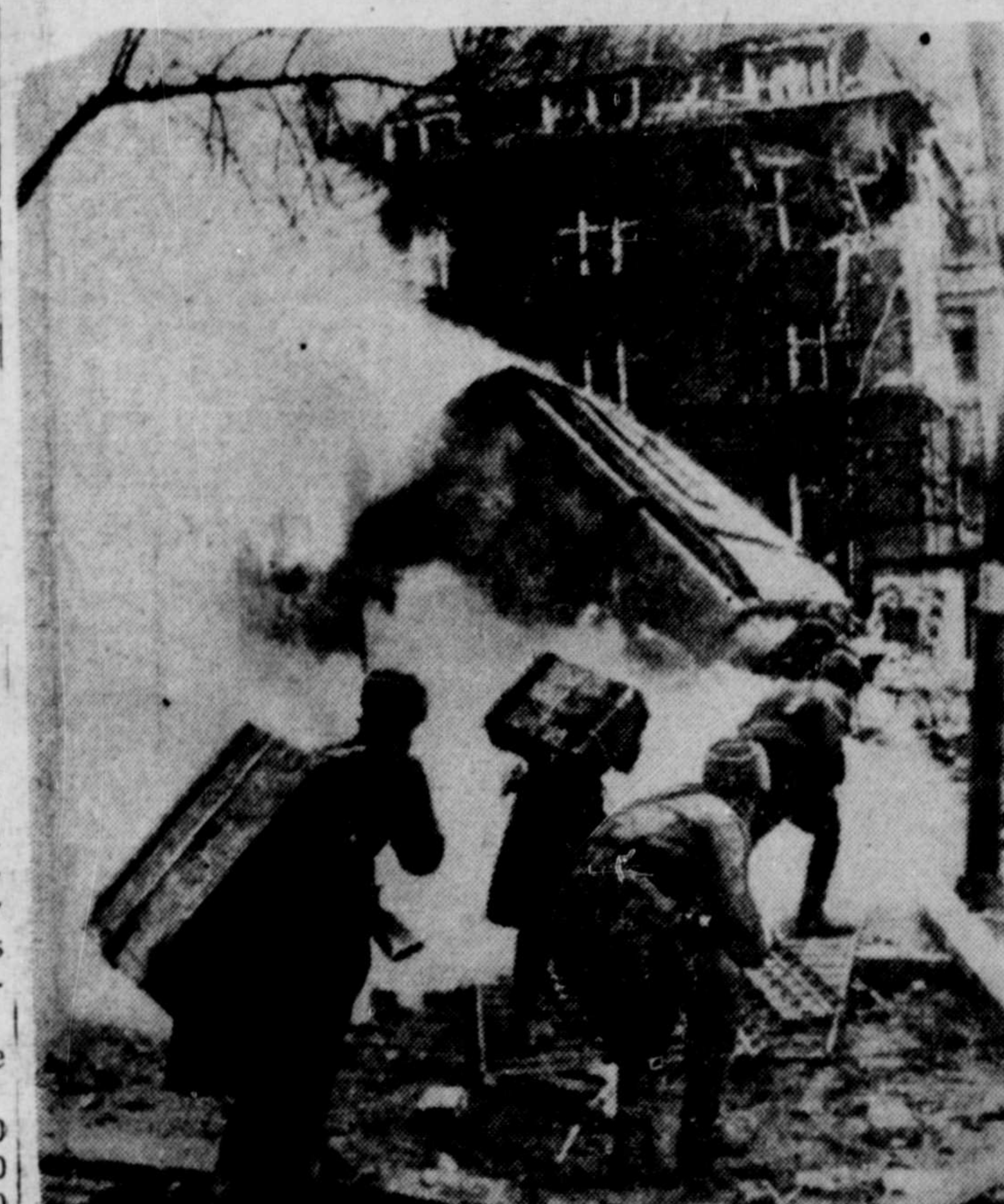
SOVIET SAPPERS IN TRICKY OPERATION—An assault group of Red Army sappers is shown advancing towards a building in Breslau with the intention of blowing it up.

Of the money at hand to build a new home, $6,800 was raised by public subscription, and $7,500 was contributed by the city.