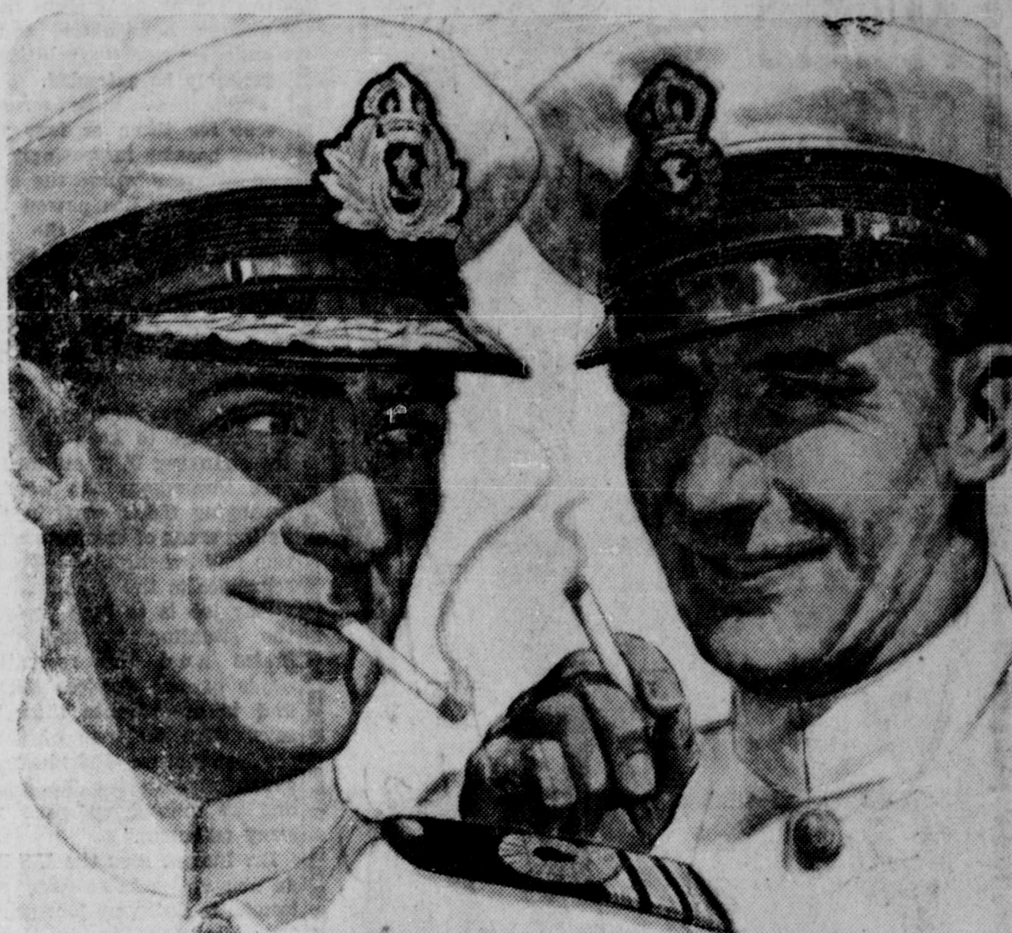
PLAYER'S MILD Have "Wetproof" paper which does not stick to the lips.

CINQUE PORT HARD HIT Prince Rupert, B.C. THE DAILY NEWS PAGE FIVE RYE, England 6—This tiny Sussex Cinque port—peacetime haunt of artists and holiday makers—is faced with a post-war reconstruction bill of about £73,000 ($328,500) for drainage works.