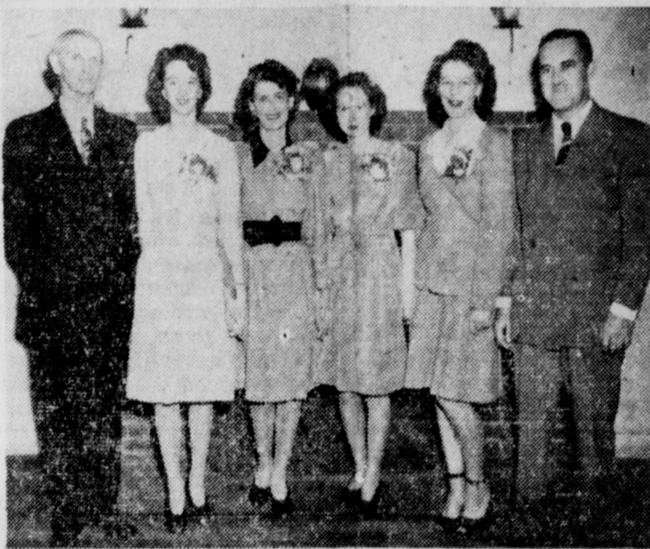
QUEEN CANDIDATES HONORED—This picture was taken a few nights ago at the USO Club here when four Carnival Queen candidates were honored...