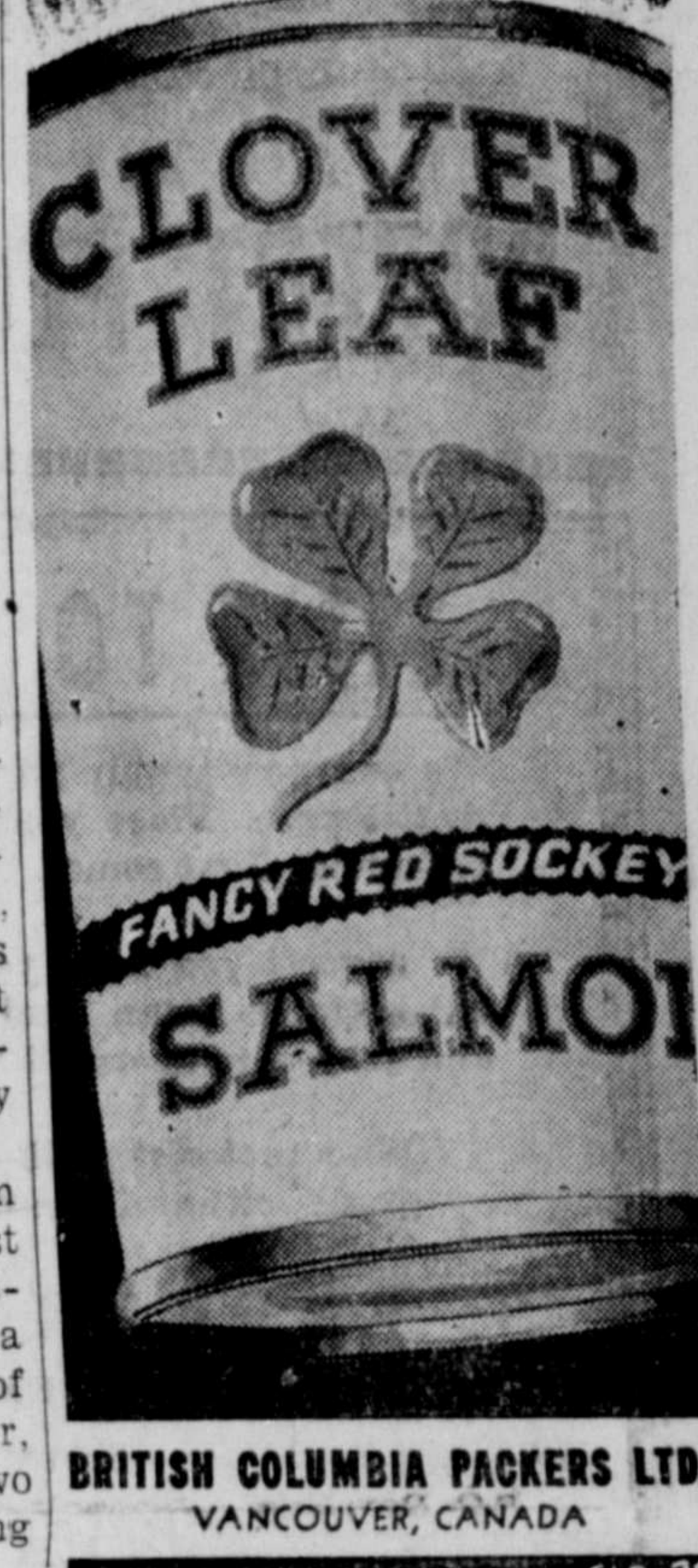
BRITISH COLUMBIA PACKERS LTD. VANCOUVER, CANADA