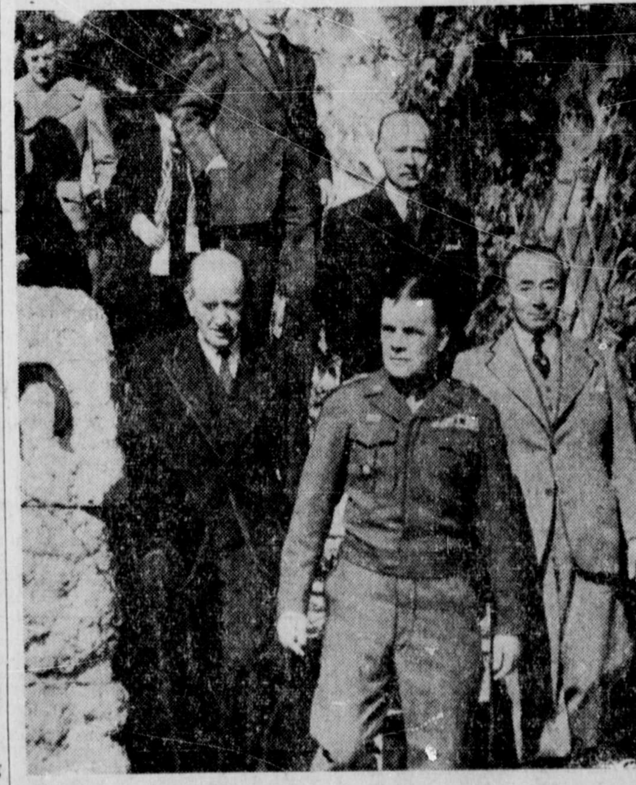
FAMOUS FRENCHMEN RELEASED—Edouard Daladier, left, former prime minister of France, as he was liberated by American forces...