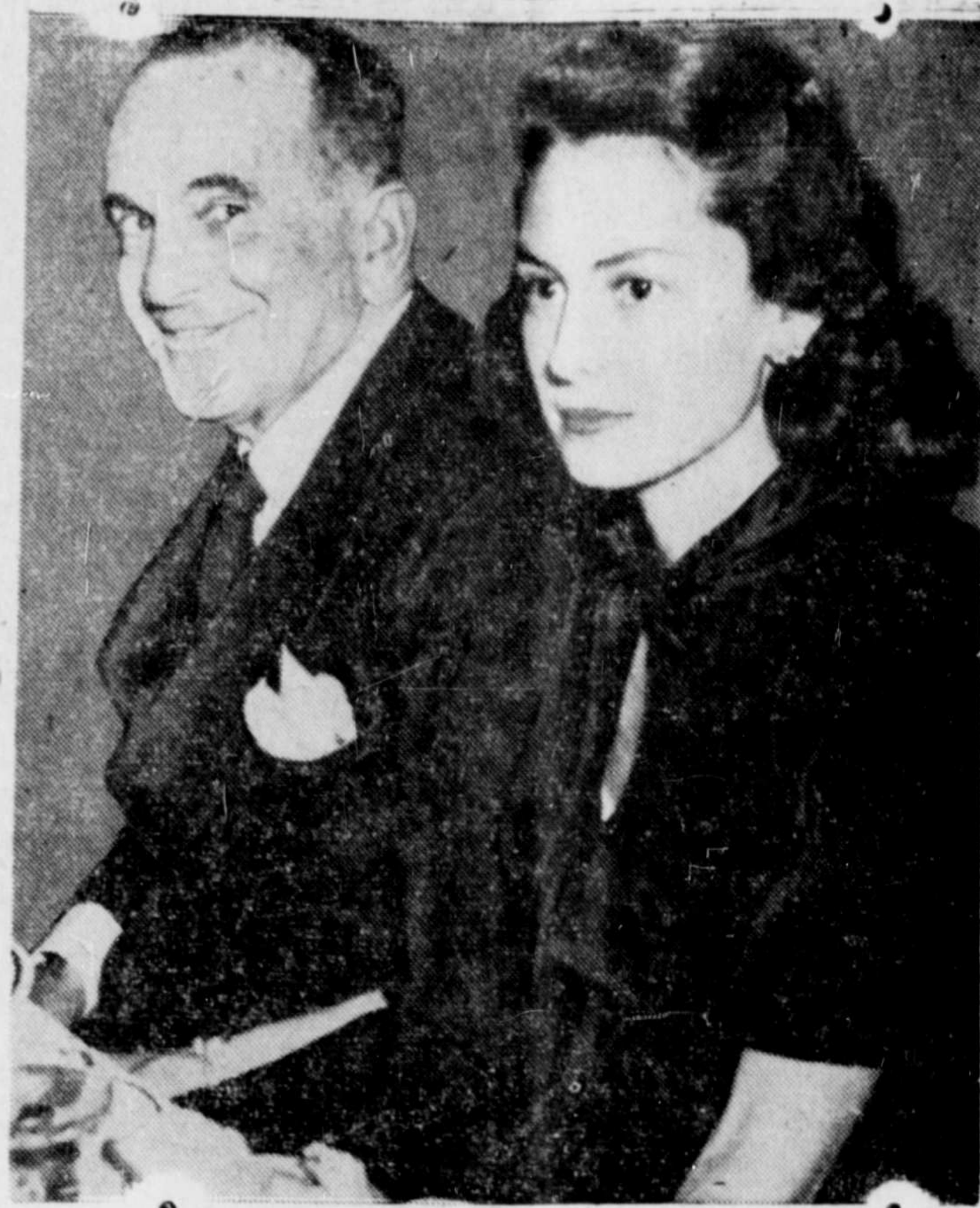
JOLSONS SEEING NEW YORK —Al Jolson, mammy singer extraordinary, is shown with his lovely wife, the former Erle Galbraith, film actress, dining in New York. The popular couple will soon motor to Palm Springs, where Al and Mrs. Jolson are going to raise "dogs." Jolson has been making a terrific comeback since the release of the movie based on his life, which will be shown in Prince Rupert soon.

THURSDAY—A.M. 7:30—Musical Clock 8:00—CBC News 8:15—Morning Concert 8:45—Music for Moderns 9:00—BBC News 9:15—Morning Devotions 9:30—Little Concert 9:45—Morning Melodies 9:59—Time Signal 10:00—Music by Goodman 10:15—Organ Encores 10:30—Roundup Time 10:45—Scandinavian Melodies 11:00—CBR Presents 11:15—Songs of Today 11:30—Weather Forecast 11:31—Message Period 11:35—Recorded Interlude 11:45—Easy Listening — P.M. — 12:00—B.C. Farm Broadcast 12:25—Program Resume 12:30—CBC News