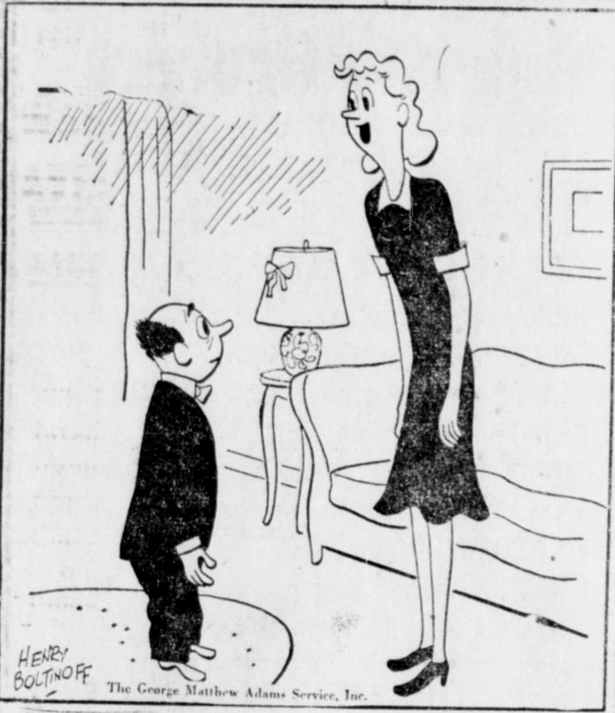
"If you're going to propose, you don't have to bother getting down on your knees."