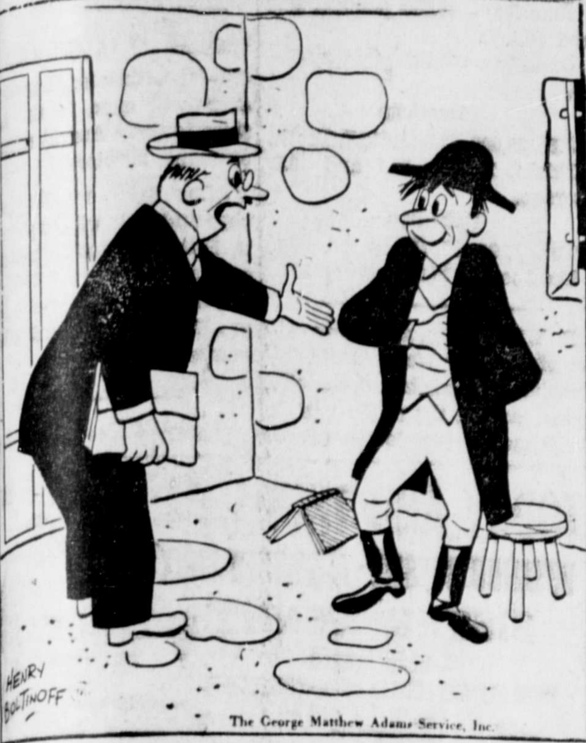
"Our only hope is if you plead insanity!"