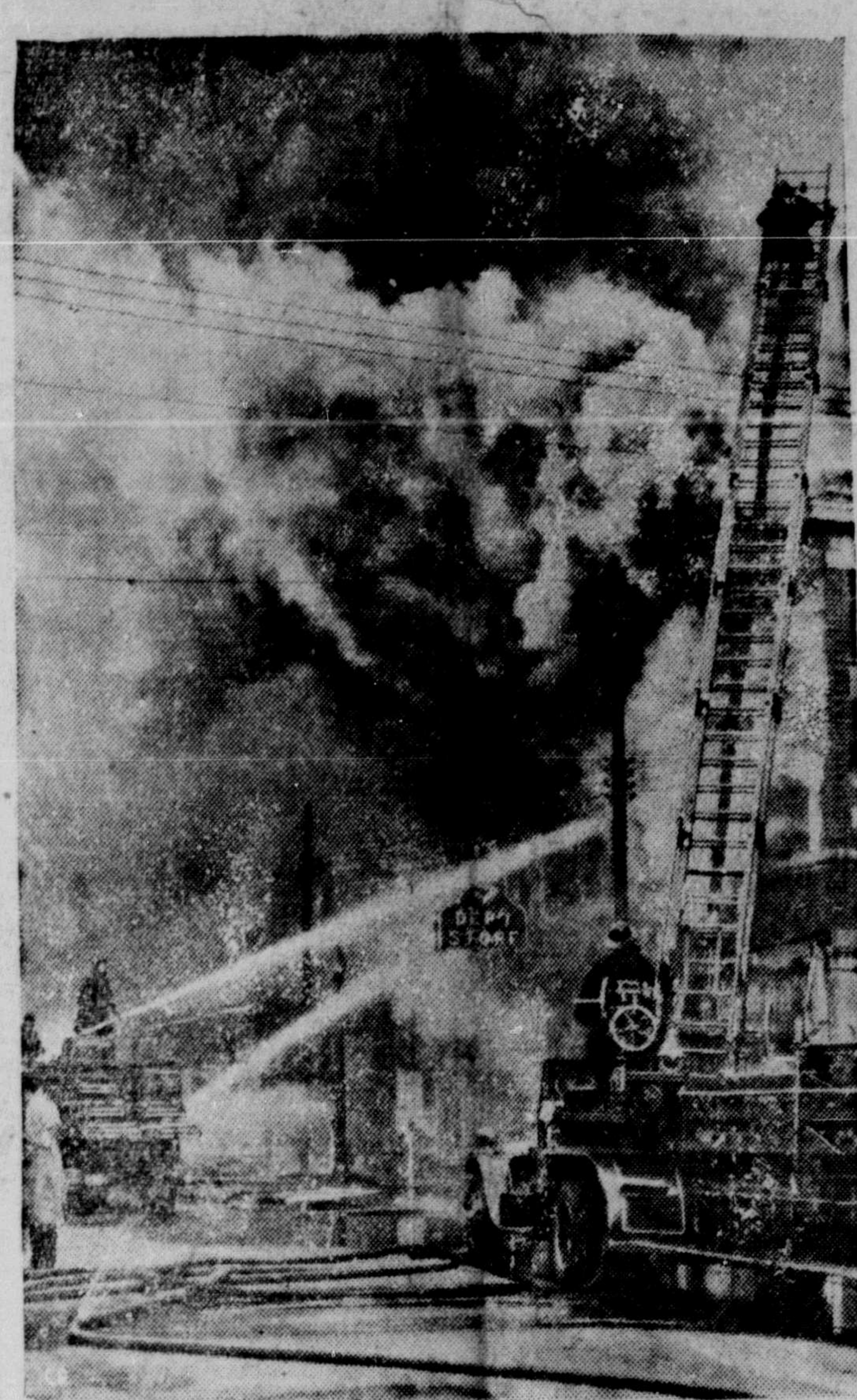
DAMAGE HEAVY—Damage estimated at $750,000 resulted from a three alarm fire Tuesday in the business section of Windsor. Fifteen lines of hose and 19 pieces of fire equipment were used to fight the blaze which swept through Adelman's department store and caused extensive smoke damage to C. H. Smith Company, largest department store in the city. This photo shows firemen pouring water into the building during a three-hour battle against the flames.

Forty-Eight Thousand Ton Vessel Is Planned WASHINGTON—Announcement has been made by the Maritime Commission that early in 1949 building will commence of a 48,000-ton liner, the largest ever built in the United States. Cruising speed will be 28.5 knots. There will be peace-time facilities for 2,000 passengers. As a troop transport, it will be able to handle 12,000 men, with equipment.