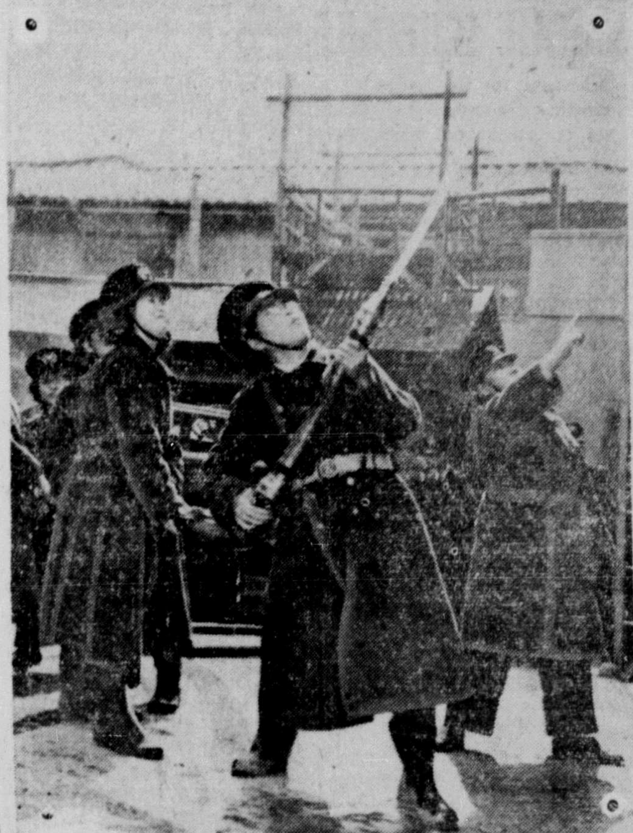
MAN THE HOSE, LADIES!—As part of Tokyo's fire prevention week, fire department officials turned over one of their firehouses to some of the city's housewives, to familiarize them with the importance of adequate fire prevention techniques. Some of the lady firefighters are shown manning the hose in true professional style, after they answered a mock firecall and hurried to put out a small "set" fire.