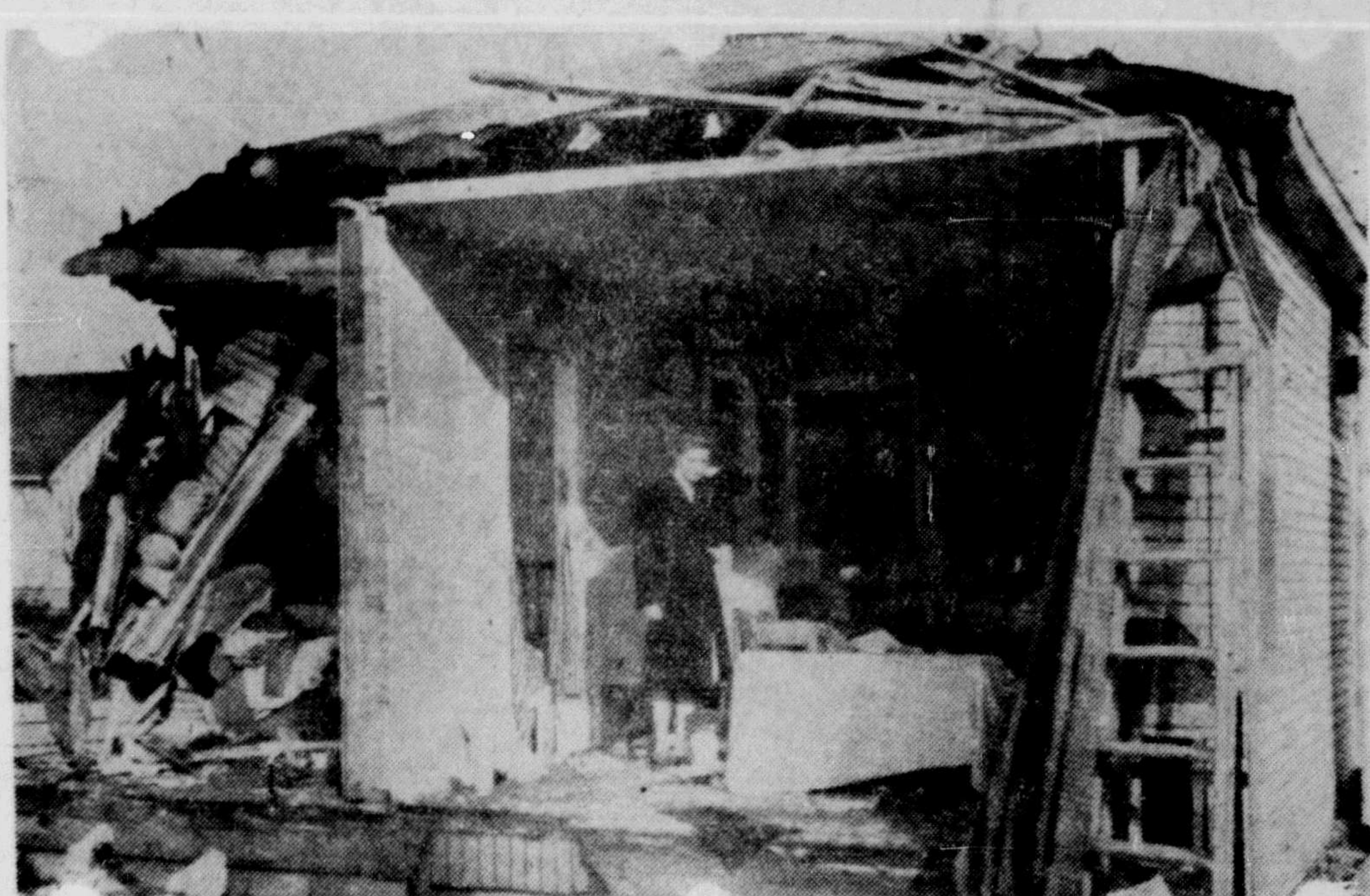
TORNADO CAUSES WIDESPREAD DAMAGE IN MIDWESTERN STATES — An unidentified woman (above) is shown standing amidst the ruins of her home at Porter, Indiana, after it was ripped apart by the tornado which swept through sections of Illinois, Indiana and Kentucky. Five persons were reported killed and many injured by the twister, which inflicted heavy property damage.