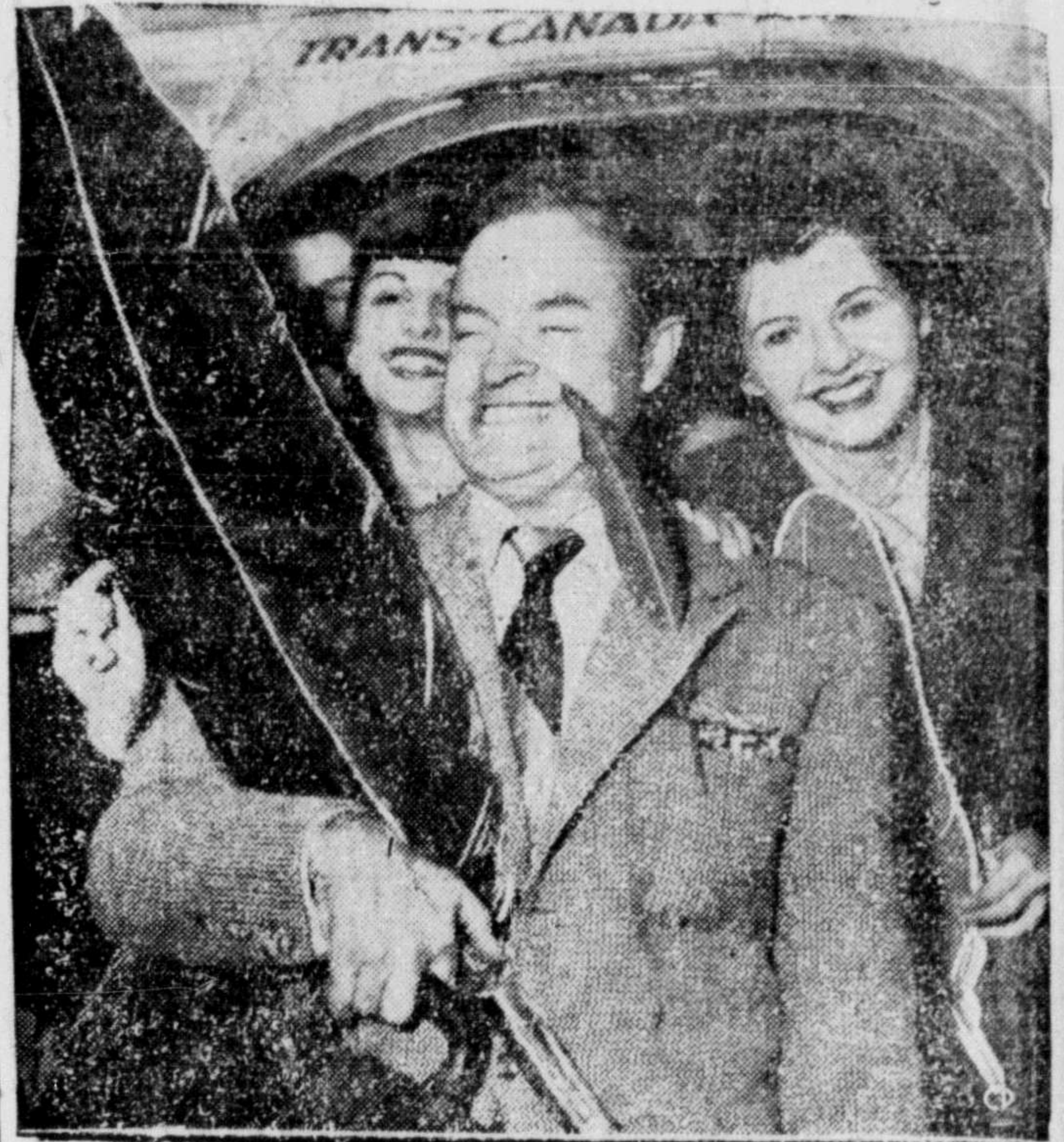
NOSE-TICKLER —The Red Feather, symbol of the Community Chest campaign, tickles one of the most famous noses of the continent as Bob Hope pokes his ski-jump proboscis out of a Trans-Canada Air Lines plane on his arrival at Toronto. The comedian's appearance opened a schedule of four Canadian appearances. His other stops were Guelph, Windsor and Montreal.