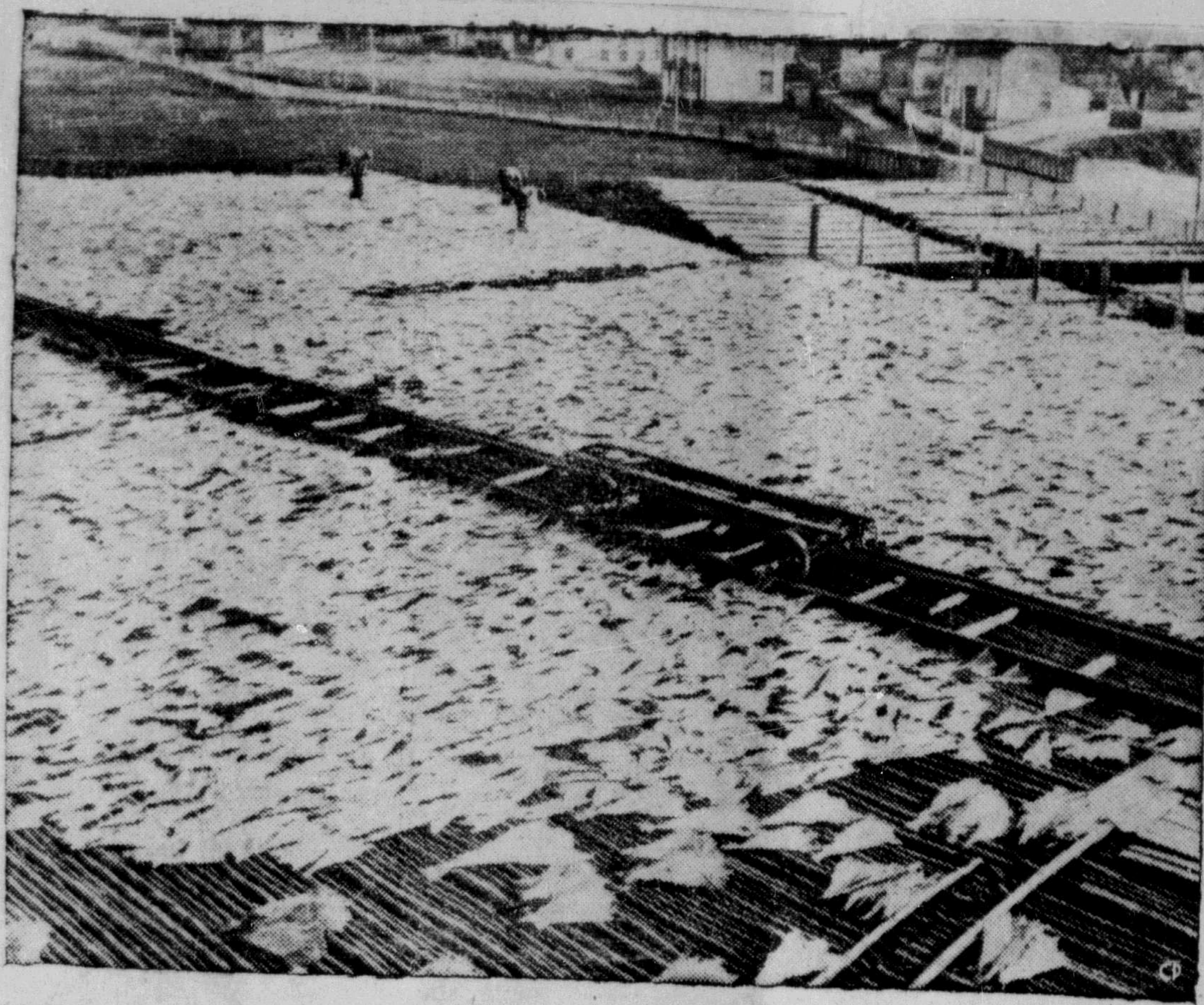
DRYING COD —A familiar site at any fishing centre in Newfoundland is the cod fish being dried and "made" on the "flakes" or stages. For more than four centuries cod from Grand Banks has been the island's prime export. In at least one area some experimenting has been done with artificial fish dryers but the bulk of fish is dried as shown here.

MAN'E VASSAL The moth of the silkworm has lost the ability to fly and is completely dependent upon man for survival.