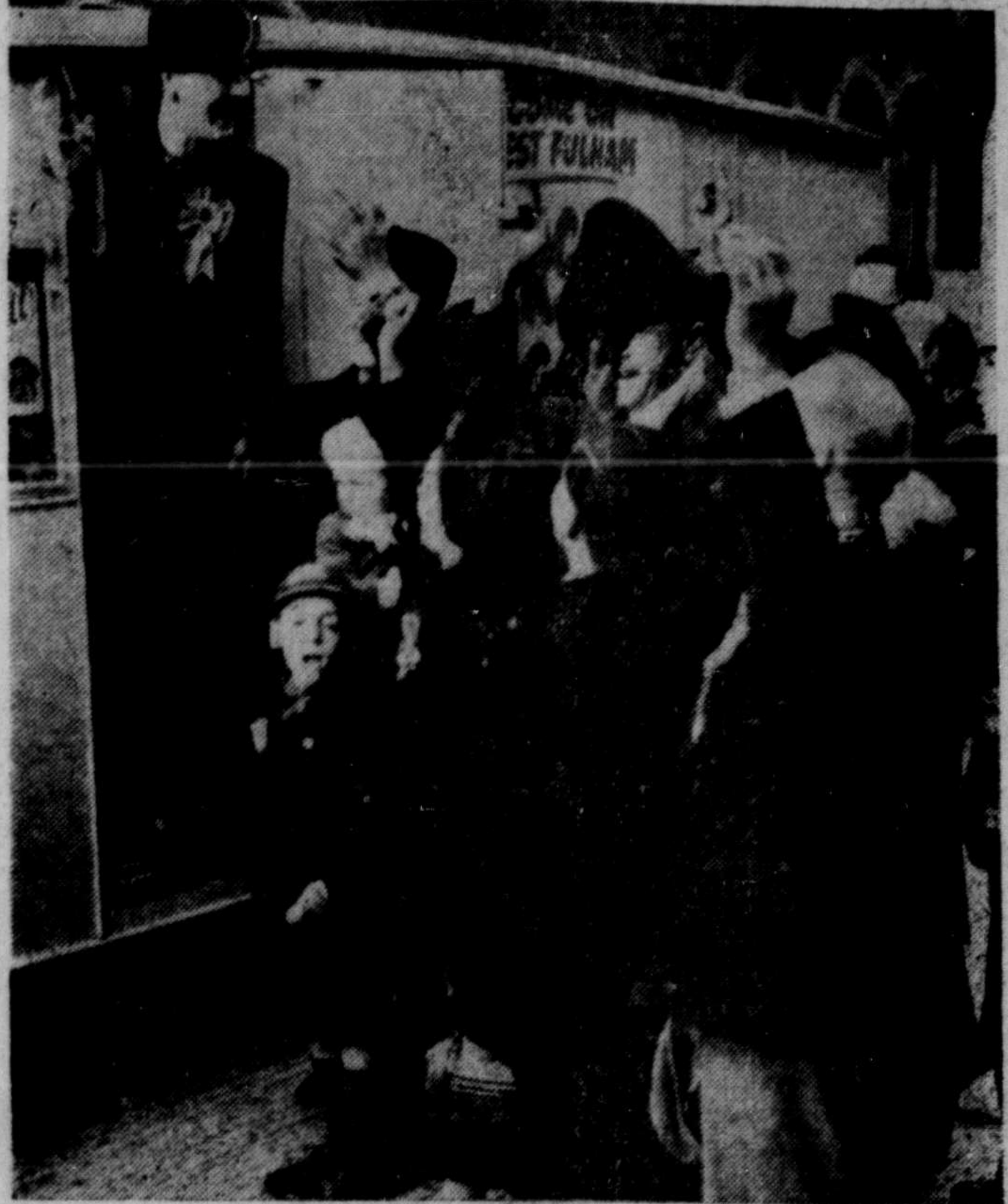
TRAVELLING PROPAGANDA DISPENSARY—Labor candidate in Britain's election, Dr. Edith Summerskill, food advisor to all of Britain's housewives, hoped to speak to all of her constituents in Fulham West. She travelled by trailer full of pamphlets telling of the accomplishments of the Labor government.

February building permits in Prince Rupert numbered eleven and amounted to $4,728, considerably lower than January's $11,700 total.