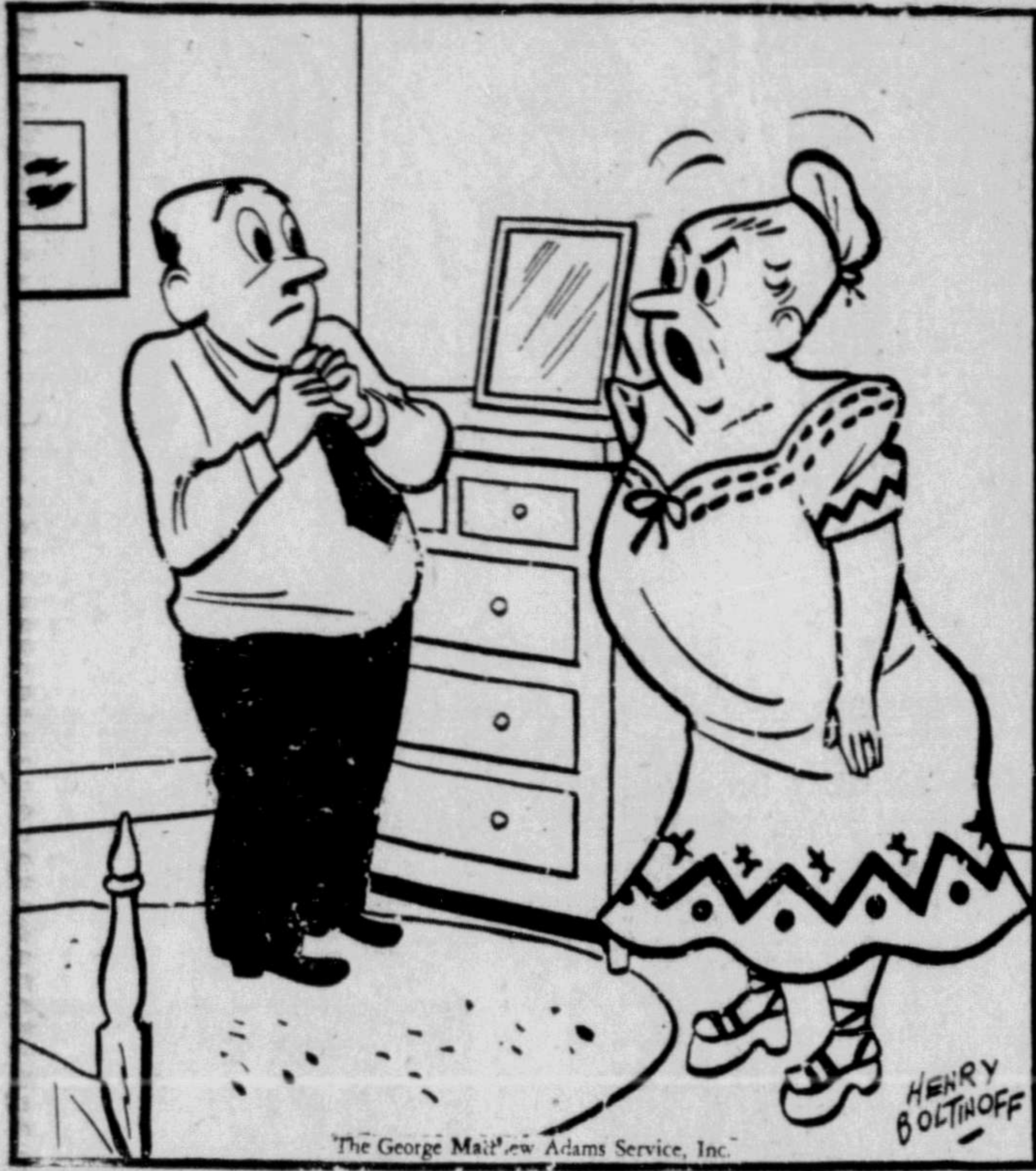
"We are not going to a costume party... It's the latest style!"