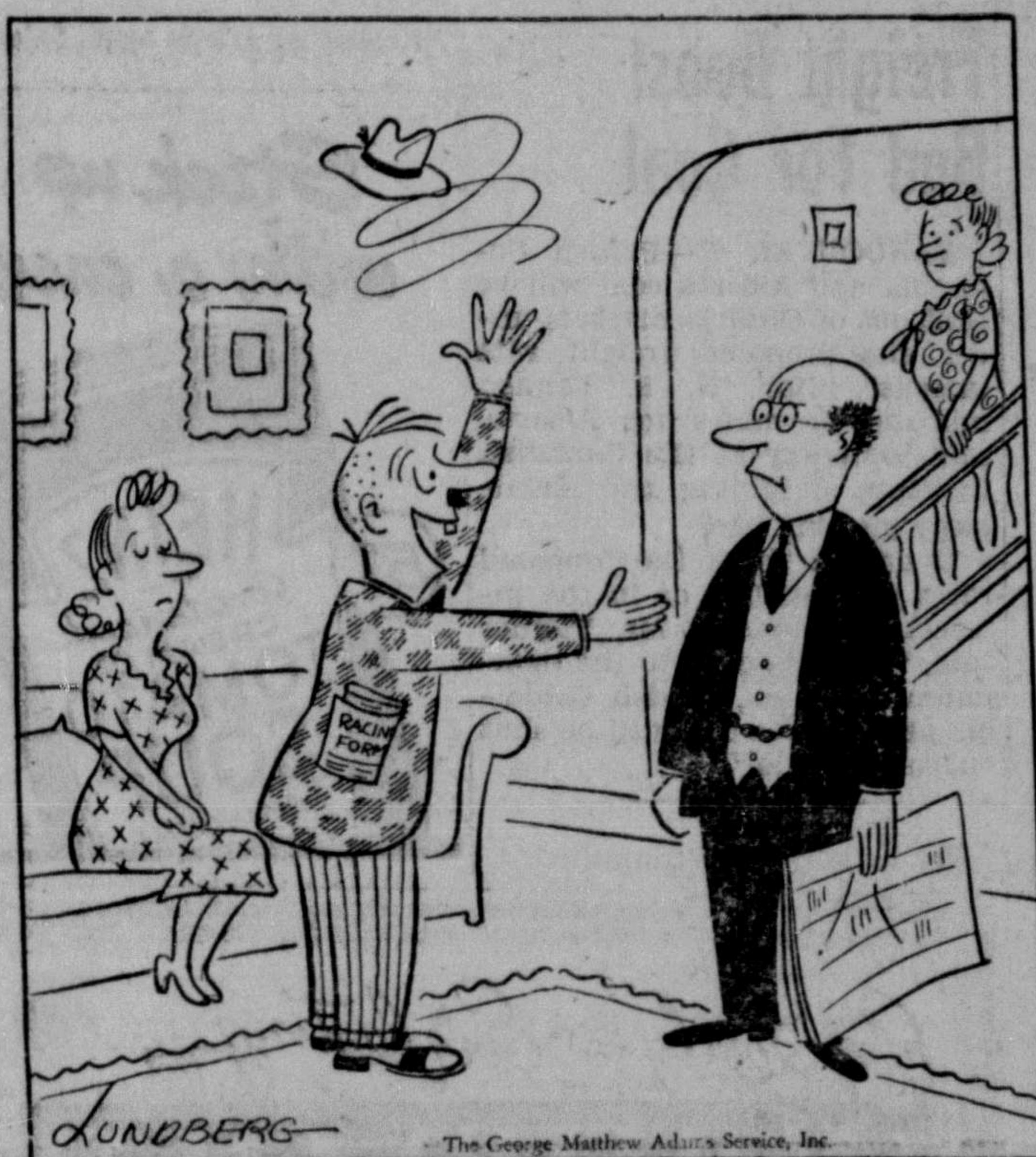
"Shake, pal. You're going to have yourself a son-in-law!"

GOOD FISHING OSLO—Most of the large Norwegian fleet which has been fishing off western Greenland has returned to report fishing most satisfactory. It is estimated the 1950 catch there will total 12,000 tons of cod, about twice as much as last year.