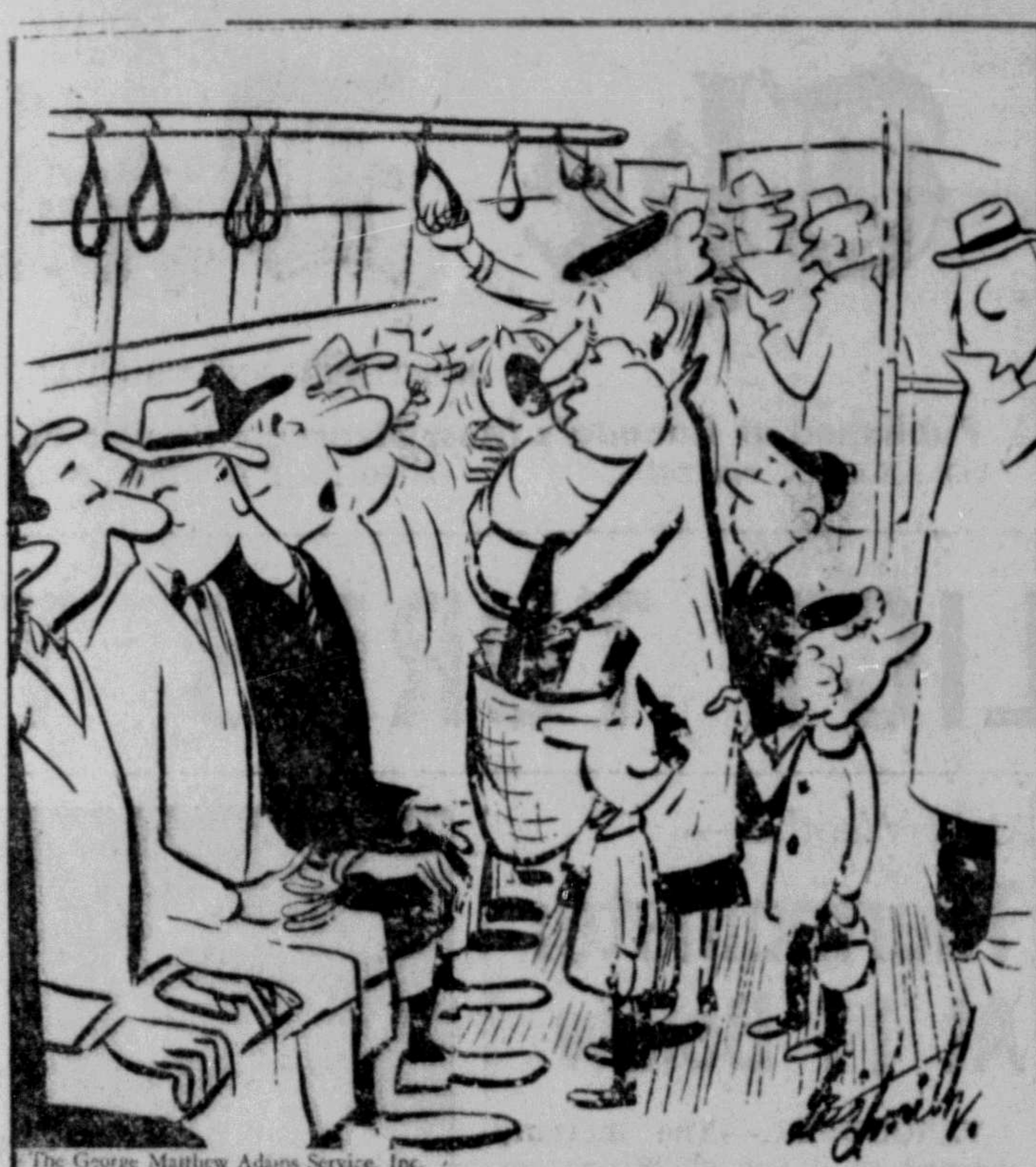
"Perhaps I could hold one of the babies?"

You know Sir, a plant such as you no doubt will see when the Rotary or some other organiza-