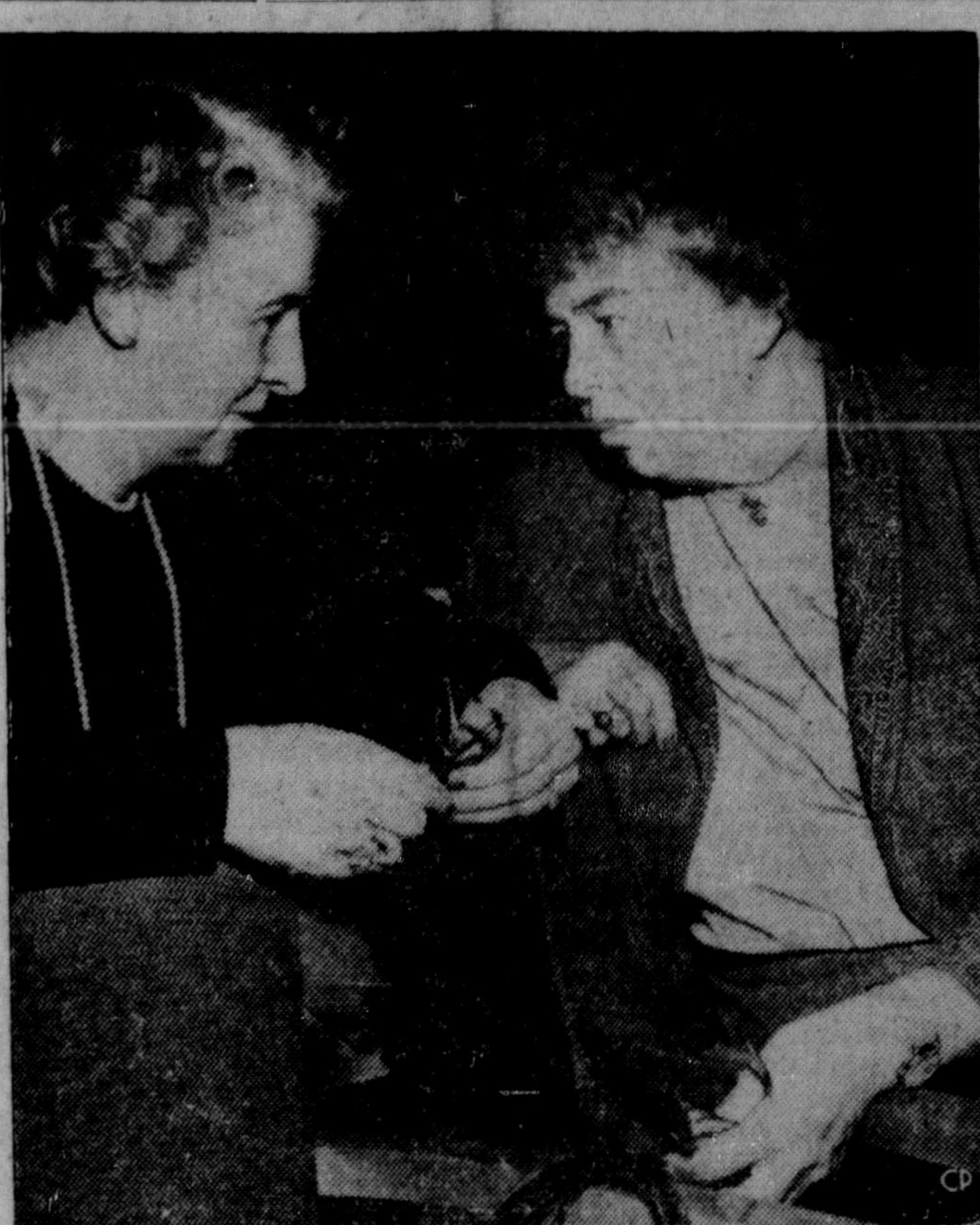
WOMEN DELEGATES—Mrs. D. B. Sinclair, executive assistant to the Canadian deputy health minister, chats with Mrs. Eleanor Roosevelt of the U.S. delegation during the Fifth General Assembly of the United Nations.

HOCKEY SCORES NATIONAL Toronto 5, New York 3 Detroit 3, Boston 3 (tie) PACIFIC COAST New Westminster 6, Tacoma 9