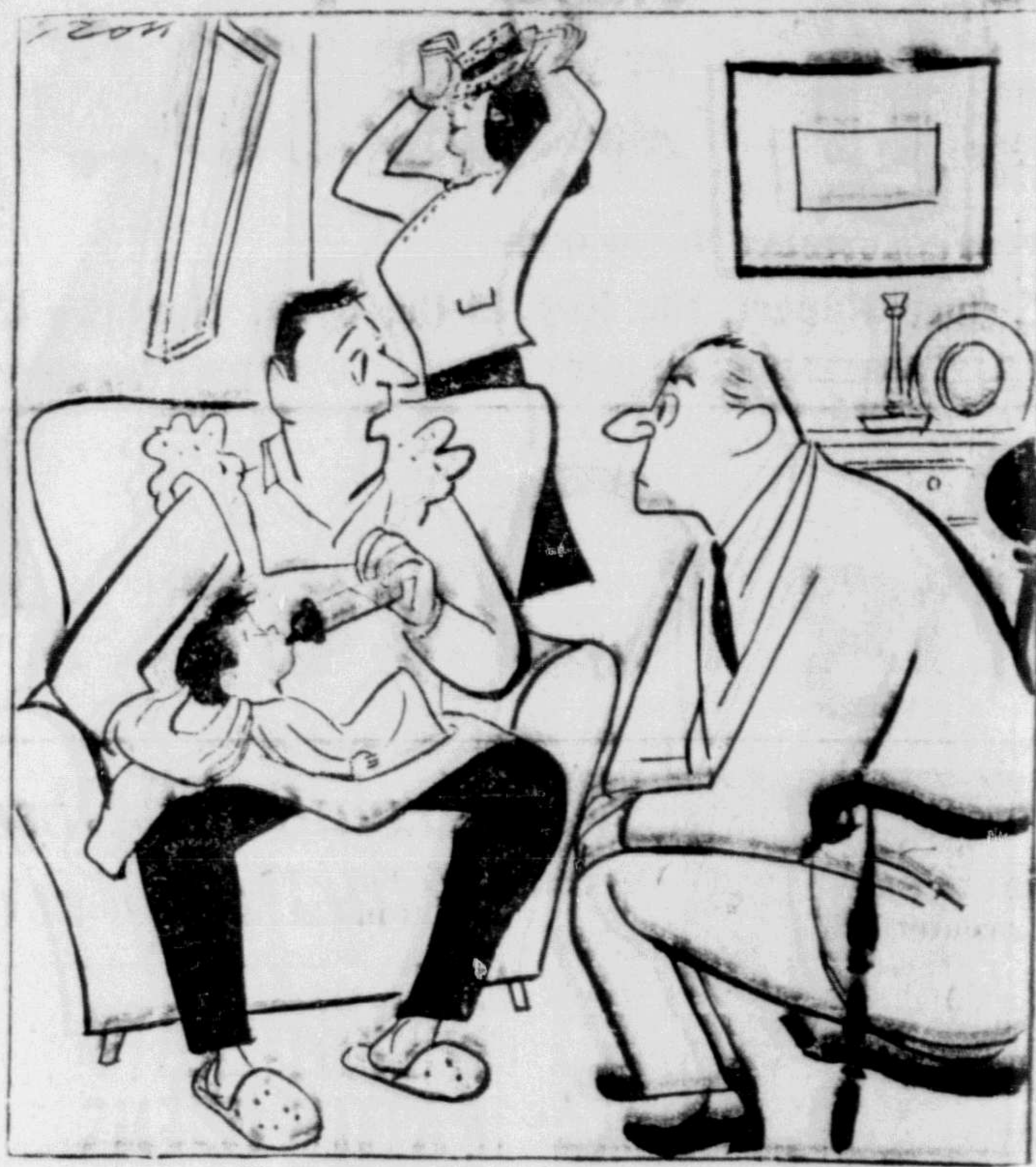
"My mistake was to take a father's course."