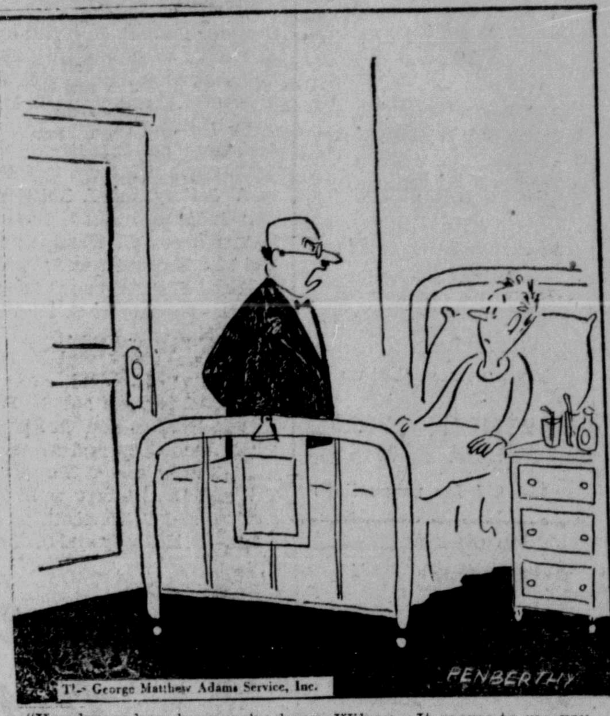
"You know how busy we've been, Wilson. It seems to me you could've picked a better time than this to have a nervous breakdown."

You can find quick relief with DOLCIN... the easy-to-take, prompt-acting tablets... blessed by hundreds of thousands of sufferers from the pain of Arthritis, Rheumatism and Sciatica. Get this safe, reliable product today. There are many substitutes for DOLCIN now being offered, usually at higher prices. Be sure you ask for and get the original DOLCIN Tablets. The letter "D" is stamped on every genuine DOLCIN Tablet for your protection. DOLCIN is sold by all druggists throughout the Dominion. 100 tablets for $2.99—200 tablets for $5.95—also available in bottles of 500 tablets. Dolcin Limited, Toronto 10, Ontario.