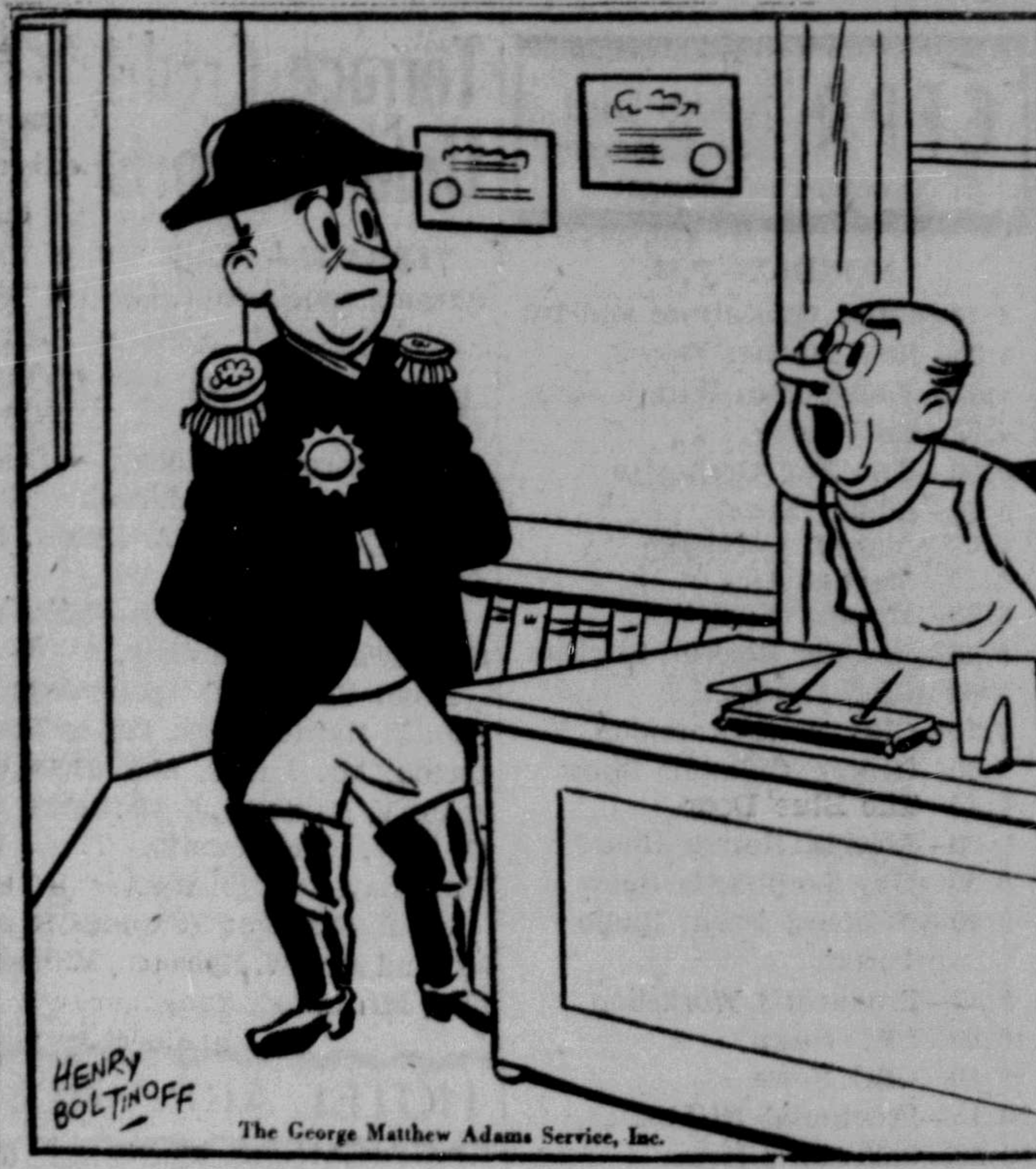
The George Matthew Adams Service, Inc.