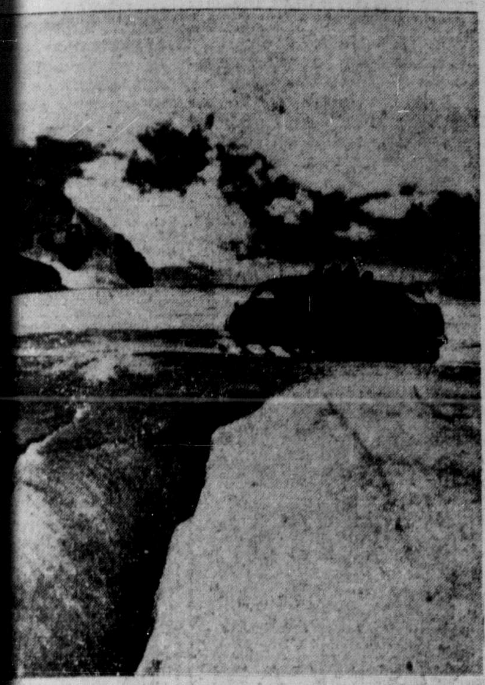
VISITING Jasper National Park in the Canadian their sightseeing in comfort as they ride the "snow-cross" the vast Columbia Icefield. The gigantic stretch snow, largest body of ice outside the Arctic Circle, area of 110 square miles.